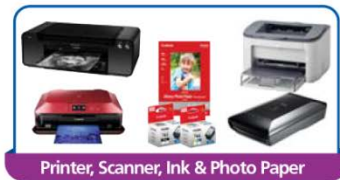
Printer, Scanner, Ink & Photo Paper