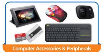
Computer Accessories & Peripherals