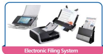
Electronic Filing System