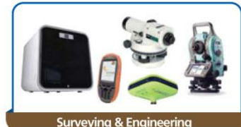
Surveying & Engineering