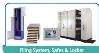
Filing System, Safes & Locker