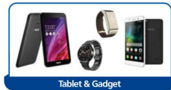
Tablet & Gadget