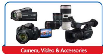
Camera, Video & Accessories