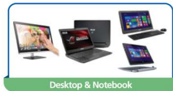
Desktop & Notebook