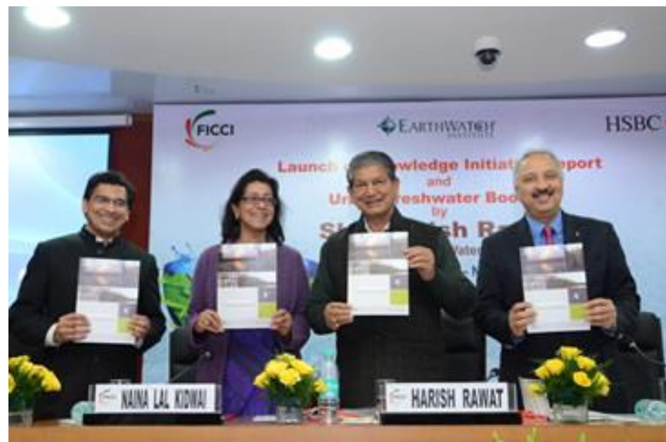
Image 12: FICCI-HSBC Knowledge Initiative: Sustainable Agriculture Water Management