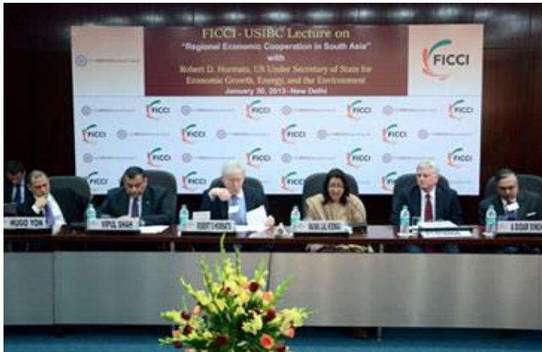
Image 5: FICCI-USIBC Lecture on Regional Economic Cooperation in South Asia with Robert D. Hormats, US Under Secretary of State for Economic Growth, Energy, and the Environment