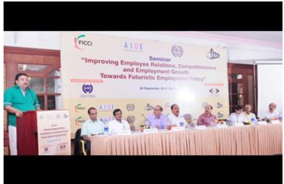
Image 4: Seminar on "Improving Employee Relations, Competitiveness and Employment Growth Towards Futuristic Employment Policy"