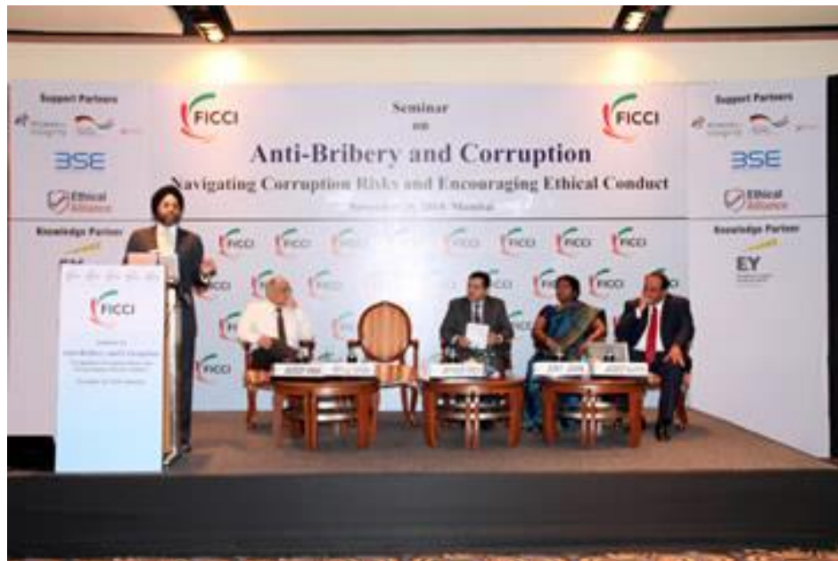
Image 21: Seminar on Anti-Bribery and Corruption - Navigating Corruption Risks and Encouraging Ethical Conduct