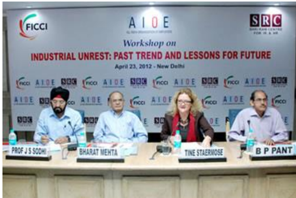
Image 1: Workshop on Industrial Unrest: Past Trend and Lessons for Future