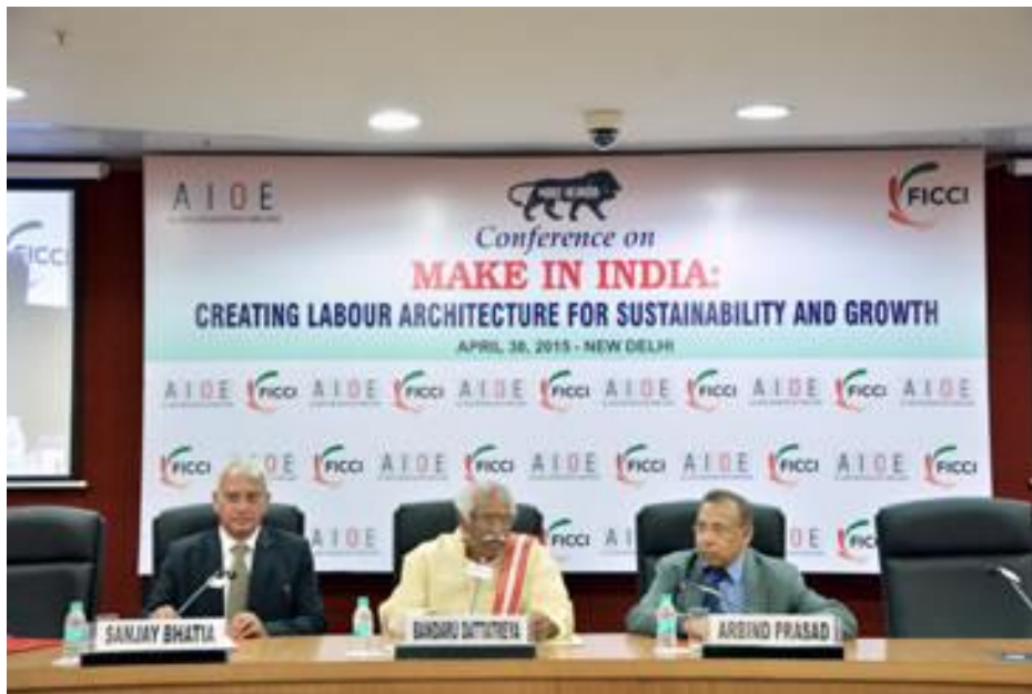
Image 3: Conference on 'Make in India: Creating Labour Architecture for Sustainability and Growth'