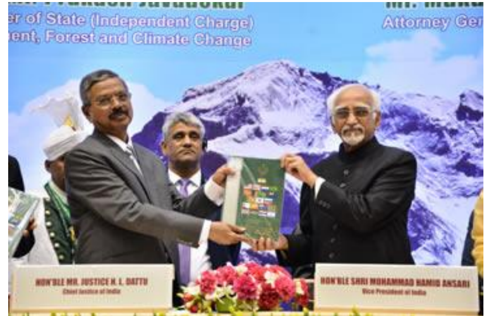
Image 8: NGT International Conference on Global Environmental Issues