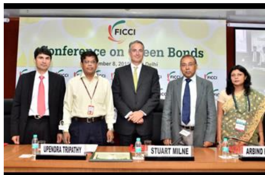
Image 10: FICCI Conference on "Green Bonds"