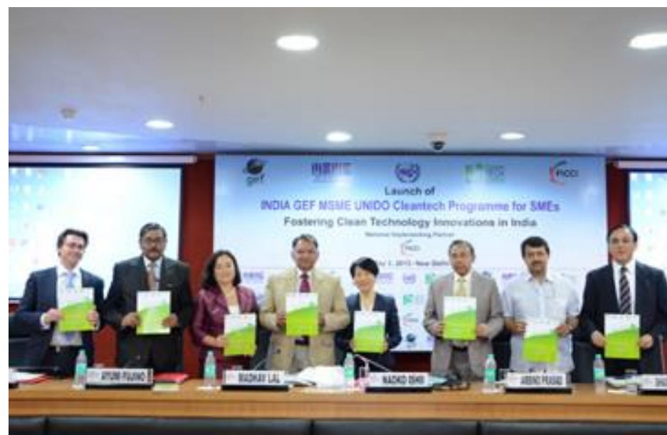
Image 19: INDIA GEF MSME UNIDO Cleantech Programme for SMEs Fostering Clean Technology Innovation in India