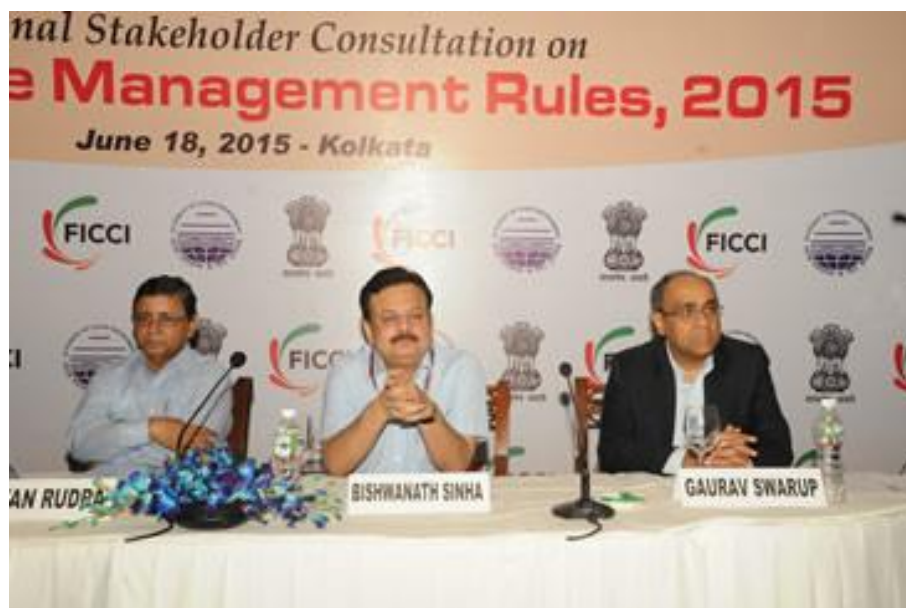
Image 9: Stakeholders Consultation on Draft Waste Management Rules, 2015