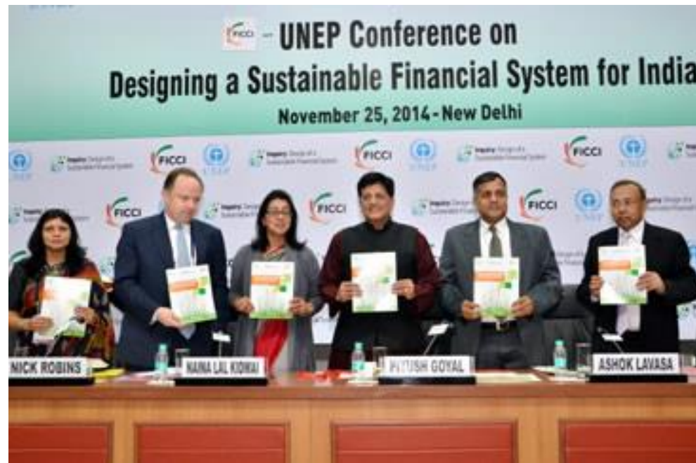
Image 7: FICCI – UNEP Conference on Designing a Sustainable Financial System