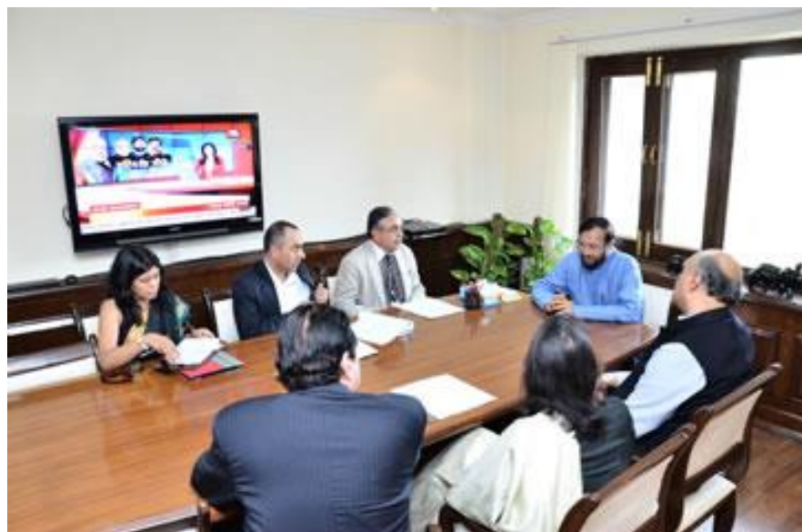
Image 17: FICCI Leadership Calls-on Shri Prakash Javadekar, Minister for Environment, Forests and Climate Change