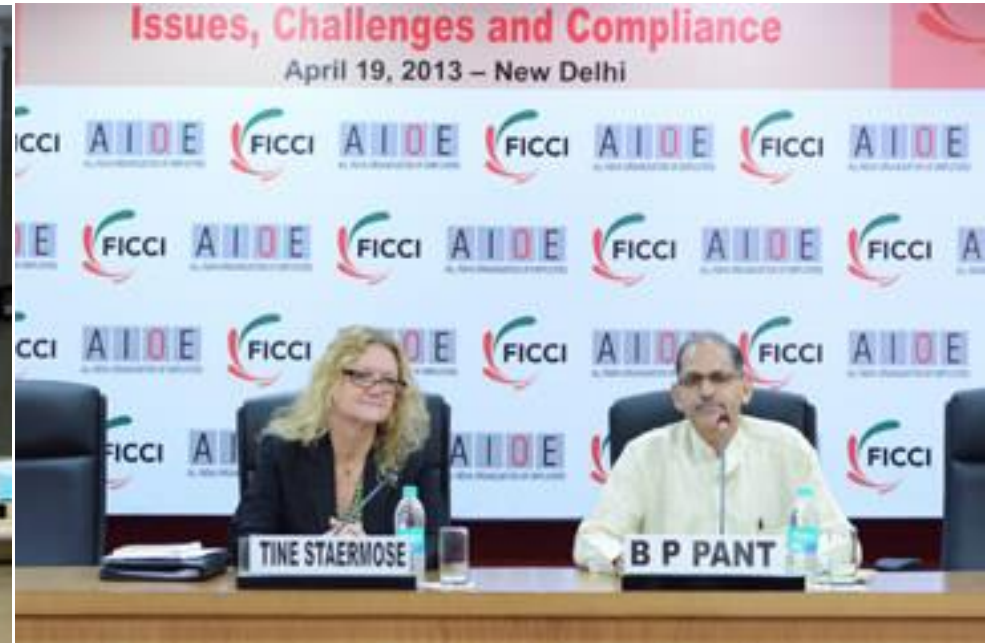
Image 2: Workshop on Sexual Harassment at Workplace Bill-2012: Issue, Challenges and Compliance