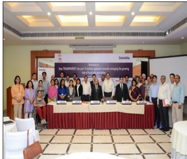
Image 20: Workshop on a Holistic Approach towards managing the growing of Fraud and Corruption