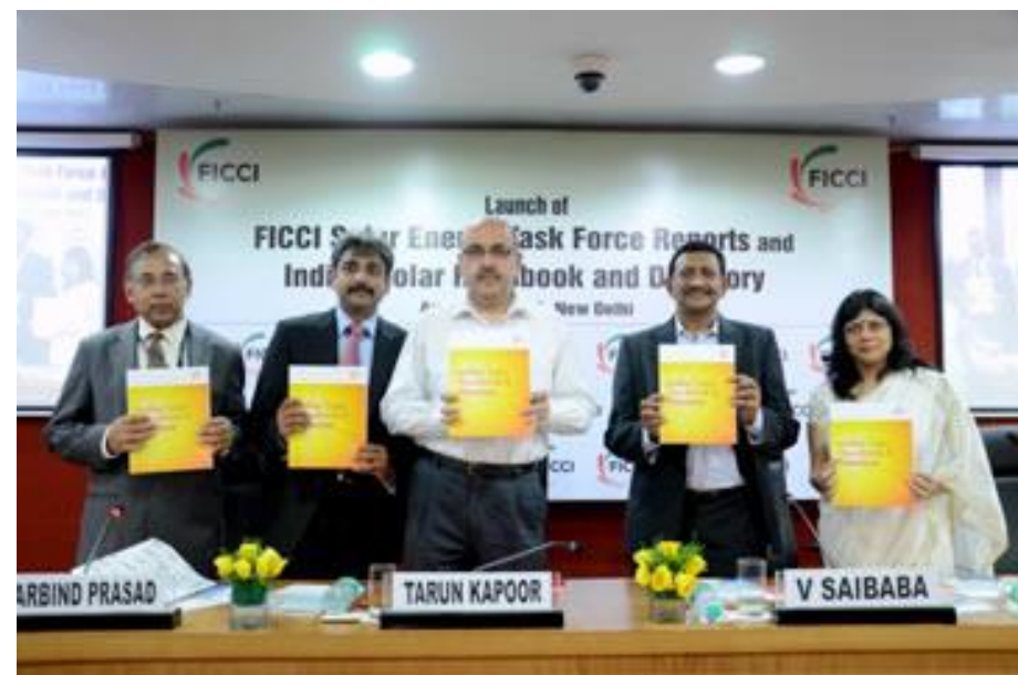
Image 14: Launch of FICCI Solar Energy Task Force Reports and Indian Solar Handbook and Directory