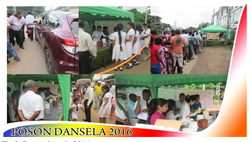
Fig 2. Poson dansela 2016

• Mabroc has taken initiative to join the Hayleys PLC in their "Puritas Sath Diyawara" project.