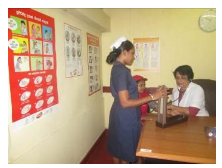
Fig 4. Weekly basis medical checkup in Mabroc Teas premises