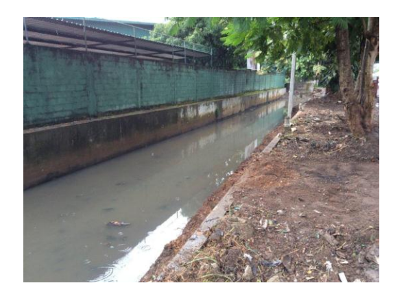
Fig 9. Shramadana campaign