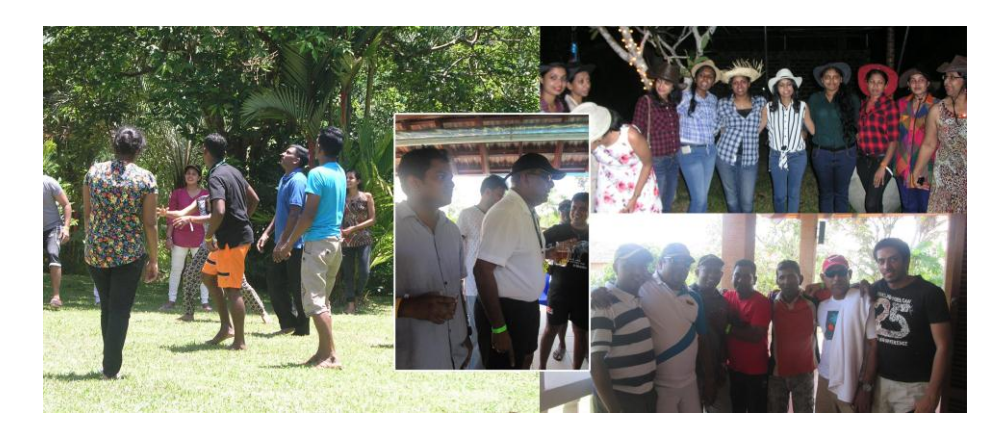
Fig 8. Annual Trip and workshop