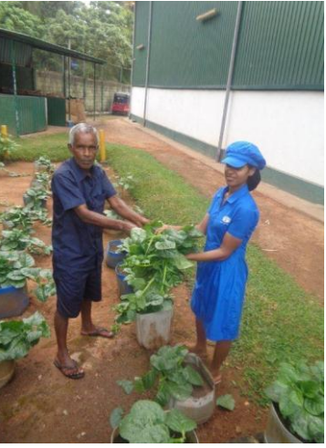
Fig 5. Employees benefited with the vegetables grown in Mabroc Premises.