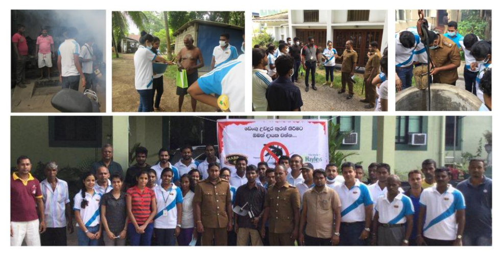
Fig1. Dengi Irradication program conducted by Mabroc Teas (Pvt) Ltd.