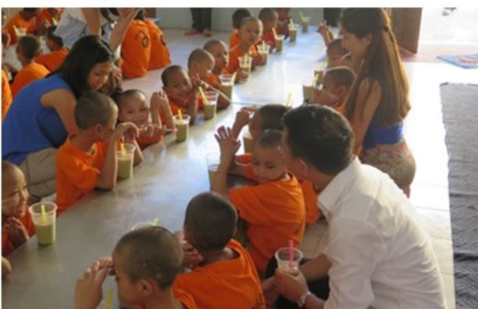
Our team members distributed the drinks and food to the children.

The MCC team had an early start that morning in order to prepare chicken burgers and fruit punch for the children who had never eaten them before. We were glad that we were able to serve the children their first burgers and fruit punch which they really liked. After a small feast, there were rounds of rounds of games which the children participated enthusiastically. The highlight of the day was Than-Pone-Yite (hitting a tin box blind-folded) which got the children most excited and incited the loudest cheers from the entire school. The winners and participants were each awarded with a bag loaded with stationery, snacks and a frisbee.