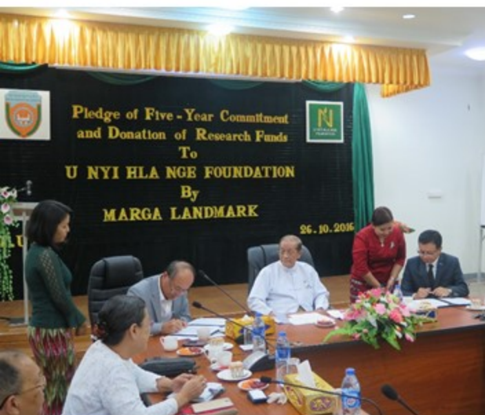
A donation and agreement signing ceremony was held at YTU to formally kick off Marga Group's long-term sponsorship for research fund for students from YTU.