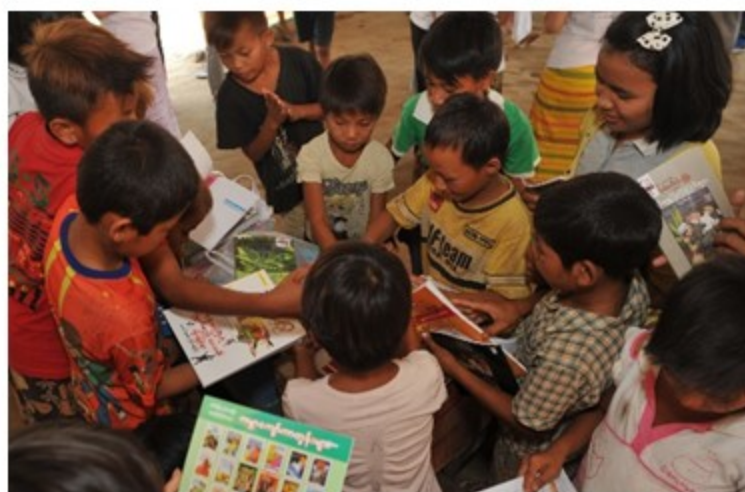
The children are overjoyed with the new books.