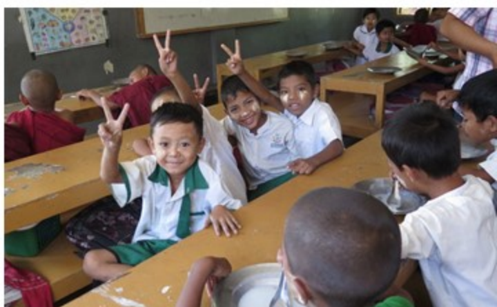
The kids posed happily after enjoying their favorite food.

We understand that a fun day wouldn't be complete without delicious food. So our team made a few pots of milk porridge for the children to enjoy before the games, and then quenched the thirst of the sweaty children after the "actions".