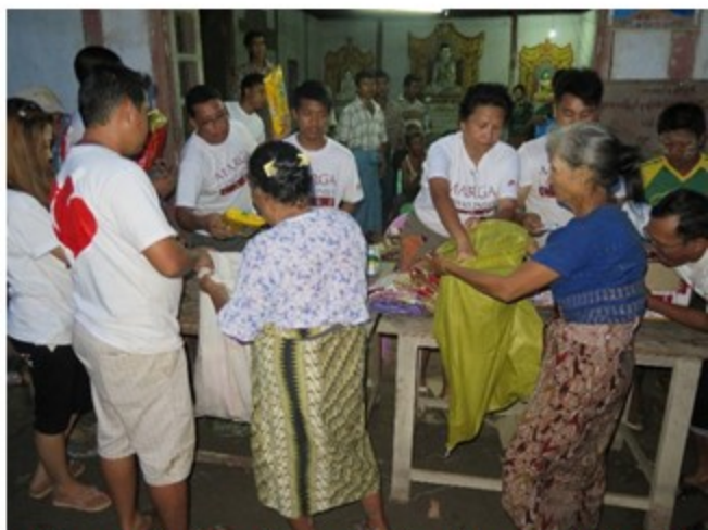
Villagers collecting relief supplies directly from our flood relief team.

The victims received help from all over the country. Many individuals and companies contributed through various formats and channels. Marga is glad that our help reached the victims.