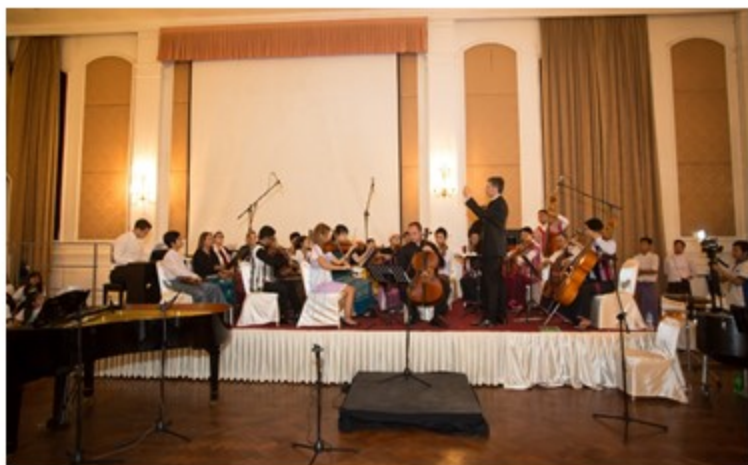
The "Orchestra for Myanmar" was joined by an international ensemble of musicians at their concert held at the Strand Hotel in March 2016.

Inspired by the founder's vision for the orchestra to become a symbol of a peaceful, united and successful future for the country, Marga Youth Foundation has pledged a 10-year commitment to support the 'Orchestra for Myanmar and the Children's Choir.'