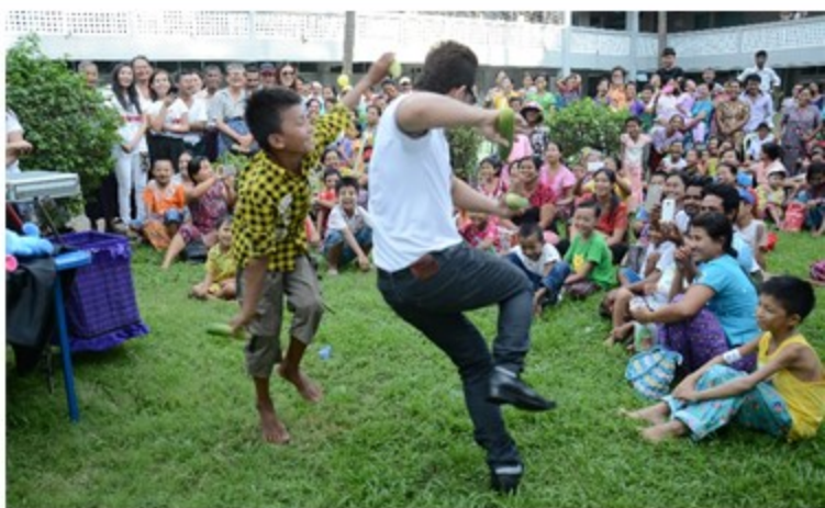
A magical dance performed together with the magician and a volunteer kid.

We started off the day's program with two Hello Kitty cartoon characters leading the participants to a warm-up dance to the famous nursery rhyme "Old MacDonald Had A Farm." The first highlight of the program was the dance competition in which 10 pairs of child-parent "dancers" competed with one another. All the teams had so much fun even though only two could win the prize. After the action, the participants were all drawn into the