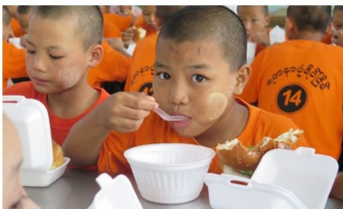
The kids enjoyed the special treats we prepared for them.

October is the month in a year that Nate Ban Zay is most frequently organized across the country. To honour this beautiful tradition, the MCC team organized "Nate Ban Zay" at Yadanar Pone Yeik Nyein Monastic School with some extra fun games on 14 th October, 2015. We were charmed by the peace and quiet of the school in spite of the number of children the school houses. Most of the children are trained to become Buddhist novices. The trainer is very strict, yet very affectionate with the children. They look very calm and disciplined for their young age.