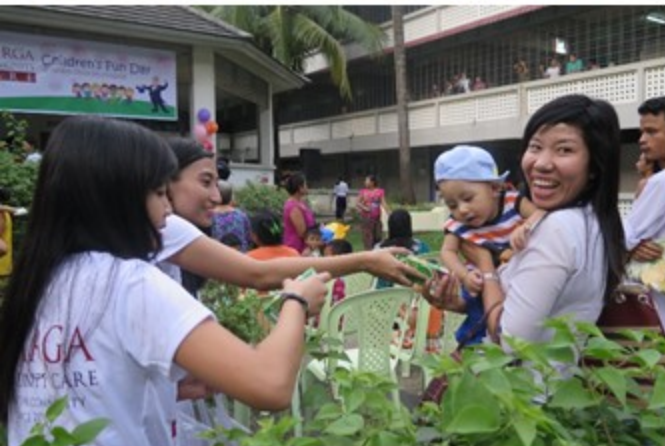
Happy faces of children and their guardians participating in our children's fun day event