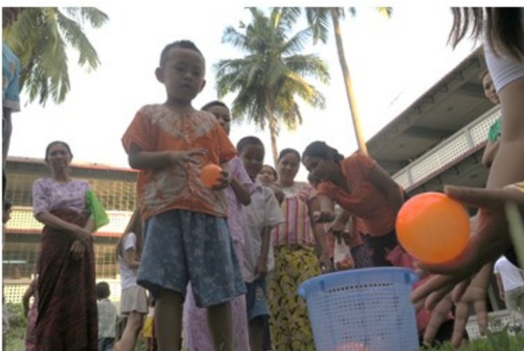
Children lining up to participate in basket-ball-throwing game

irresistible world of magic with the exciting and captivating tricks by the famed magician Ko Lynn Nay. Other than all the participants in the central garden, young patients and even nursing staff at the other floors of the four-storey main building came out and enjoyed an aerial view of the show.