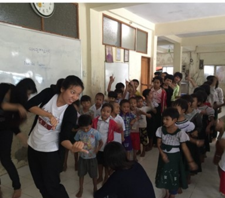
The team teaching the children to dance.