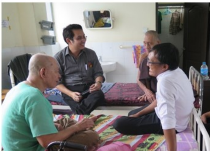
The grandpas sharing their life stories with our team members.