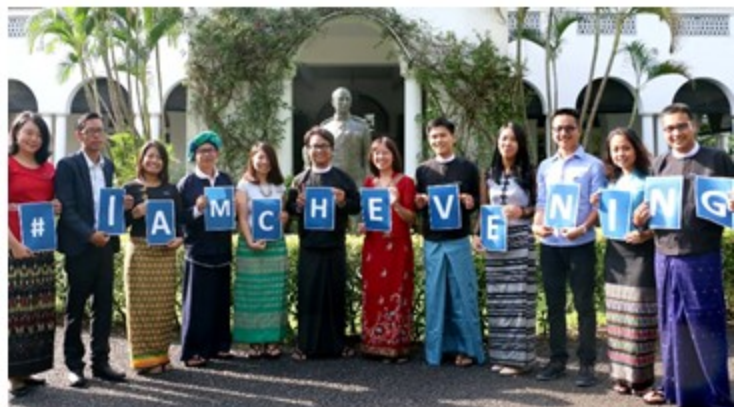
12 scholars were awarded Chevening Scholarship this year.

We congratulate the 12 Chevening scholars who are awarded this year's scholarships and will continue to seek concrete ways to encourage Myanmar's young people to set high goals and persevere in their aspirations for their personal growth and for a better future of Myanmar.