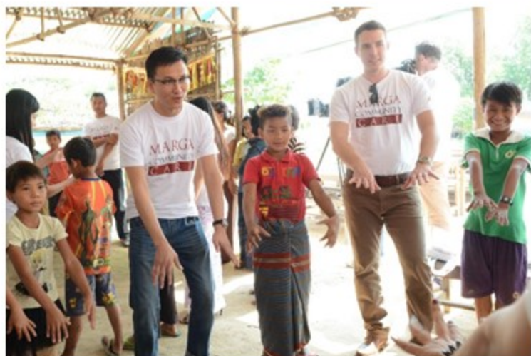
Together, we can put rays of hope on the faces of these children in spite of their poor conditions.