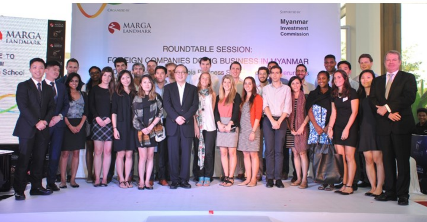
Columbia Business School delegates with the senior team of Marga Group.

Delegates from more than 12 local enterprises and foreign companies operating in Myanmar, representatives from Yangon University and British Council attended the roundtable.