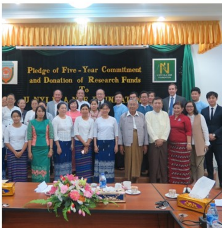
The donation and agreement signing ceremony was attended by Representatives from the foundation, YTU & Marga Group.