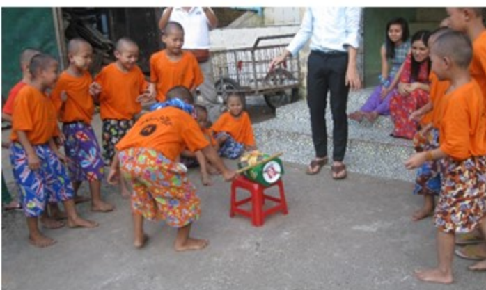
The team-mates of the winning team watched anxiously as the hit the tin at the final round.