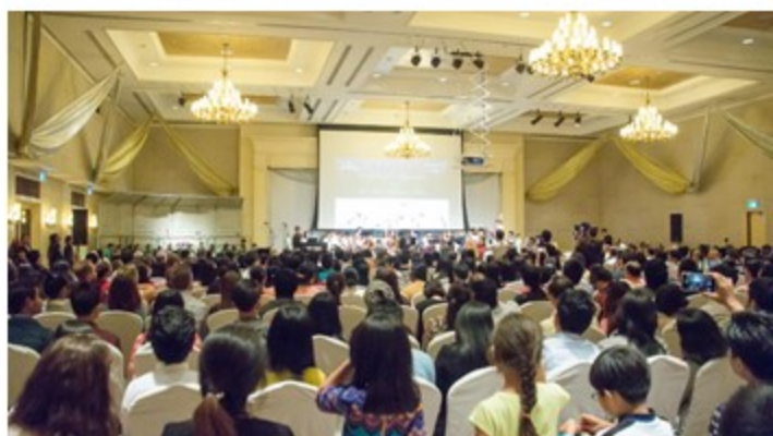
The concert was full with the audiences from international and local community.

Together with Orchestra for Myanmar, Marga Group aims to build a professionally skilled orchestra and children's choir, but most importantly we will build capacity, self-confidence, and nurture inclusiveness and harmony.