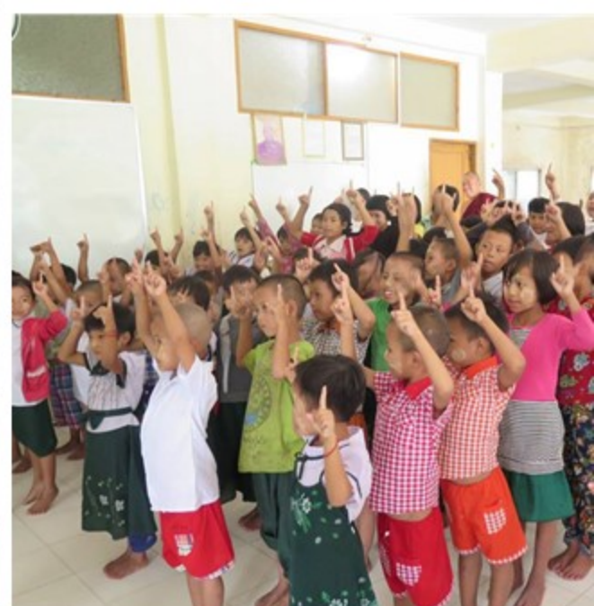
The group who had the best dance moves got the grand prize.