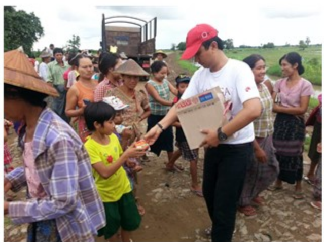
MCC team member passed the relief supplies to flood victims at Pay-Gone Village, Kantbalu Township.

More than 3800 units of medicine for diarrhea, cold & flu, water purification tablets and rehydration salts (dat-sarhtoke), 2700 units of nutritional drinks, noodles, and more than 230 pieces of clothes were directly handed over to the victims.