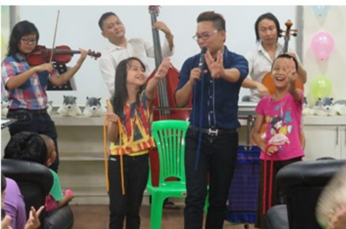
Children enjoyed co-performing with the magician.

An atmosphere of joy and peacefulness filled the packed conference room as the 10-person string ensemble from Orchestra for Myanmar played happy tunes for the audience. When the MCC team sang the familiar "Moe" song to the melody played by the orchestra, the parents and the older children sang along and clapped.