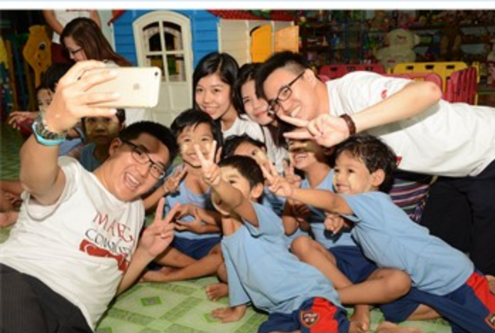
Our senior team with the children at the nursery.

"As a father, I fully understand that children need their parents to guide and support them in their different stages of life. I hope that our presence can assure them that many people care for them and that they are not alone. Our MCC activities are a long-term program so that we will keep supporting these orphans in the hope of helping them become good and responsible citizens of society."