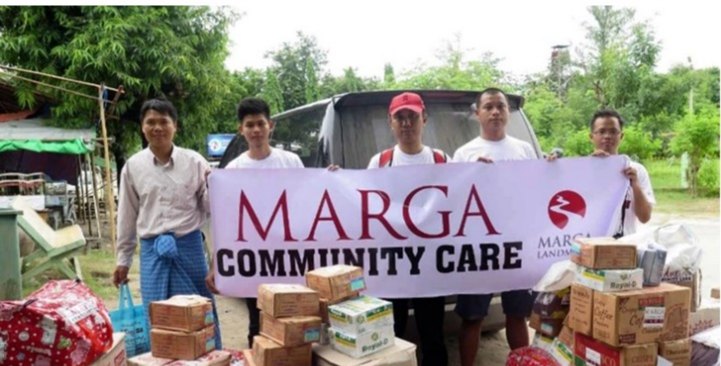
Our first flood relief team delivered relief supplies to the Kantbalu Flooding Rescue Committee Office.

Marga Community Care (MCC) team responded quickly to the victims' call for help and mobilized two teams comprising 15 staff members in total to deliver emergency aid to victims at Sagaing Division and Magway Divisions, two of the worst hit areas.