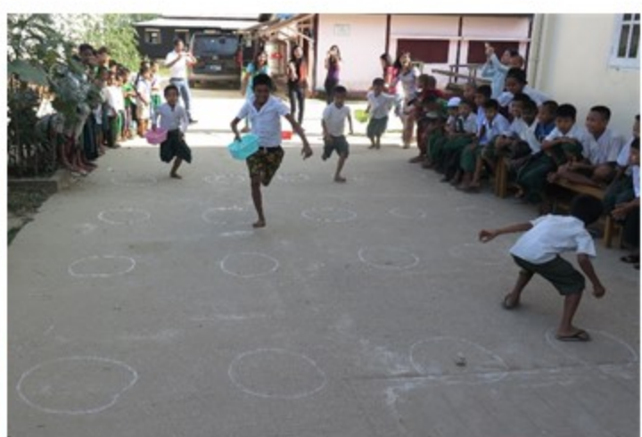
Look who is the fastest collector of potatoes!