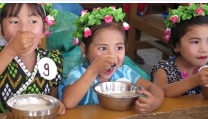
The kids really enjoyed the milk porridge our team prepared for them.