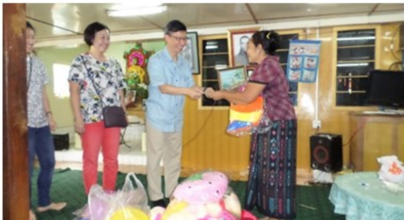
A representative from Marga Senior Management giving the cash and gift donation to the guardian.

The MCC team visits different orphanages and child care centers on a regular basis because we firmly believe that every child deserves care and affection regardless of their backgrounds.