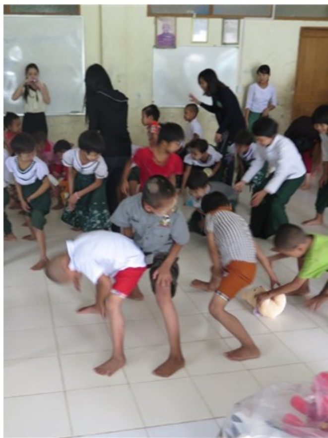
The team teaching kids how to play harmoniously as a team.

Their happy, genuine smiles are the best reward for us, motivating us to do more good.