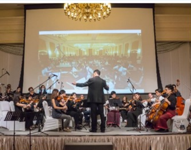
The "Orchestra for Myanmar" performing at their year-end public concert at the ballroom of Sule Shangri-La Hotel on 17 November 2016.