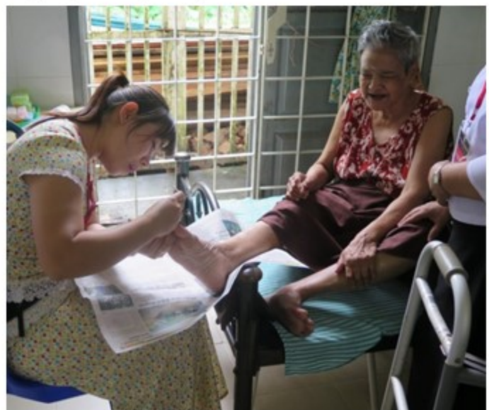
A grandma enjoying the service from our team member.