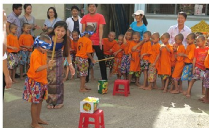
The team excitedly cheered a kid as he was preparing to hit the tin blind-folded.