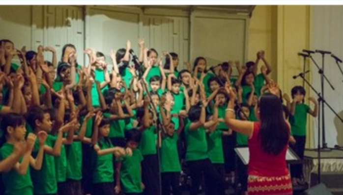
The Children's Choir performing the song "Pyit-Tine-Daung" together with the Orchestra for Myanmar

On 17 th November 2016, the year-end public concert by Orchestra for Myanmar and the new Children's Choir was held at the ballroom of Sule Shangri-La Hotel. The concert was a truly international fest of music with the Orchestra of Myanmar, plus the Strand singers and international guest musicians from Malaysia, Taiwan, United Kingdom and United States. The New Children's Choir delivered another inspirational performance