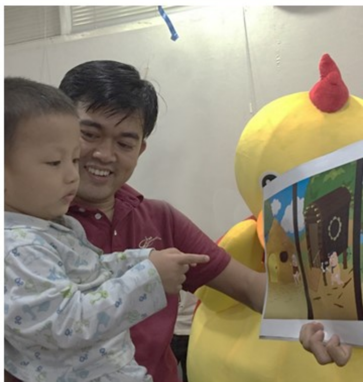
A little boy listened to a MCC member telling the story of "The Three Little Pigs"

We were delighted to give the children their first experience of "magic". Everyone at the conference hall was mesmerized by the charm and skills of the magician whose tricks surely give the children and their parents a magical moment of laughter and awe. Besides magic, our MCC team brought the story of the "3 little pigs" in colorful storyboards. We hope this story with the message of unity, discipline and friendship can instill energy and spirit into the children who are hospitalized due to different medical conditions.