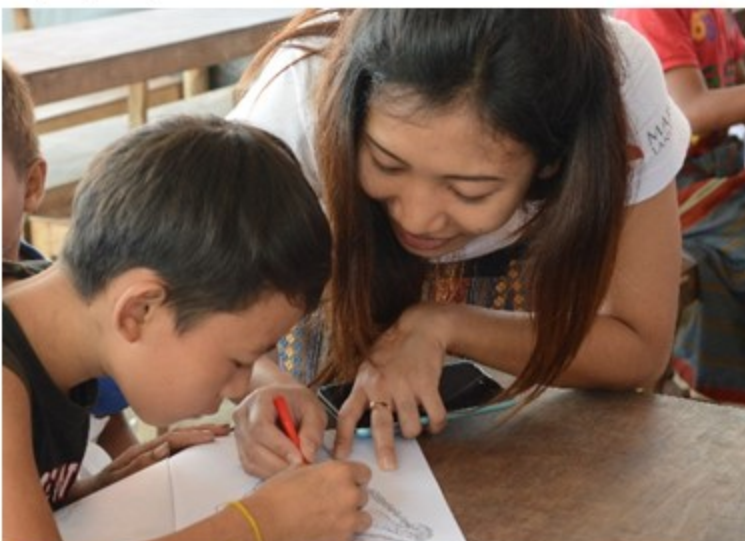
One of our MCC team helping kids with the coloring.