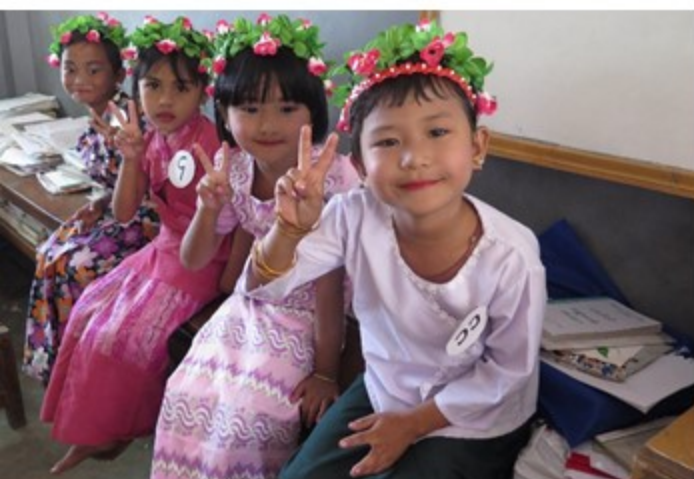
Super cute kids waited excitedly to show off their talents at the "beauty pageant"

Children's laughter filled the outdoor playground when we staged the fun games with two traditional games Arr-Lu-Kout (collecting potatoes) for boys and Za-Gaw-Ywat (walking with the plates on the head) for girls. The children were so loud that even other families in the neighborhood came into the school to enjoy the fun. We also staged a mini "beauty pageant" for the youngest boys and girls of the school. The teachers' office was used as the dressing room where the team helped the "contestants" with the make-up. The winners of the pageant were rewarded with stuffed toys and special treats.