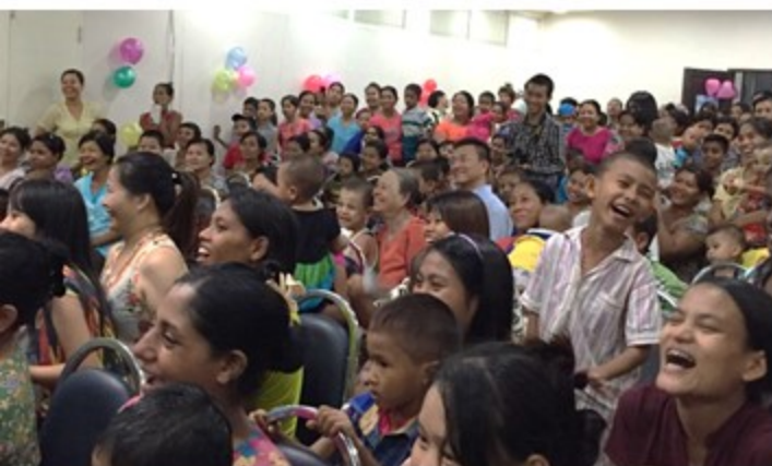
The children and their parents had a fun time together.

The day's program ended with more warm smiles when the children received the soft toys we specially brought for them, and took pictures with the chicken characters. We also got toys for the children who were not able to join us due to their special conditions. "My daughter told me that it is her happiest day in the hospital ever," a smiling mother told us. These words of encouragement really warm our hearts.