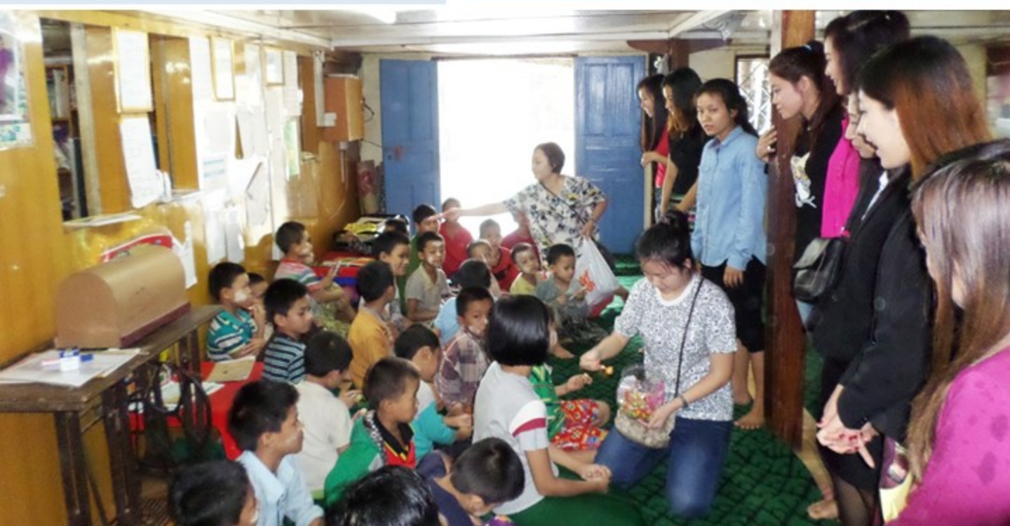
The team distributing the small gifts to the children.