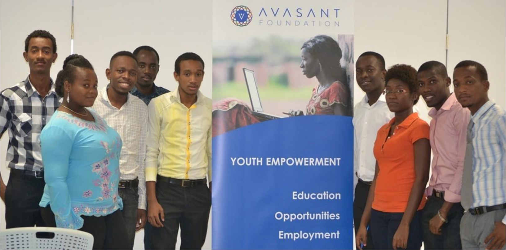
Avasant Digital Youth Employment Graduates, Haiti