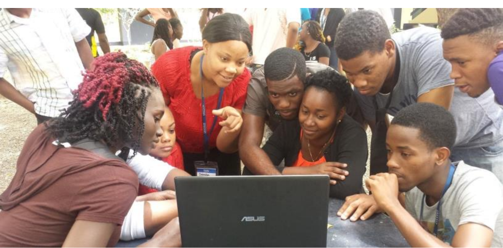
Digital Youth Employment Training in Kingston, Jamaica