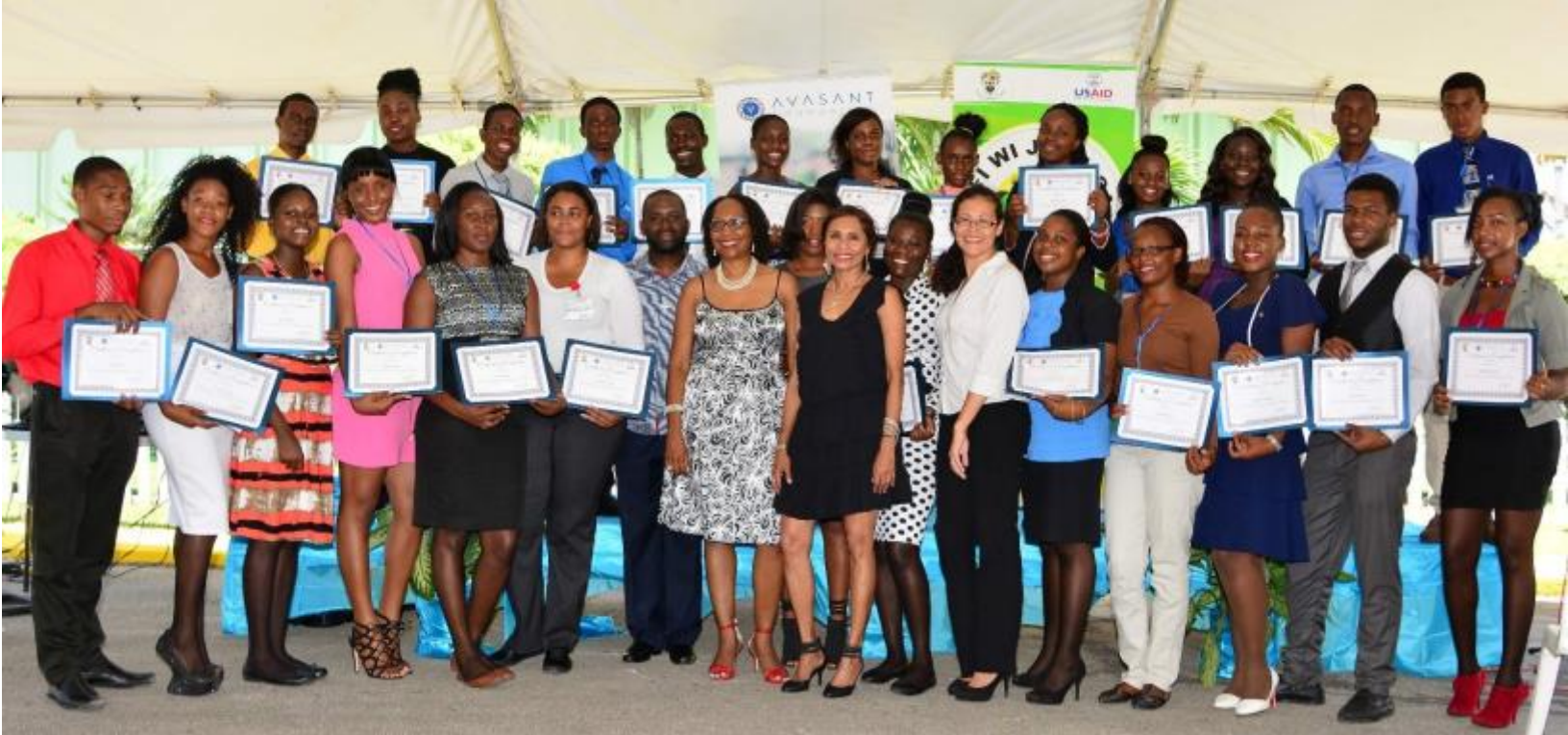
Avasant Digital Youth Employment Graduates, Montego Bay, Jamaica