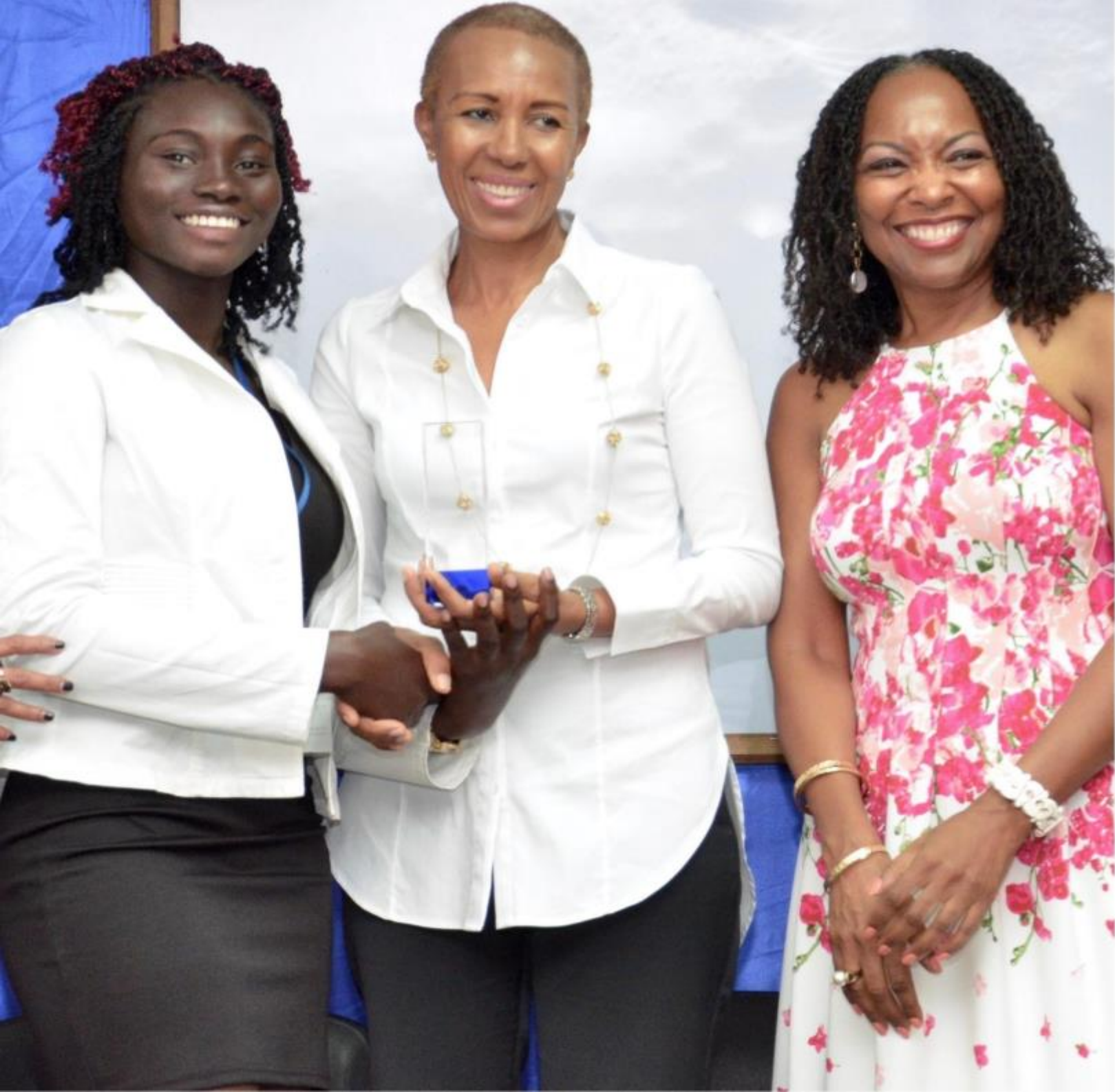
AF Graduate with Jamaican Minister of State for Finance & Social Service and Director for Community Service at University of Technology, Jamaica