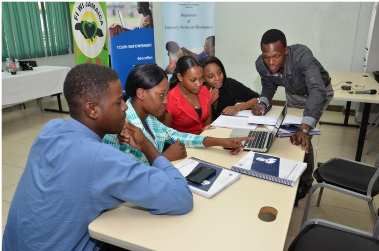
AF Digital Youth Employment Trainees in Jamaica, Summer 2016