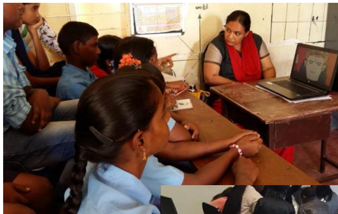
(Below) Trainee of Harambee, Avasant's partner in South Africa on Digital Jobs Africa.