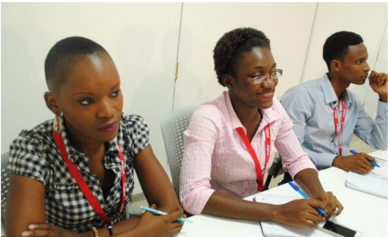
AF Digital Youth Employment Trainees, Port-au-Prince, Haiti

The Avasant Foundation, in association with Microsoft, offers a customized version of Microsoft's YouthSpark web portal, which is a global initiative to increase access for all disadvantaged youth in the Caribbean to learn computer science, empowering them to achieve more for themselves, their families and their communities. The custom-made state-of-the-art hub offers more than 1200 free, online, self-paced courses with certifications in fields such as Coding and App Development, Entrepreneurial Skills, Business Development, Soft Skills, Sales and Marketing, College Algebra and Mathematics, working with Windows to enable them to learn relevant skills needed to get a job.