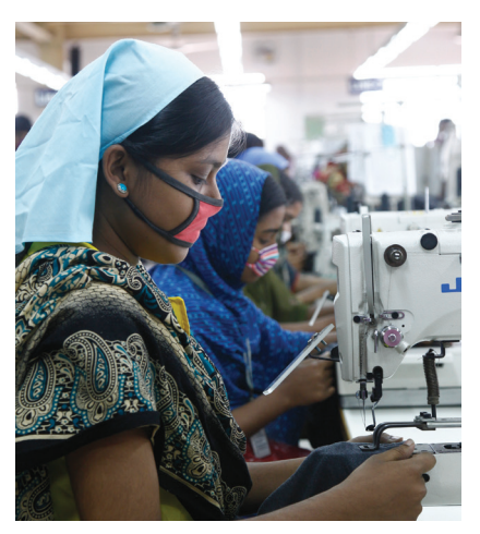
Kmart and Target have joined ACT, a partnership to improve wages in factories.

Bunnings is confident that more than 99 per cent of timber products are confirmed as originating from low risk sources including plantation, verified legal, or certified responsibly sourced forests. Within that, more than 90 per cent of its total timber products are sourced from independently certified forests or sourced with demonstrated progress towards achieving independent certification, such as that provided by the Forest Stewardship Council and the Programme for the Endorsement of Forest Certification (PEFC).