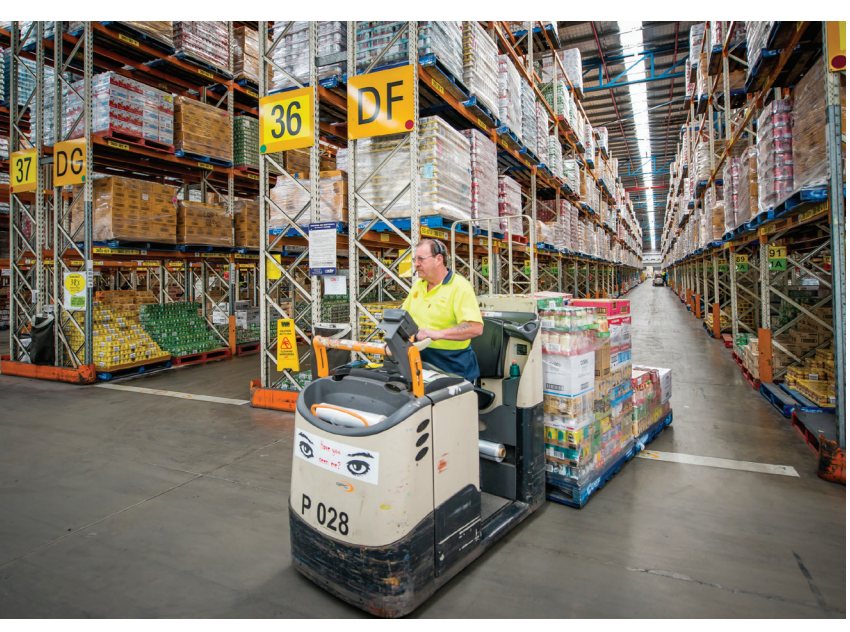
'Have you seen me' campaign in Coles distribution centres.

Bunnings engaged its team in driving a simplified safety strategy. This is reflected in a 6.9 per cent reduction in the number of injuries recorded and an 11.1 per cent reduction in the total recordable injury frequency rate. Key initiatives at Bunnings include its 'See Something... Do Something' campaign, which encourages team members to act in the moment, address any safety risks and acknowledge great safety practices.