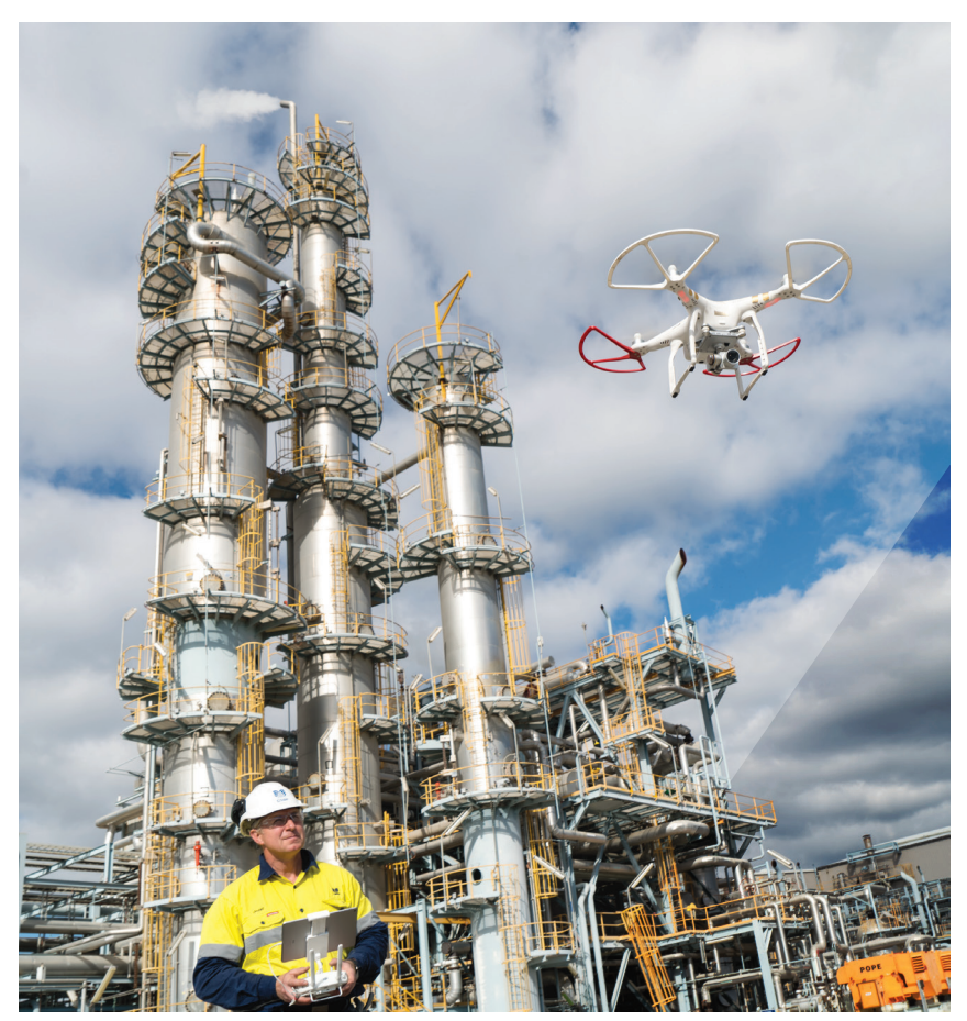
Innovative technologies are helping to drive business efficiency, limit risk and improve safety at our CSBP operations in Kwinana. Western Australia.

Wesfarmers is committed to minimising our footprint and to delivering solutions that help our customers and the community do the same. We endeavour to improve continuously our performance and publicly report on our progress in our annual sustainability report. The Dow Jones Sustainability Index tracks sustainability performance of leading companies around the world. In September 2016, Wesfarmers was advised it had recorded a significant increase in its ranking.