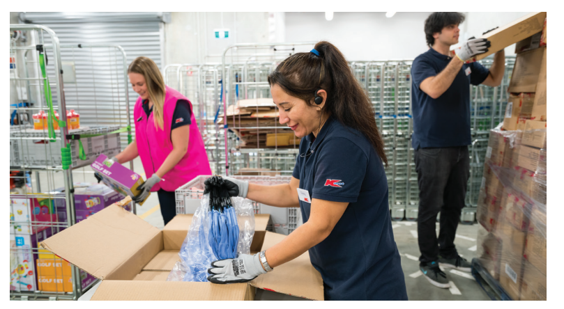
We ensure that all our products comply with relevant mandatory standards before they are offered for sale.