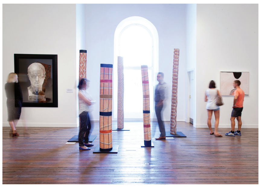
LUMINOUS WORLD: contemporary art from the Wesfarmers Collection on display at the National Art School, Sydney February 2016.