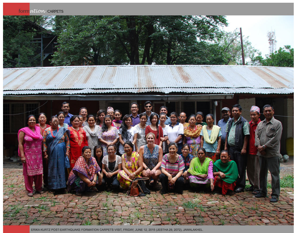
Formation Carpets Family

In addition to providing free education to the children of the employees, Formation Carpets has for over two years started generating employment opportunities for the very children that it educated. As more and more children of veteran employees graduate from school and reach a legal age for working, Formation Carpets hires them into the company for work that their weaver mothers could only dream of doing -- operating a computer. Formation Carpets is digitizing its two-decade old carpet manufacturing process, which includes daily digital pictures of all carpets on every loom. An online information management system lets employees communicate directly with the customers of Formation Carpets. In the past, only two people handled client correspondence via email. Now, a workforce of 10 is in constant communication with customers on the other side of the world. This gives the children of the weavers a breathtaking insight on how the business works past the loom, that their mothers have been working on for years. Formation Carpets hopes to incubate the 2nd generation employees in international business with a goal to turn them into successful social entrepreneurs in the future.