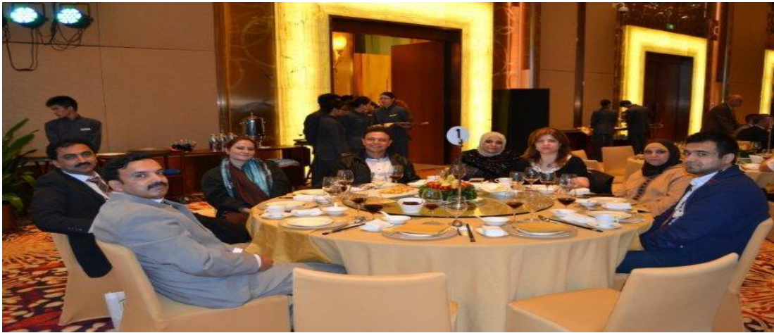
WFS+10 held in Zhuhai, China on 2-4 December, 2014