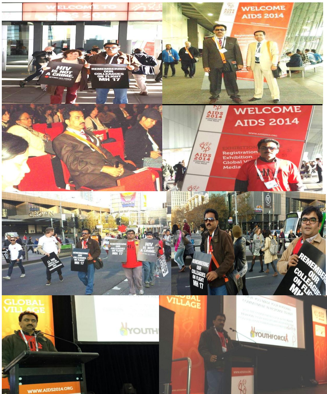
International AIDS Conference 2014 Melbourne, Australia