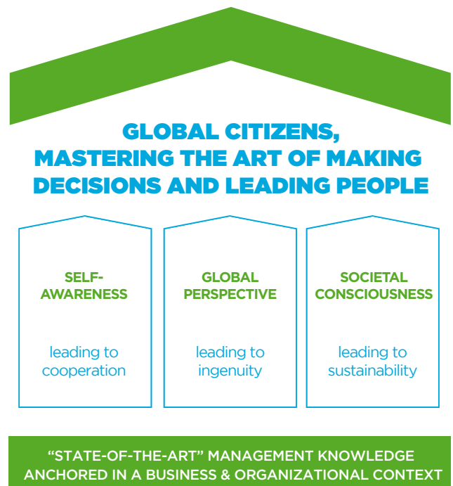
Figure 1: Mission House of Antwerp Management School