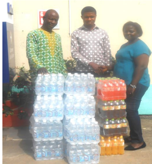
Supported the Pacelli School for the Blind Christmas Celebration