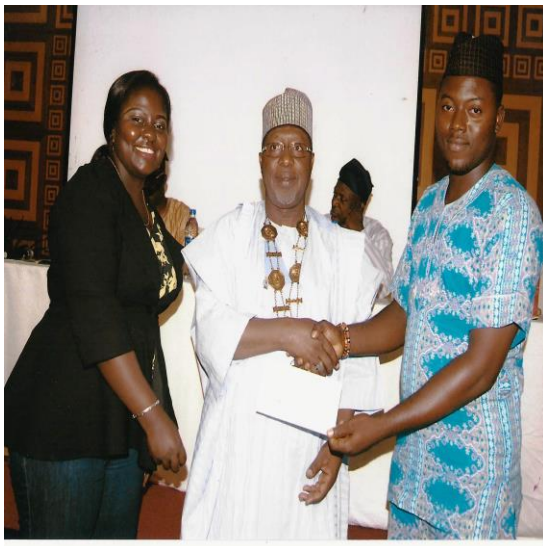
Donated N100,000.00 towards the Nigerian Institute of Quantity Surveyors 2015 Merit Awards