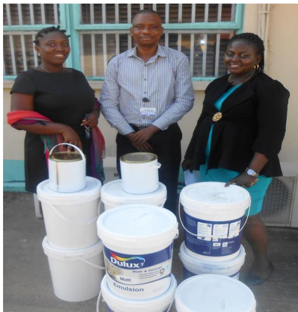
Donated Paints to Centre for Citizens with Disabilities