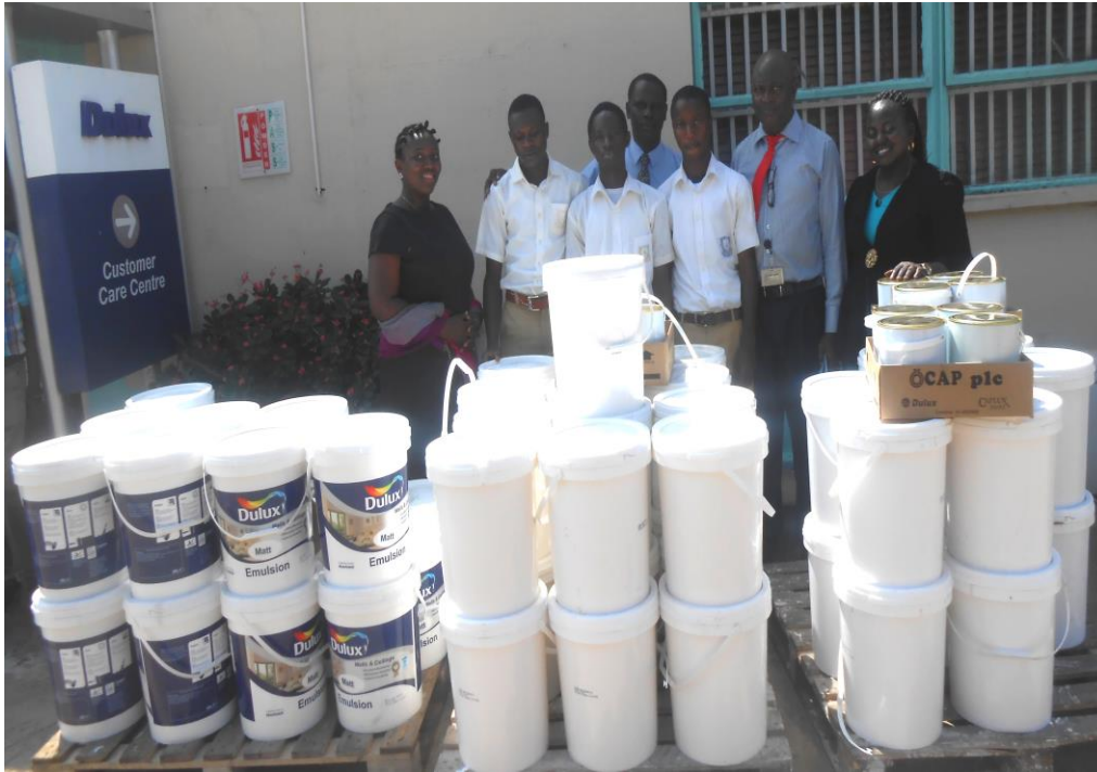
Donated paints to YEWA Junior High School, Agege