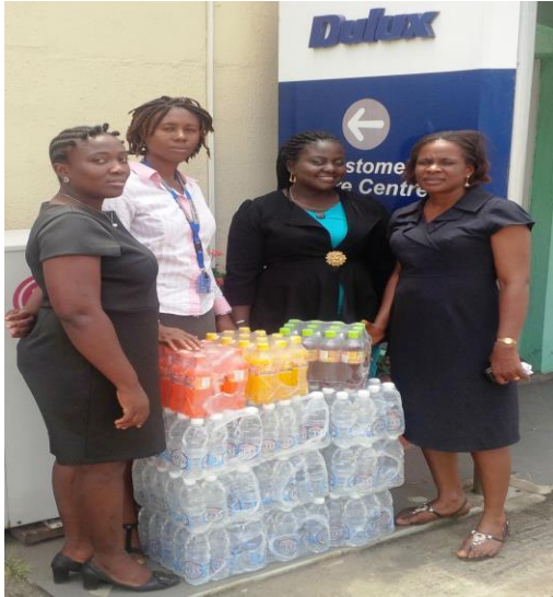
Supported the Police Children School Graduating and Prize Giving Day