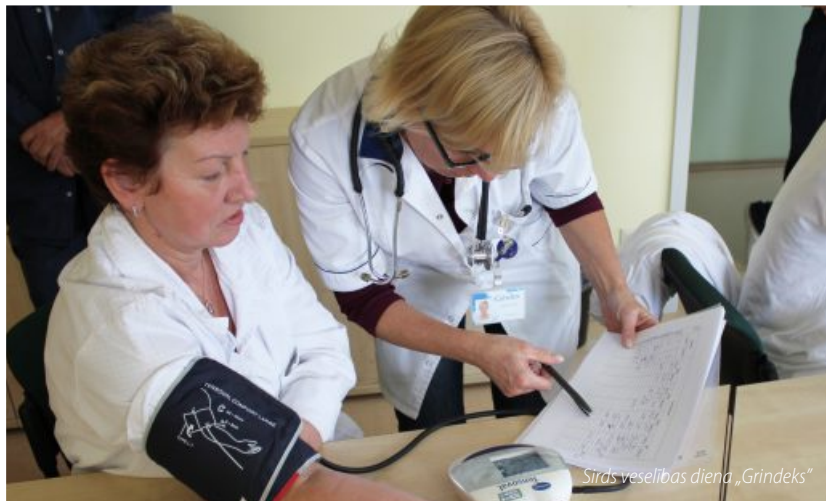
Sirds veselības diena „Grindeks”