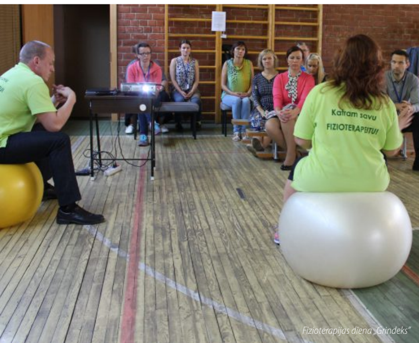
Fizioterapijas diena „Grindeks”