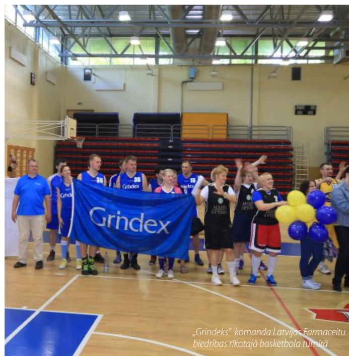
„Grindeks” komanda Latvijas Farmaceitu biedrības rīkotajā basketbola turnīrā