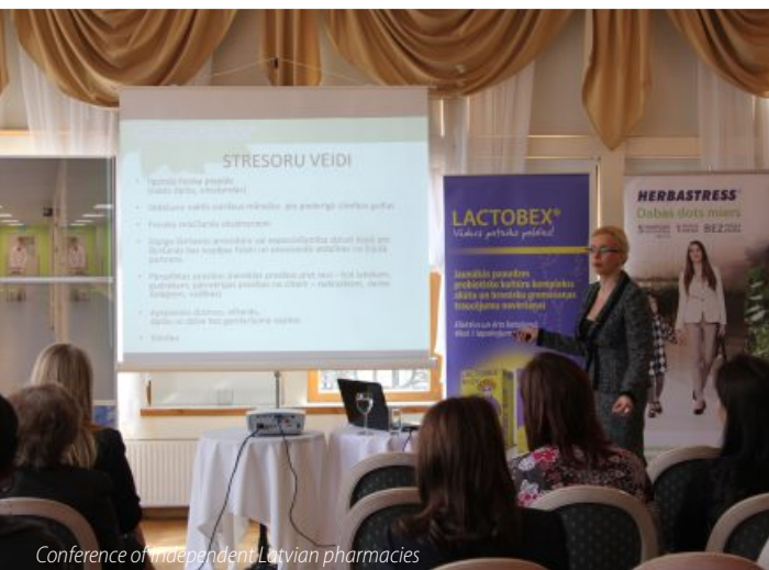
Conference of independent Latvian pharmacies