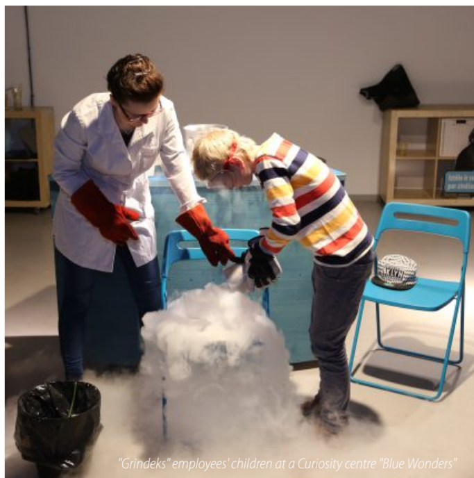
“Grindeks” employees’ children at a Curiosity centre “Blue Wonders”