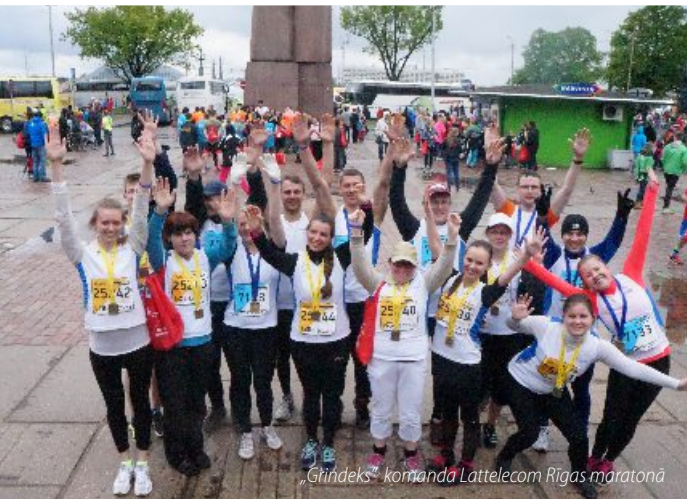
Grindeks' komanda Lattelecom Rīgas maratonā