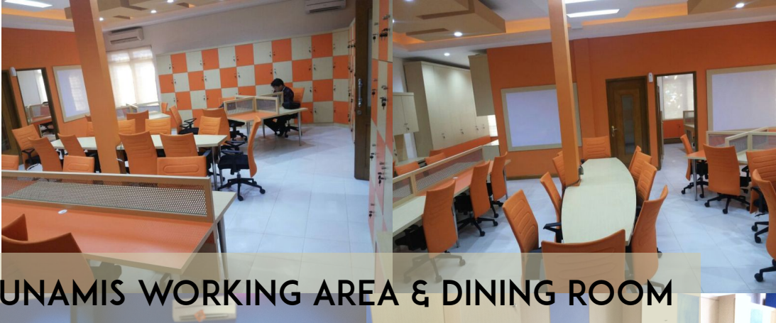
DUNAMIS WORKING AREA & DINING ROOM