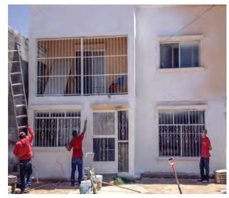
Improvements at the Guardian Angel Children's Home