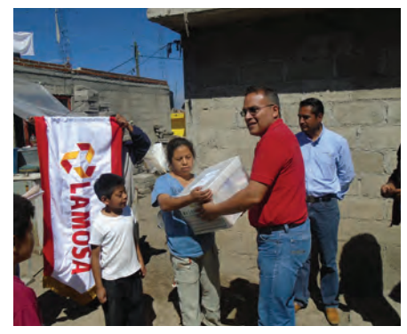
Support for families in San Luis Teolocholco, Tlaxcala