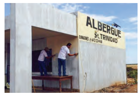
Maintenance work at the Holy Trinity Home