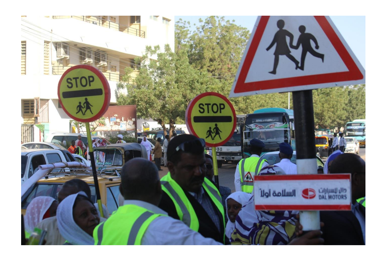
Figure 1: School Safety Project kickoff