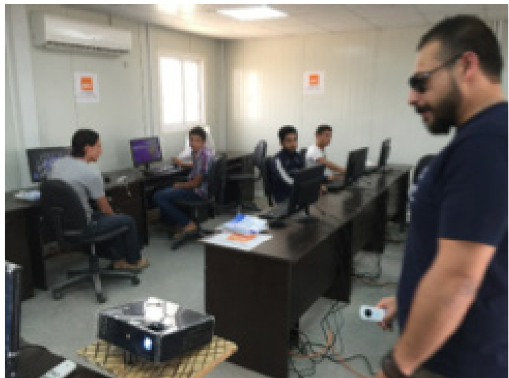
ASRAQ refugee camp in Jordan