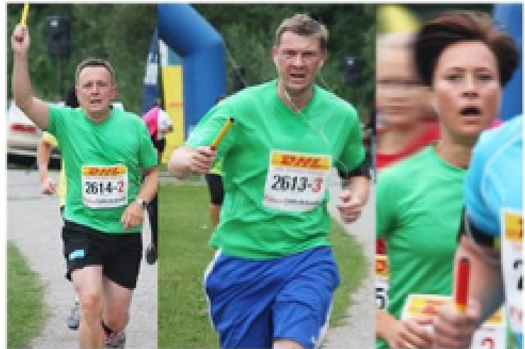
Danoffice IT "RUN for a purpose"

In 2015 we managed to bring together a significant donation to NRC Youth program in ASRAQ Syrian refugee camp. Danoffice IT assisted with the IT hardware and software and our objective was to equip the Syrian refugee youth with the technical skills that enlighten their vision toward a positive future. The progression and good reputation achieved by NRC since 2013 led to a high participation of many youths with different potentials and needs, and from there the program adopted a flexible strategy to fit what can be matching the aspirations and needs of the youth. NRC started by providing the International Computer Driving License (ICDL) to both female and male youth with the support of experienced trainers employed from the camp community itself.