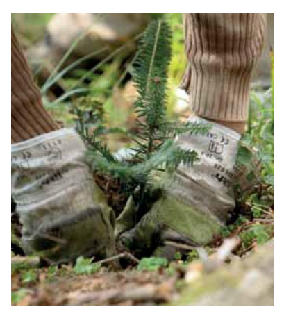
Plantation of white fir trees by Bergwaldprojekt e.V.

Optima compensates all its Greenhouse Gas emissions by funding certified projects around the world. However, as a locally rooted company, Optima would like to contribute to an intact and valuable environment in our Bavarian home region. Therefore, Optima