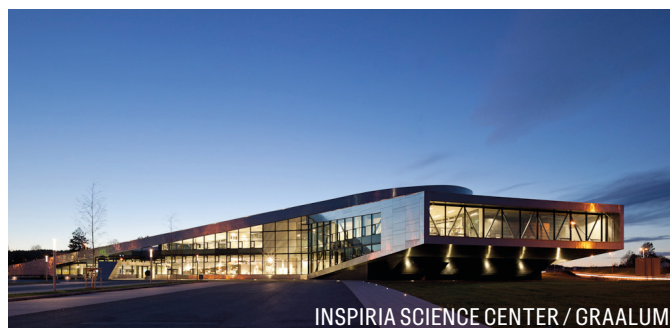
INSPIRIA SCIENCE CENTER / GRAALUM