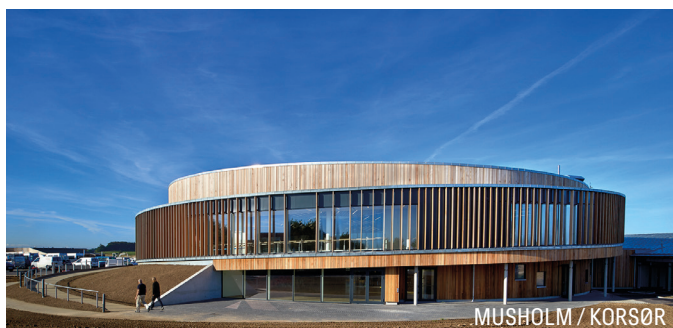
MUSHOLM / KORSØR