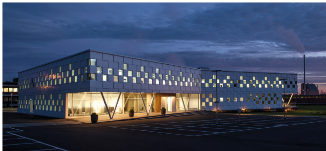
In 2015, we completed the new headquarters for Borregaard, which is one the world's most sustainable biorefineries.

We believe that buildings and public spaces should have a positive impact on the environment. Especially, because the environment is the field where we as architects can make the greatest difference, since the energy consumption of buildings taking into account the whole life cycle is responsible for 40% of total EU energy consumption. Therefore, we support the United Nations universal principles concerning the environment.