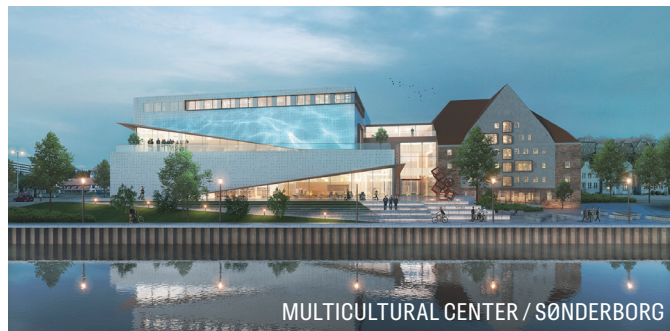
MULTICULTURAL CENTER / SØNDERBORG