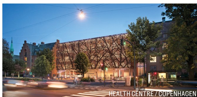
HEALTH CENTRE / COPENHAGEN