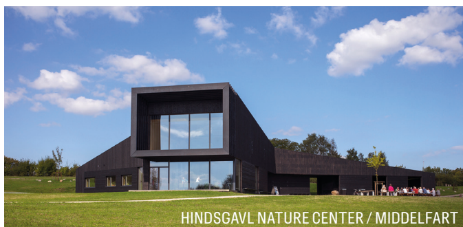
HINDSGAVL NATURE CENTER / MIDDELFART