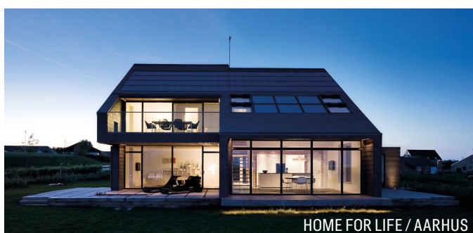
HOME FOR LIFE / AARHUS