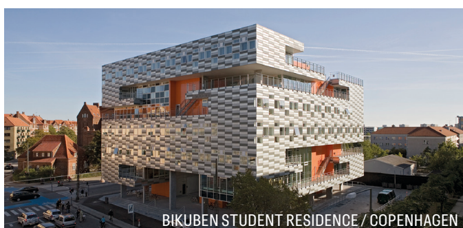
BKUBEN STUDENT RESIDENCE / COPENHAGEN