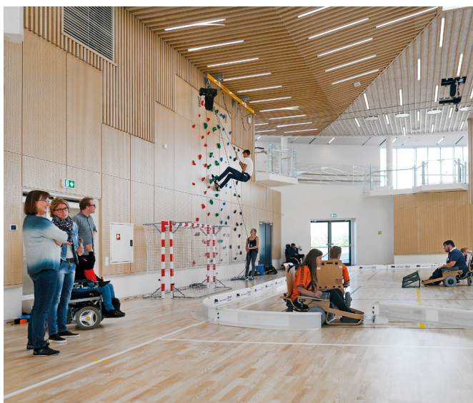
In 2015, we completed the new and extended Musholm, which sets new standards for accessible architecture.

We believe that buildings and public spaces should empower people to live safer, healthier and more meaningful lives. Therefore, we support the United Nations universal principles concerning human and labour rights.