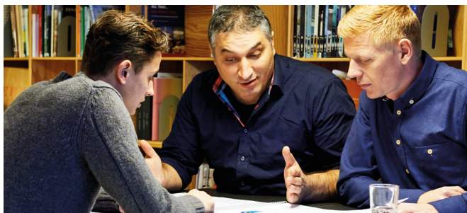
We create architecture that shows how businesses can be financially successful while creating social impact.

We believe that investments and enterprises should be powerful forces for good. Therefore, we support the United Nations Convention Against Corruption and its universal principle concerning anti-corruption, just like an open and respectful relationship to our clients, collaborators, employees and the wider community is at the heart of everything we do.