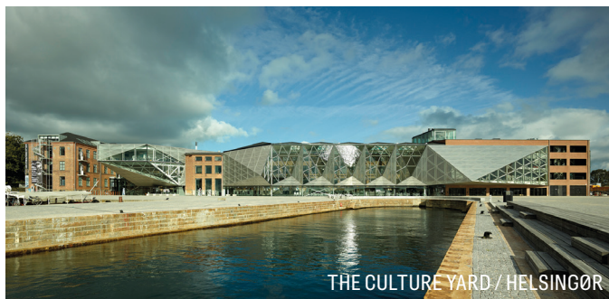
THE CULTURE YARD / HELSINGØR