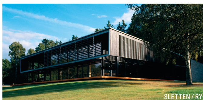
SLETTEN / RY