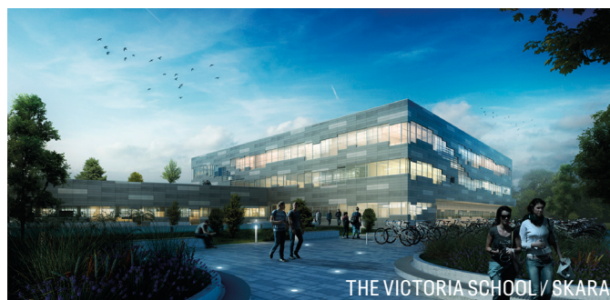
THE VICTORIA SCHOOL / SKARA