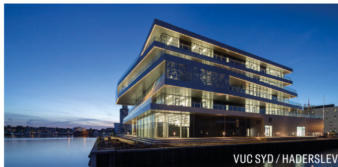
VUC SYD / HADERSLEV