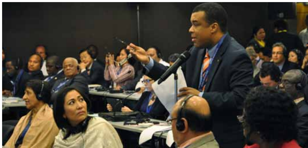
GOPAC members at Participation of Society session during fifth Global Conference of Parliamentarians Against Corruption. Manila, Philippines. 1 February 2013.

The GTF-PoS engages and motivates GOPAC regional and national chapters and parliamentarians through the sharing of experiences and best practices, and by promoting practical tools and techniques for public engagement on anticorruption issues. It helps different parliamentary systems develop suitable legislation to promote transparency, access to information, and protection of civil rights for those who take a stand against corruption.