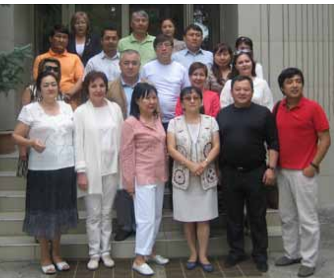
Members of GOPAC Kyrgyzstan following anti-corruption workshop. Issyk-Kul, Kyrgyzstan. 19 August 2013.