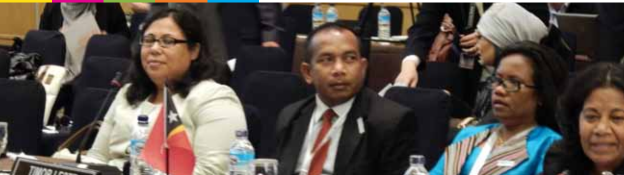
Delegation of GOPAC Timor-Leste members at SEAPAC General Assembly. Medan, Indonesia. 23 October 2013.