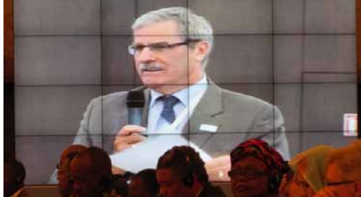
The Hon Roy Cullen speaks at Parliamentary Network on the World Bank and the International Monetary Fund Conference. Baku, Azerbaijan. 24 May 2014.

To help parliamentarians fight money laundering, the GTF-AML developed the GOPAC Anti-Money Laundering Action Guide for Parliamentarians. This book provides parliamentarians with information and tools to become actively engaged in their legislatures in the fight against money laundering.