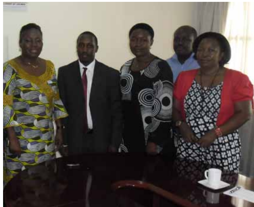
Speaker of the Ugandan Parliament with APNAC-Uganda Executive and APNAC Secretariat. 1 March 2013.

If adopted, the legislation would increase the criminal penalties for corruption and introduce a provision for confiscation of ill-gotten assets.