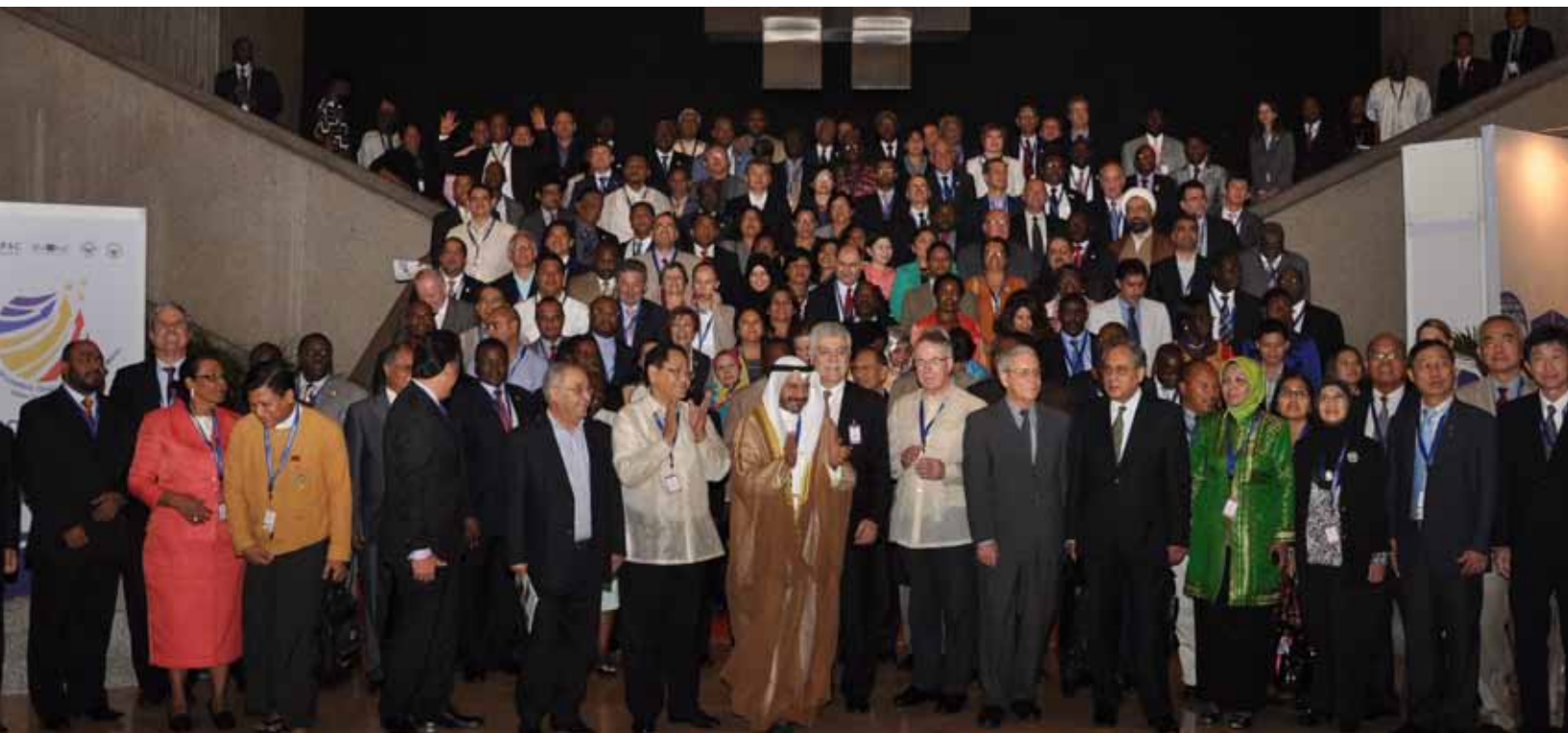
Members of GOPAC gather at close of the fifth Global Conference of Parliamentarians Against Corruption. Manila, Philippines. 2 February 2014.

In addition, we also have the national chapters in areas where we have yet to establish regional chapters: Albania, Azerbaijan, Bangladesh, Canada, Kyrgyzstan, Mongolia, Montenegro, Nepal, Serbia, Sri Lanka, Ukraine, the United Kingdom, and Italy. GOPAC is also currently in the process of developing regional chapters in South Asia and the non-Spanish speaking Caribbean.