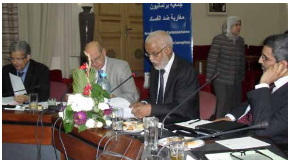
ARPAC Morocco workshop.

Since 2012, ARPAC Morocco has been working to ensure the country's domestic legislation meets the requirements of the United Nations Convention Against Corruption (UNCAC). Using an assessment tool for parliamentarians developed jointly by GOPAC and the United Nations Development Programme, ARPAC Morocco members carried out a review of existing legislation.