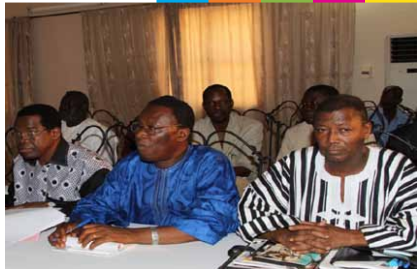
Members of APNAC-Burkina Faso at anti-corruption workshop. 2012.

Because of these efforts, Burkina Faso was accepted as EITI compliant in early 2013. This initiative sends a message to extractive companies that parliamentarians in Burkina Faso are committed to enforcing policies of transparency and anti-corruption in the extractive industries. This measure will deter extractive companies from evading the payment of taxes to their host countries and will ensure that revenue from natural resources is used for the benefit of the community.