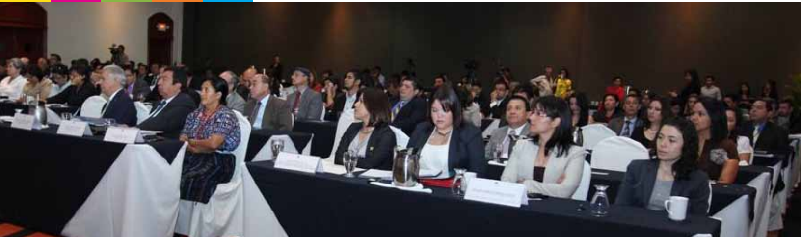
GOPAC Latin America and the Caribbean hosts parliamentary ethics workshop. San Salvador, El Salvador. 23 April 2013.