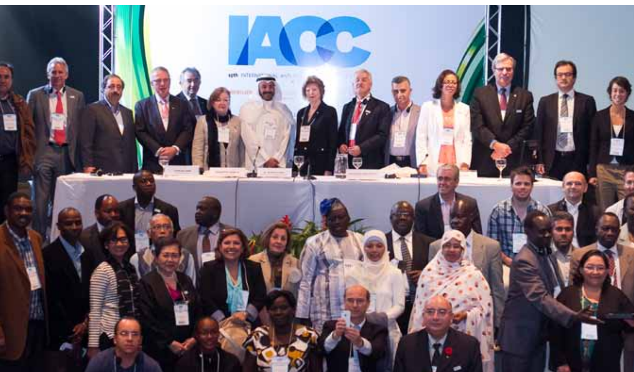
GOPAC panel at the 15th International Anti-Corruption Conference. Brasilia, Brazil. 10 November 2012.

The GTF-PoS engages and motivates GOPAC regional and national chapters and parliamentarians through the sharing of experiences and best practices, and by promoting practical tools and techniques for public engagement on anticorruption issues. It helps different parliamentary systems develop suitable legislation to promote transparency, access to information, and protection of civil rights for those who take a stand against corruption.