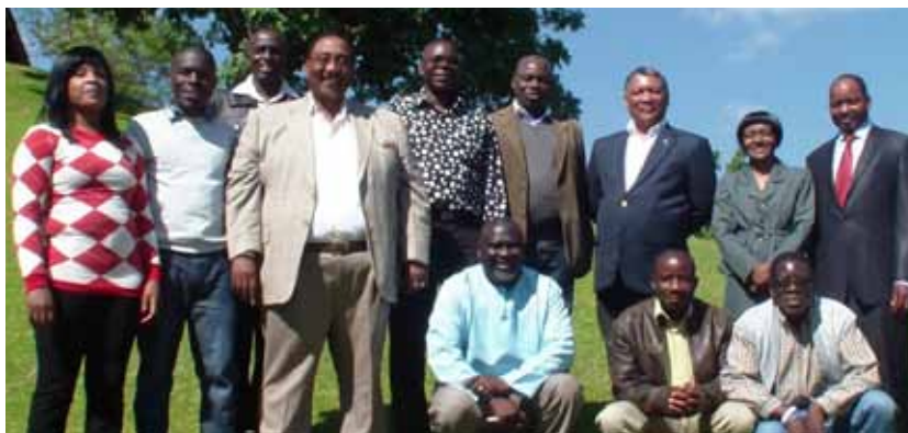
Members of APNAC-Zambia at orientation workshop. Lusaka, Zambia. 6-8 July, 2012.

The code of conduct clearly established APNAC-Zambia's ethical principles. It included commitments to refuse inducements, declare conflicts of interests, disclose the receipt of gifts, declare personal assets, and educate the public about the causes and impact of corruption.