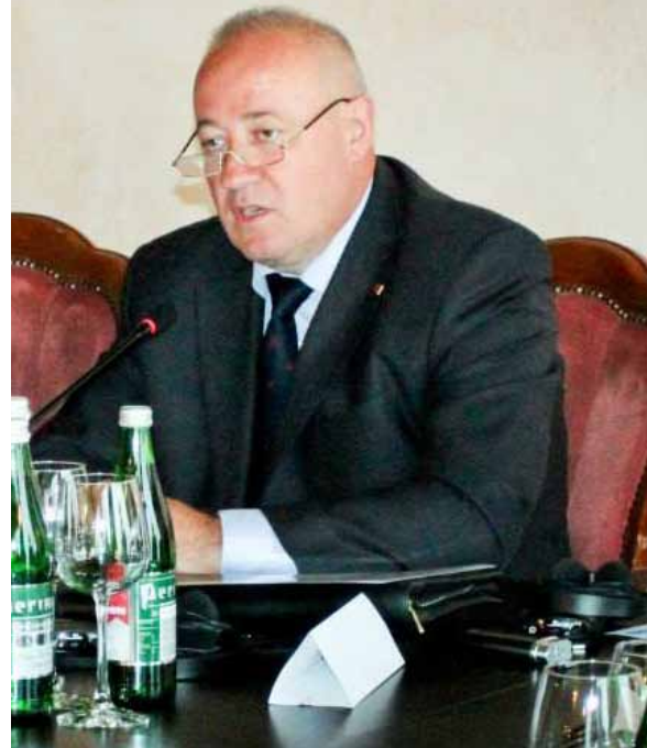
Chair of GOPAC Ukraine, Victor Chumak.

The law also promotes greater participation of society by providing access to information and the ability for civil society to monitor political lobbying on draft legislation, while also containing a provision to protect whistleblowers from loss of employment.