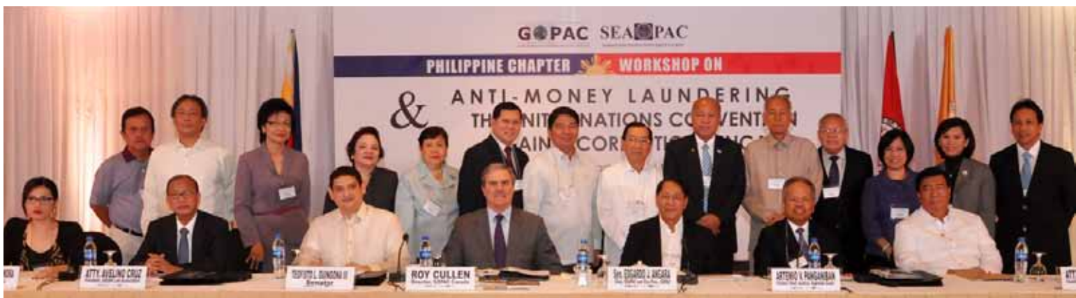
SEAPAC Philippines Anti-Money Laundering Workshop. Manila, Philippines. 16 March 2012.