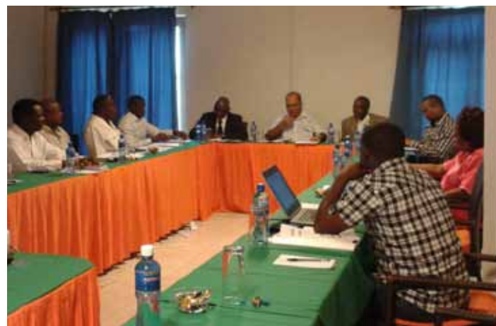
APNAC-Kenya Revitalisation Process & Consultative Meeting held in Mombasa, Kenya from June 20-22, 2013.

Additional amendments to the Proceeds of Crime and Anti-Money Laundering Act were tabled in the National Assembly of Kenya in June 2013, aimed at further strengthening penalties for money-laundering, particularly in relation to terrorist financing.