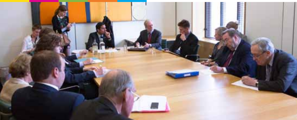
Post-G8 Briefing with Professor Paul Collier hosted by GOPAC UK. London, UK. 24 June 2013.