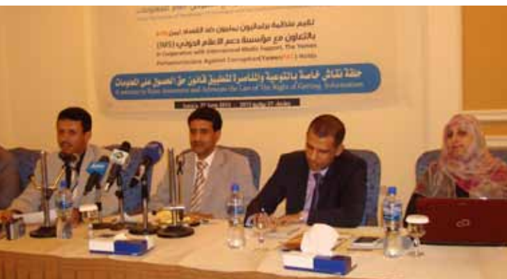
YEMENPAC workshop. 27 June 2013.