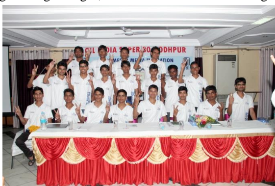
Successful candidates of IIT Entrance Examination-2015 of OIL Super 30 Jodhpur Centre

16). Students have been admitted in various engineering institutes like IIT, ISRO, NIT, State Engineering colleges, Medical institutes and leading Engineering Colleges.