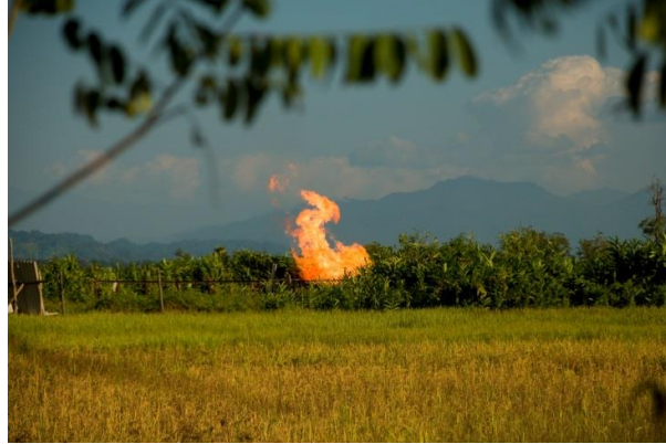
OIL aims at reduction of Gas Flaring through initiatives such as the one mentioned above

gas. It will also lead to the utilisation of high calorific value gas, which is presently flared as a substitute for higher carbon intensive fuels. Finally it is set to have the beneficial impact towards conservation of depleting non-renewable natural resources and thus the promotion of sustainable economic growth via the implementation of an environment friendly technology.