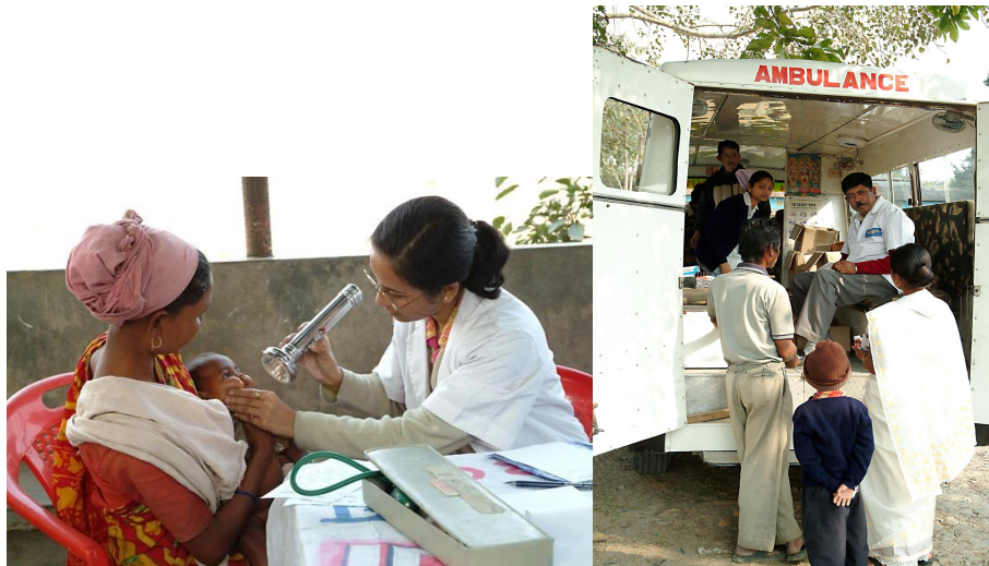
Mobile Dispensary services under Project Sparsha, being provided to local people of OIL operational areas

It has always been one of the most significant community welfare projects of the Company. Started way back in the early eighties, the mobile health care project Sparsha covers OIL operational areas of Tinsukia and Dibrugarh districts in Assam and Arunachal Pradesh. This effort of OIL caters to the primary health care needs of the people in OIL operational areas. The project is conducted through St. Luke's Hospital in addition to OIL's in-house Mobile Health Care team. In 2014-15, 760 health camps were conducted, screening and primary healthcare services were extended to around 1,23,000 patients.