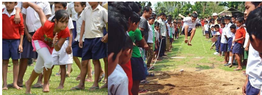
Young children participating in the OIL Rural Sports initiative

Promotion of Sports as a CSR initiative apart from providing a platform and motivating the budding talent from the rural parts of OIL's operational areas, plays the role of uniting the communities, mobilizing, inspiring and instilling responsible behavior among the children and youth. OIL's contribution and collaboration with the social groups, district administration and sports bodies, has helped in making rural sports as one of the most popular sports event in the rural areas creating social advantage, over the years.