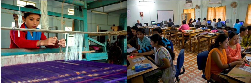
Left: A woman participating in handloom making under the project. Right: Students taking classes at the Computer Centre under the project.

Keeping in perspective the visible success of the project and the requests from the local residents of OIL operational areas for enlarging the project, OIL had supported another 500 SHGs/JLGs under CSR in the financial year 2014-15.