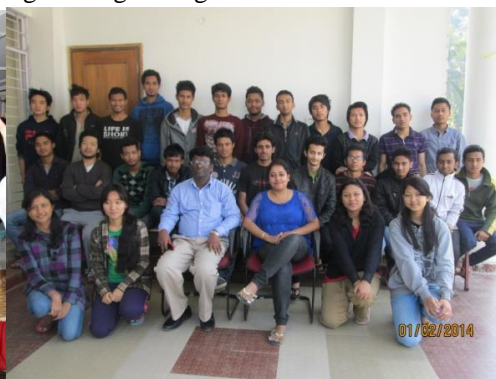
Photograph of passing out batch of OIL Super 30 centre of Jorhat

Oil Awards and Merit Scholarships: Every year OIL rewards meritorious students of operational areas passing class X & XII with OIL Awards and OIL Merit Scholarships which go a long way in encouraging the students to perform better. Till date around 10,000 students have benefited through merit scholarships (inclusive of students from BPL families).