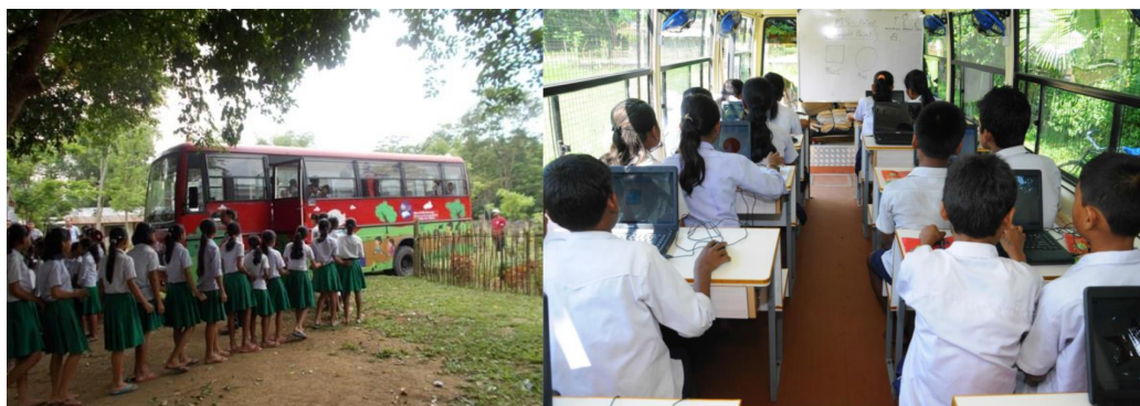
Students actively participating in the Computer Bus learning sessions under Project Dikhya

Computer Education under Project Dikhya : {Project on imparting mobile computer education to school students, through innovation teaching and learning methodologies.} The computer literacy programme is being implemented in eighteen schools within OIL's operational areas in the districts of Dibrugarh, Tinsukia and Sivasagar. The project is being implemented through State Institute of Rural Development (SIRD), Assam and IL&FS Education & Technical Services via mobile education vans/buses which visit each of the areas and schools. Since 2013-14, 5200 school children from class V-VIII have been provided computer education through mobile computer labs (buses).