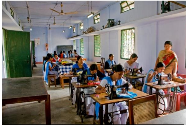
Trainees of the HTPC program, undergoing classes on tailoring, stitching, etc.

Project Kamdhenu: OIL has taken up a dairy development project to provide sustainable livelihood opportunities to local communities modeled on the Gujarat's Amul success story. The Baseline Survey of the project has been completed. OIL aims at replicating the Amul story of cooperative dairy farming in the Company's operational areas of Upper Assam, resulting in milk production --White Revolution-- and economic empowerment of the rural communities.