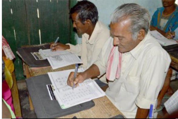
Adult Literacy classes under Project Dikhya in session in villages of OIL operational areas in the Assam

been developed as per the Sarva Siksha Mission of the Government. Till date over 900 adults have been covered under the program.