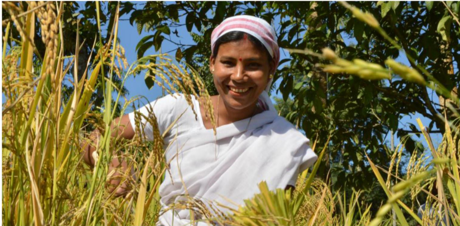
Spreading Smiles through Rural Development: A woman beneficiary of the Agriculture Project under OIRDS