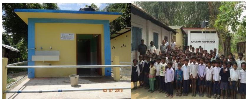
Sample Photos of Toilets constructed in schools by Oil India Limited in 7 districts in Assam under the Swachh Vidyalaya Abhiyan