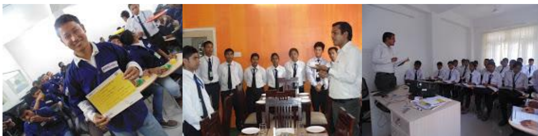
Candidates of Project Swabalamban undergoing training in various vocations

Project Swabalamban on Skill Building: Under the project, OIL provides skill based placement oriented training to youth from its operational areas, by focussing on various employable skills in sectors. The project is being implemented by 3 reputed agencies, viz. Indian Institute of Entrepreneurship (IIE), Guwahati, Construction Industry Development Council (CIDC), New Delhi and IL&FS Educational Technology Services (IETS), New Delhi. Till date over 5500 candidates have been trained and over 4000 candidates have been placed under the Project, in various trades of Construction Industry, Hospitality & Housekeeping Management, Industrial Sewing, Jewellery Making, Electrical Engineering Techniques, besides setting up of livelihood clusters in domains like handloom and handicrafts.