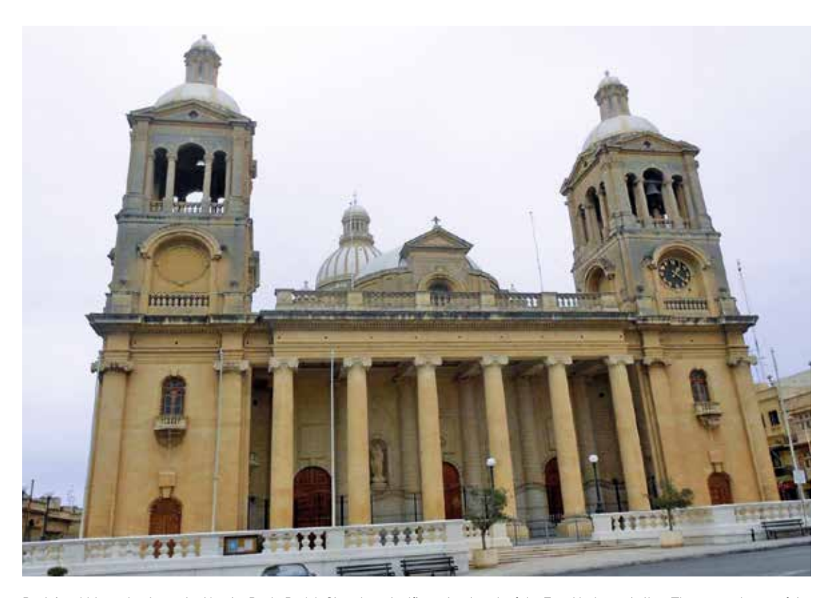
Paola's grid-iron plan is marked by the Paola Parish Church, a significant landmark of the East Harbour skyline. The square is one of the most important commercial centres in the region and is being earmarked for revamping to interconnect critical World Heritage sites and encourage commerce and tourism.

The prison has now been restored and the east and central wings have been adapted to facilitate the operation of a museum. The project also focused on the external and internal restoration of the prison's wings, chapel, central officers' quarters, gatehouse and the south wing. A crucial phase in completing the south wing was restoring a double roof with a Victorian ventilation system, which was conserved in order to guarantee energy efficiency and maintain micro-climatic conditions.