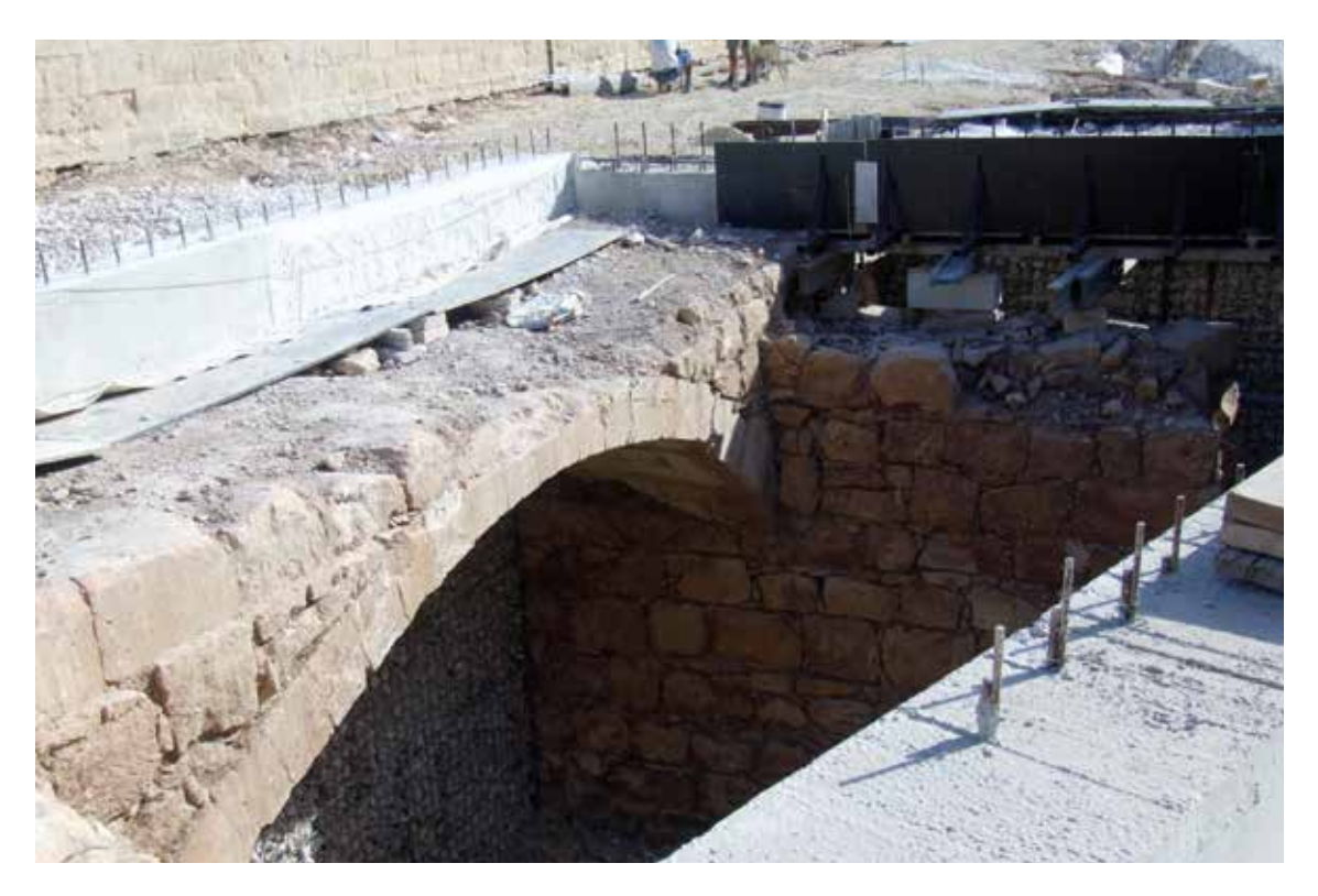
One of the 10 casemates discovered during the preparation works for the rehabilitation of Peacock Gardens in Valletta. The casemate was consolidated and was prepared as part of the interpretation of the garden.

The Local Councils of Paola and Valletta joined the United Nations Global Compact in 2012. In 2014, Regjun Xlokk, the South-East Regional Committee of Malta comprising 15 regional city councils, made the commitment to the Global Compact.