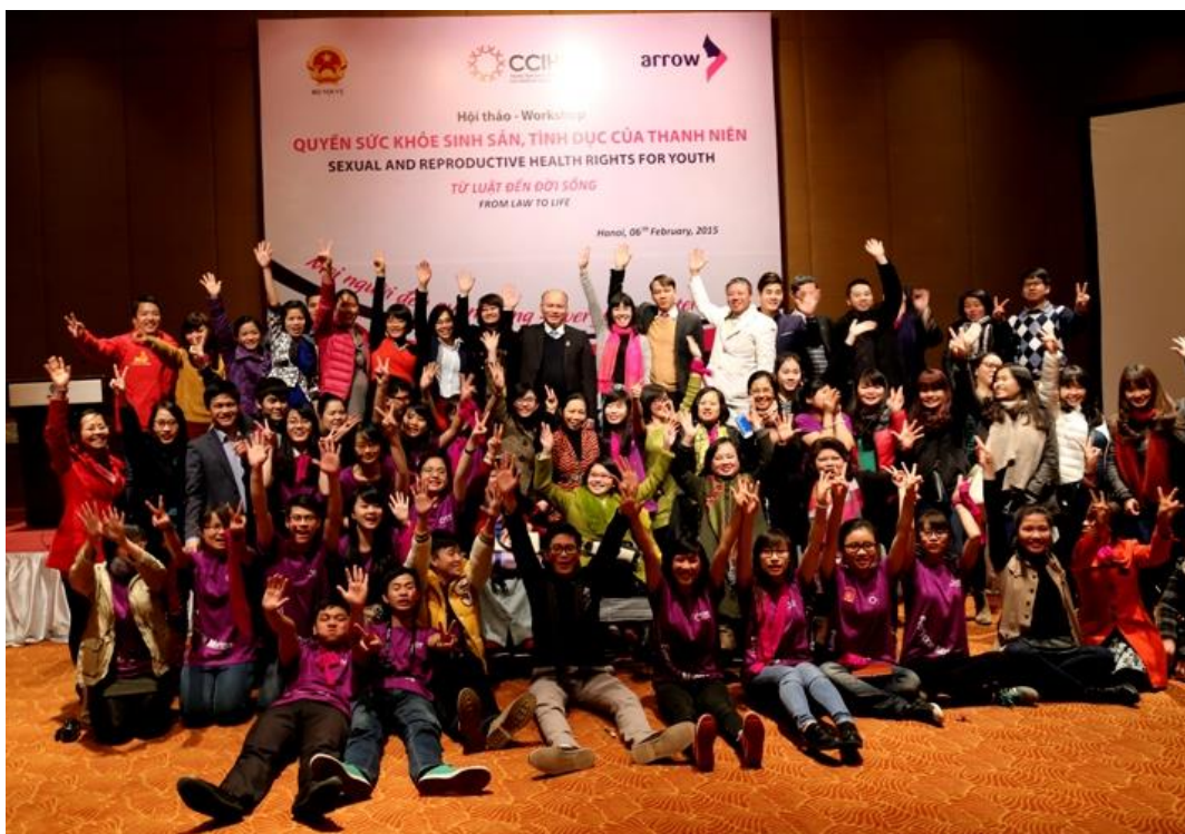
Some workshop participants