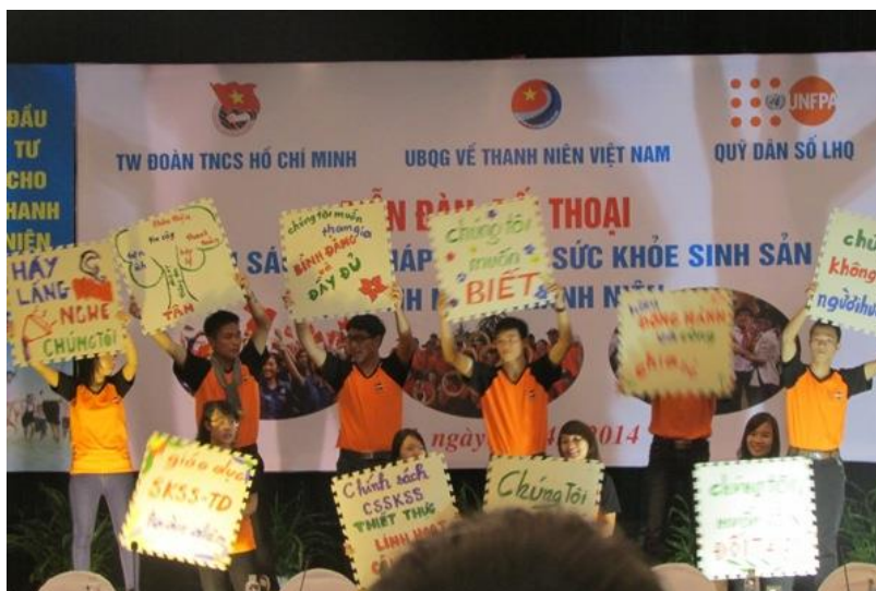
Youth send a message to policy makers in Dialogue

Around 1000 peoples (both online and direct) has engaged in signature motivational campaign "Sign for rights" to support sexual and reproductive health rights of young workers. Although the reasons for support have been quite diversified, these have still primarily focused on rights recognition of youth's sex and reproductive health care and asked the government to take action to meet for youth rights.