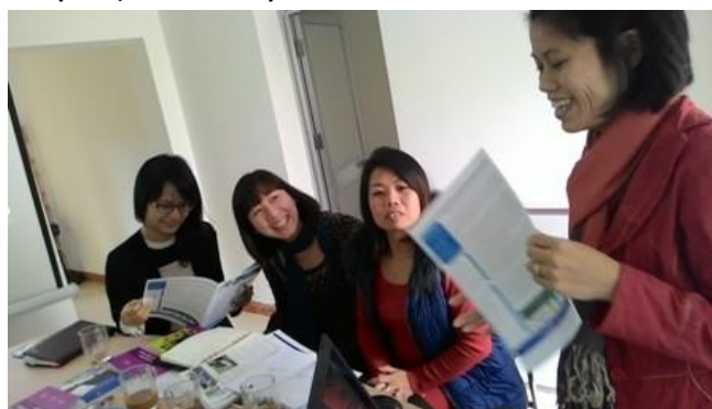
Sharing model from the project