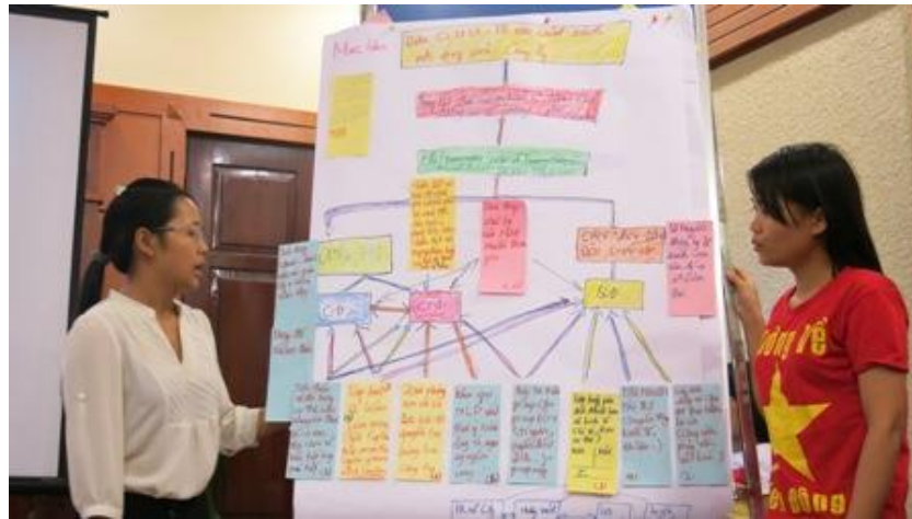
Youth migrant worker present their SRHR advocacy plan

From the advocacy plan of youth in the training workshop, the groups continues to be supported to complete the plan, to gather evidence, and to prepare presentation in the seminar by creative scientific methods.