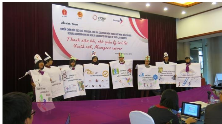
The messages of the youth in the forum

71 members already attended the forum including 49 members of youth who belonging to four specific groups: Young migrant workers, Young people with disabilities, Young lesbian, transgender and transsexual, Secondary and high school students.