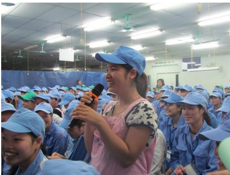
Migrant workers were excited in the game at “Safe for love”

129 young female workers got free gynecological examination and participated in SRH check-up and counseling program. They were provided with free medicines, contraceptives and feminine wash.