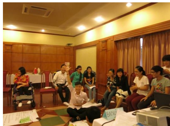
Role play in training workshop