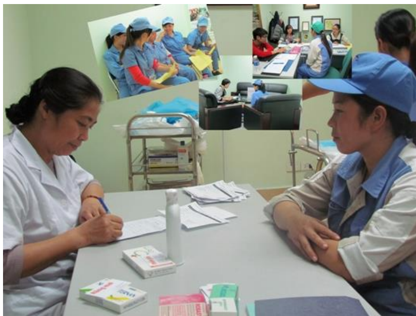
Migrant workers in the activity for gynecological check-up and SRH counseling for young workers

129 young female workers got free gynecological examination and participated in SRH check-up and counseling program. They were provided with free medicines, contraceptives and feminine wash.