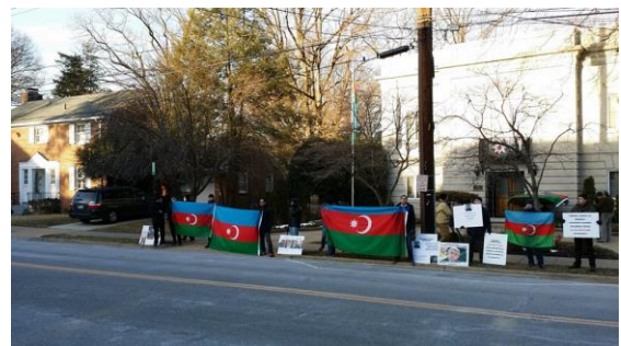
33. Sumgait Counter-Demonstration