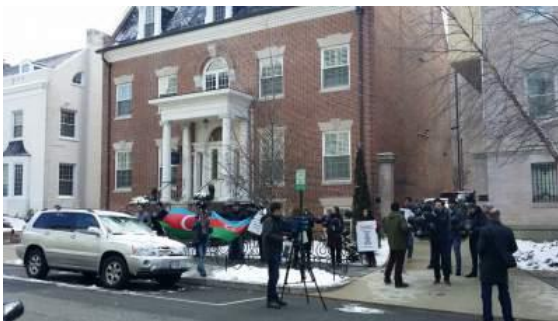
31. Annual Khojaly Demonstration