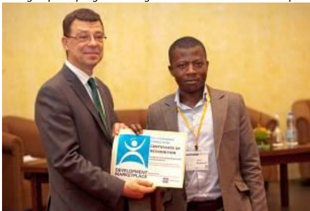
Recognition from the world Bank