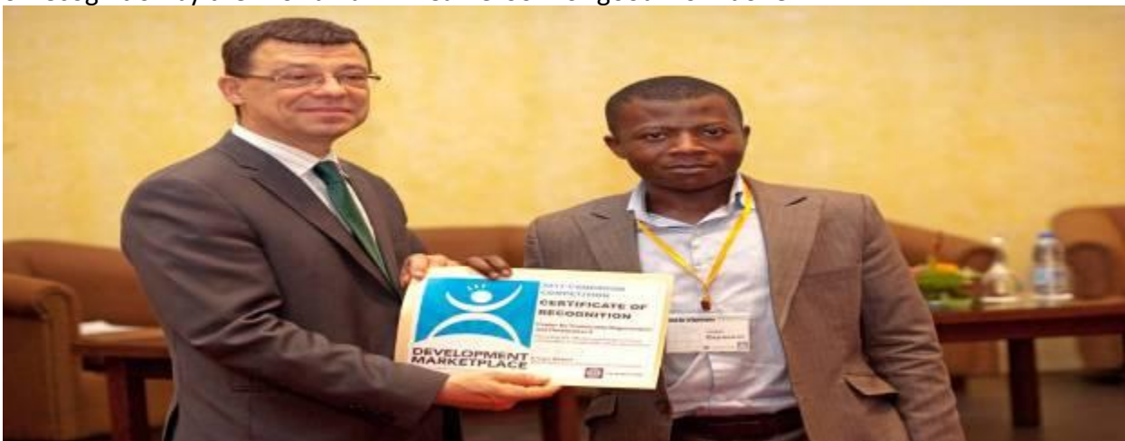
Certificate of recognition from the World Bank for good governance promotion

In 2011, CCREAD-Cameroon was the lone NGO from the South West Region of Cameroon that won the World Bank Development Marketplace completion which lead the World Bank through The Catholic Relief Services to offer a micro grant of worth 20,000 USD to initiate activities for the promotion of good governance within the educational sector. CCREAD-Cameroon during the implementation phase of the project was visited, monitored and evaluated in the field by the World Bank, Catholic Relief Services and a set of internal external project evaluators who assessed the implementation of the project from 2011 -2013 as very satisfactory with excellent adherence to donor administrative and financial prescriptions. After 2013, CCREAD-Cameroon was presented a certificate of recognition by the World Bank in Cameroon for good work done.