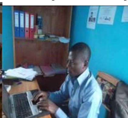
programs office in Bangem