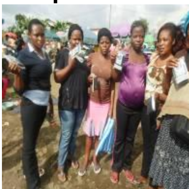
Giving hope to pregnant village women