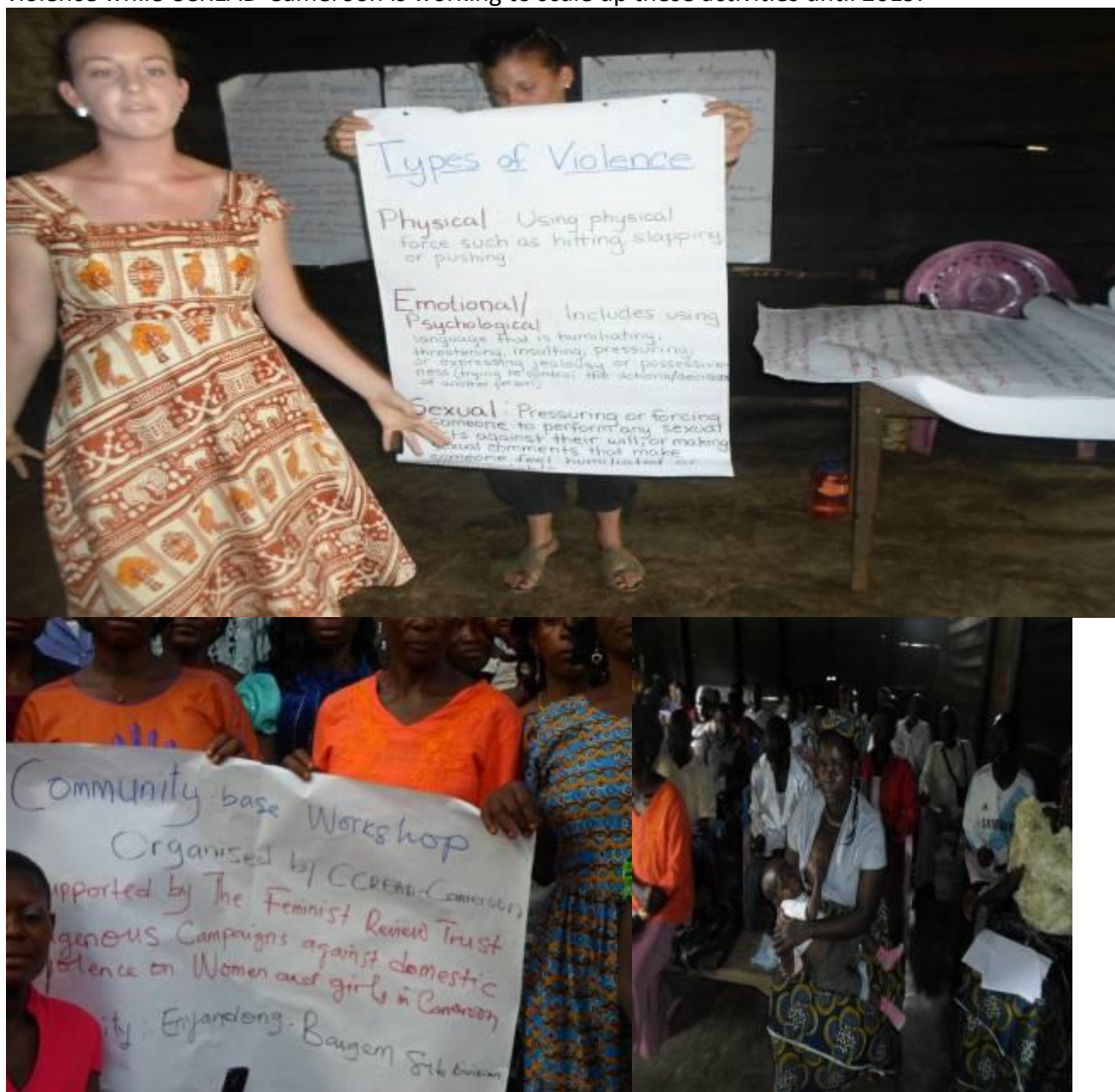
CCREAD-Cameroon focuses on fighting all forms of domestic violence on women and girls

authorities have been educated on the needs to respect the rights of women and girls and to see women as partners in development and not as tools they use when and how they desire. Functional groups are now campaigning against sexual, physical, emotional and other forms of violence while CCREAD-Cameroon is working to scale up these activities until 2019.