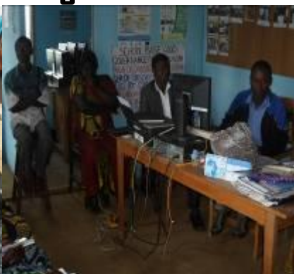
Women take part in action planning