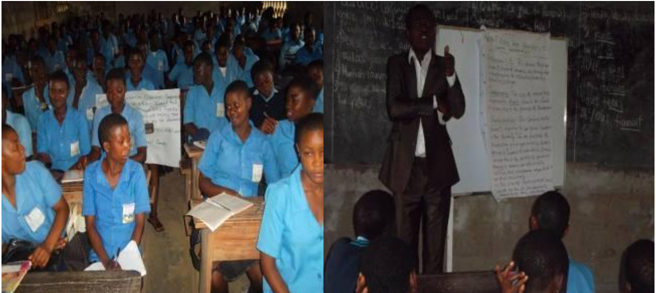
School base ESD Program changing the minds of youths to be change agents of their homes and communities

In 2014, 25 colleges were engaged and more than 8,500 students were reached. During the campaigns organised at schools as capacity building workshops, students are organised into promotion clubs with debates, dramas and quiz on these topical issues to test their practical understanding of principles, concepts and applications. It is one of the activities organised each year voluntarily by CCREAD-Cameroon which has changed the perspectives of students, teachers and parents.