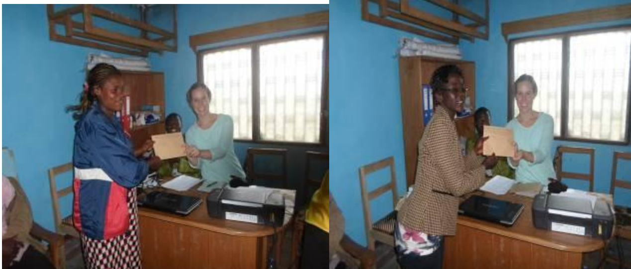
Teenage mothers supported by CCREAD-Cameroon to reduce poverty incidence on their families