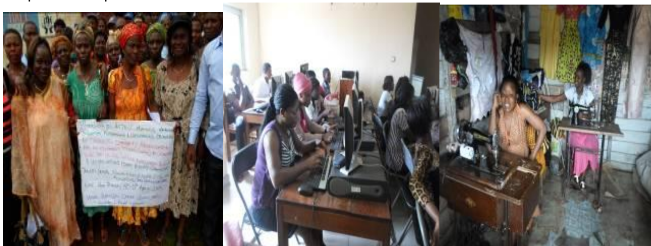
Actions implemented and impact being created on the lives of rural women