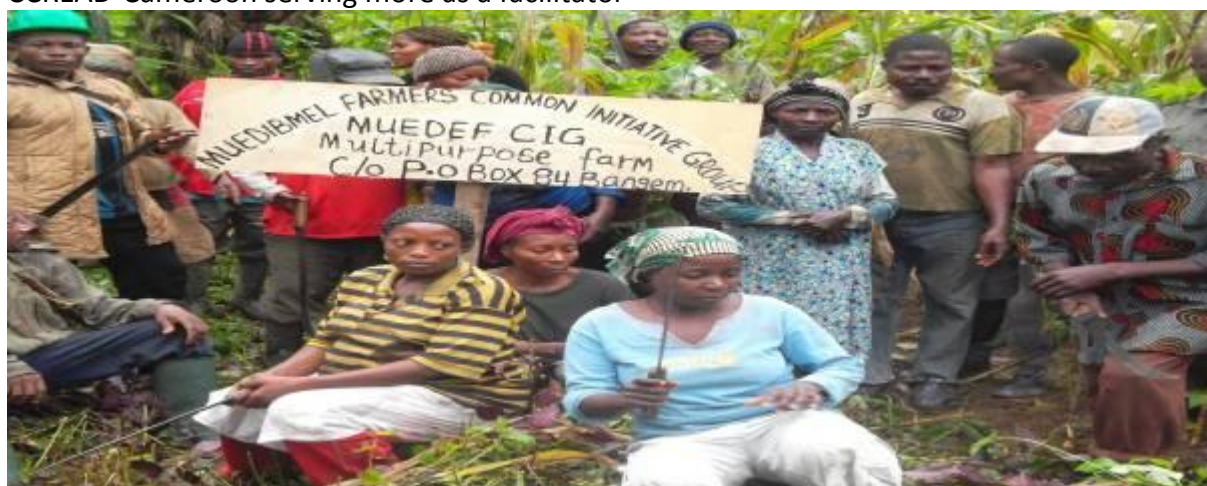
Groups created and coordinated by CCREAD-Cameroon in actions during an on farm training

This was thought to be an important activity because local communities have come to be very effective and efficient in projects and programs through these groups which they are the leaders with CCREAD-Cameroon serving more as a facilitator