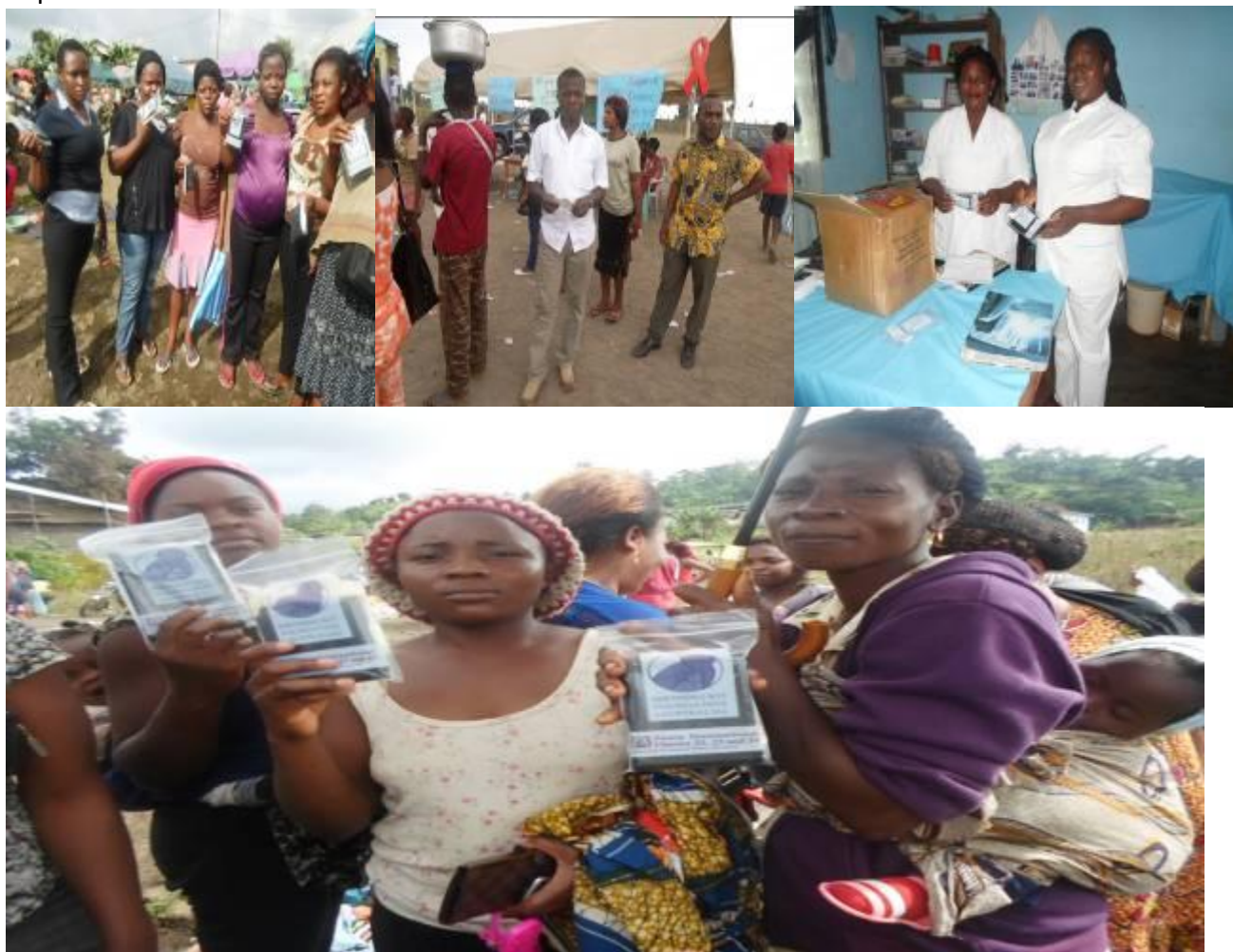
PMTCT actions and the donation of life saving birthing kits to pregnant women in villages

The project is a long term commitment of CCREAD-Cameroon to reduce maternal mortality within impoverished communities.