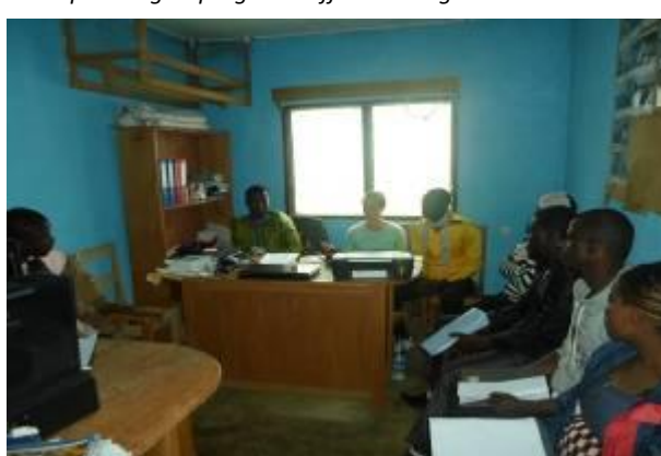
Youth delegates present their option documents

Official summary Report of Activities carried out by CCREAD-Cameroon from January – December 2014