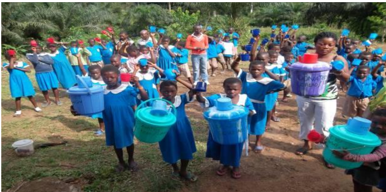
Efforts made by CCREAD-Cameroon's outreach team to save the life of children

In 2014, CCREAD-Cameroon was motivated by the impact created by the donation of hygiene and sanitation materials which were donated to some 13 community primary schools in 2013. In over 20 rural communities touched negatively by the outbreak of cholera which killed more than 10 school children, CCREAD-Cameroon had identified in collaboration with health officials through a baseline study that the poor hygiene and sanitation within community schools was a global call for concern. To continue its annual response to this problem, 3 community schools in Cameroon were assisted in 2014 through the donation of waste disposal cans, distribution of drinking buckets and drinking cups to more than 500 primary school pupils. This has reduced the transmission of water born diseases and no school child died in 2014 in all the schools assisted.