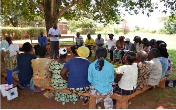
October 2015: Sio Port community interacting with the officers from the Women Enterprise and UWEZO officers at Sigalame Secondary School in Sio Port, Busia County- Kenya. Meeting organized by Ufadhili Trust to link the community groups with Micro-Finance Institutions.