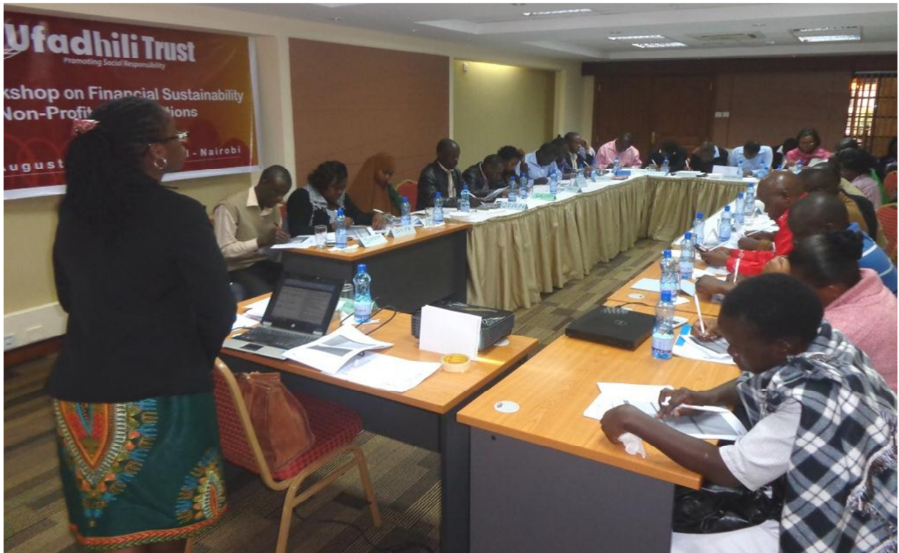
August 2014: Training on Financial Sustainability for Non-Profit Organizations.