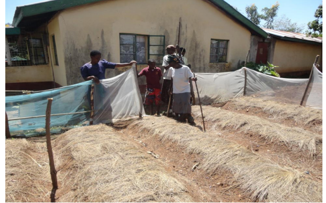
November 2013: Ufadhili Trust facilitated members of Osiri community village (Kenya); Dagnet Women Group to prepare nurseries for planting of vegetables that is used in supplementing family income.