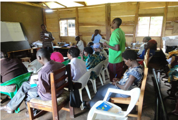
July 2014: Farmers post-harvest management training organized by Ufadhili Trust in Mfangano Island – Lake Victoria – Kenya.