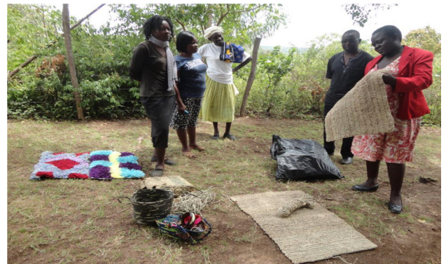
October 2015: Community members in Osiri village, Kisumu County – Kenya admire some of the works and craft products they have been trained on by Ufadhili Trust and Zingira Nyanza Community Craft.