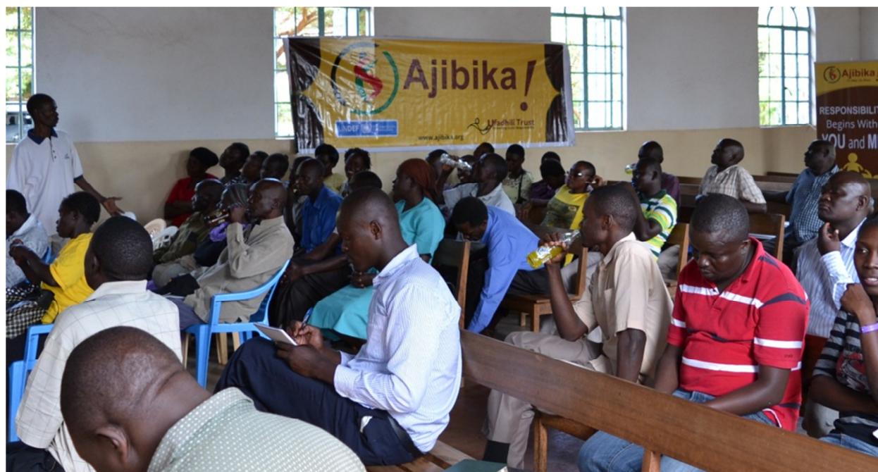
October 2015: Public sensitization meeting in Siaya County-Kenya.