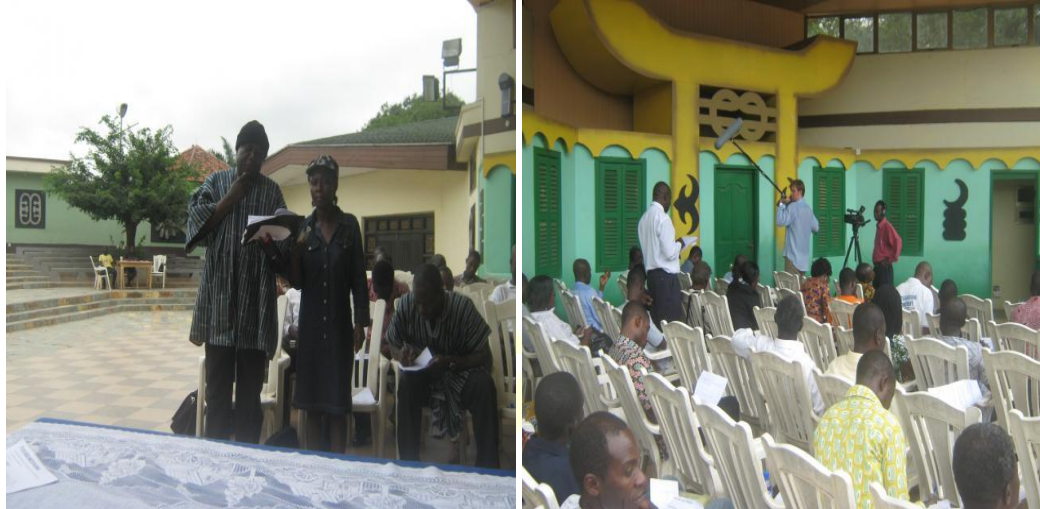
Pictures from the Kabissa – www.kabissa.org – Meet UP Meeting in Kumasi