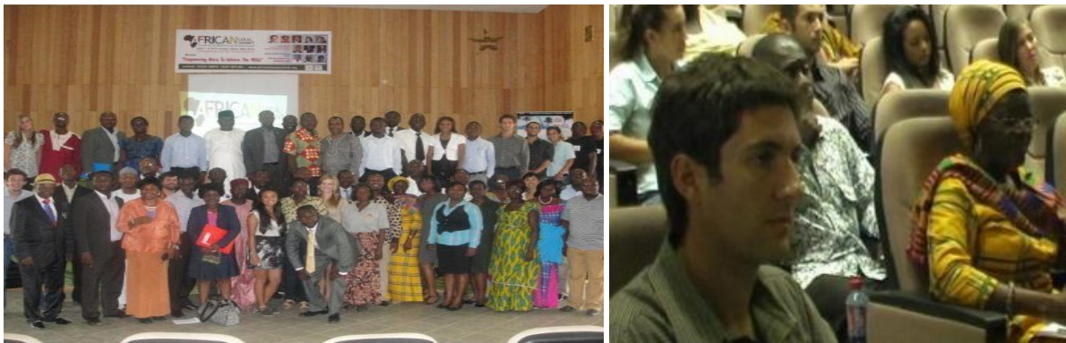
Section of Participants at the African Summit 2012