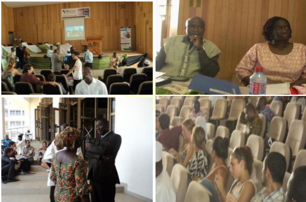
Some images from the African Summit 2012