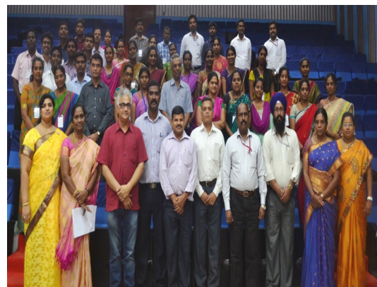
Speakers and Participants of FDP on Creative Pedagogy