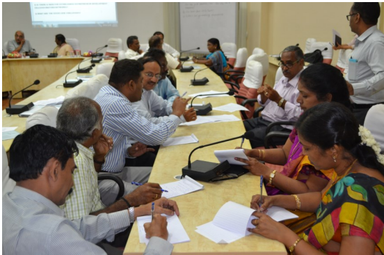
Principals/Senior faculty from various institutions sharing their needs to promote Entrepreneurship

CSIE & Vellore Institute of Technology-TBI plan to organize Capacity Building programs for faculty members/teachers of Polytechnics and ITI's to foster an entrepreneurial ecosystem in their institution and thereby, promote a culture of entrepreneurship among their students.