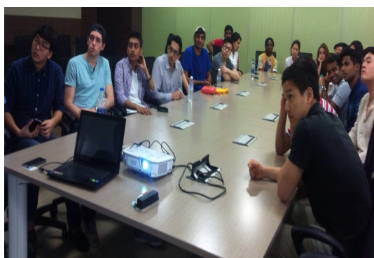
Students from NYU's Stern Business School