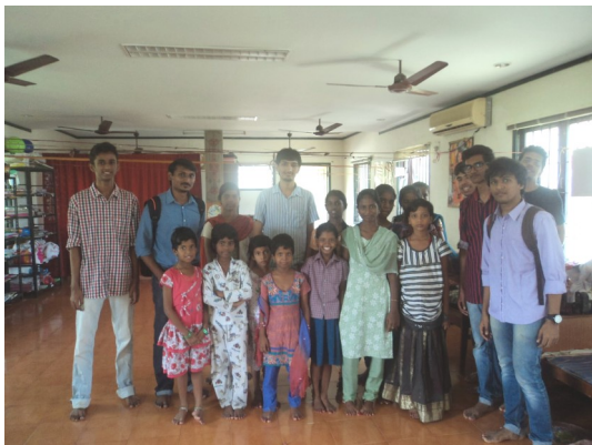
Students at Vishranthi

CSIE organised visits for Innovation and Social Entrepreneurship minor course students to the villages of Annathur, Nathanallur, Kattavakkam, Vandavasi, Vadanemmeli (Irula community) and to Social enterprises Banyan and Vishranthi.