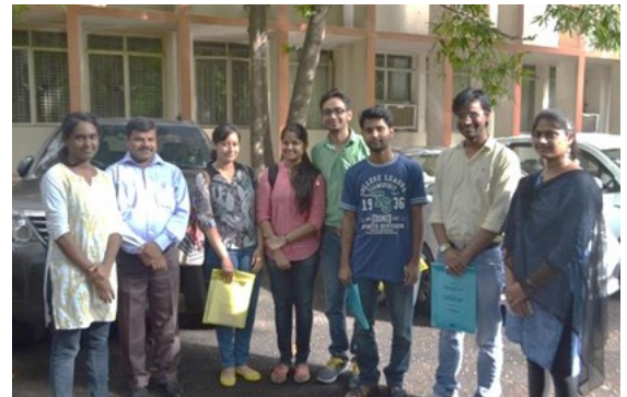
Students from TISS with CSIE staff