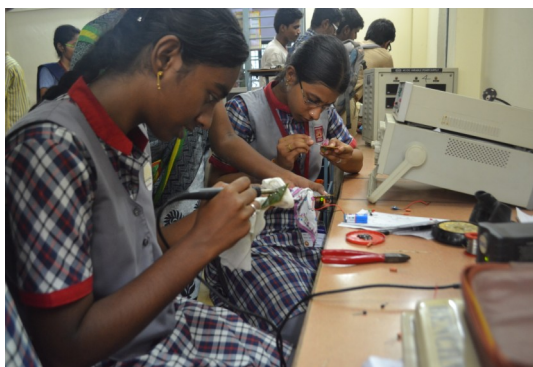
During one of the sessions on “Engineering is Fun” workshop

CSIE conducted its 3rd edition of a 3-day Summer Camp on 'Social Innovation through Technology' for school students of grade 11 and 12 from 6 to 8 th , May 2015 at IIT Madras. The focus of the program is to create awareness about the role of technology and entrepreneurship to solve socially relevant issues. 77 students (52 private and 25 rural government school students) attended the camp.