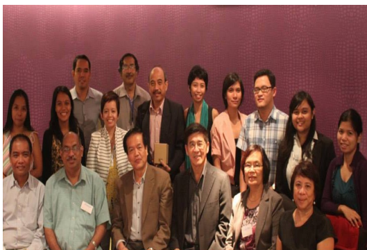
Project Advisory Committee 2014 Annual Meeting July 25-26, 2014, Manila, Philippines