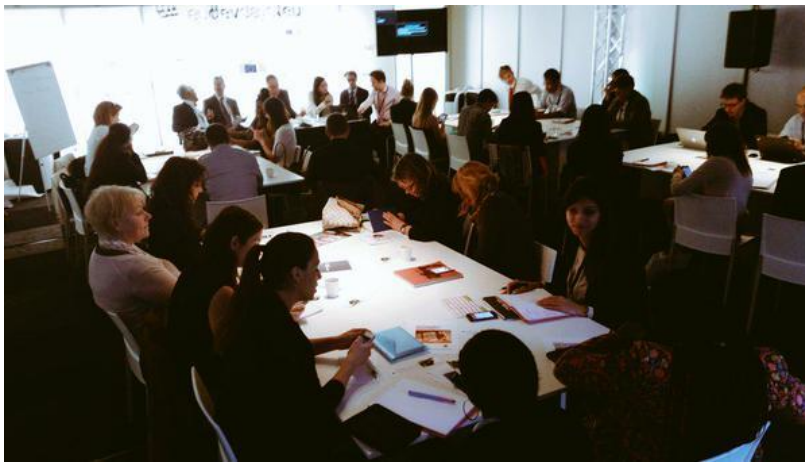
AVSI presentation at European Development Days on June 4 th 2015 of the work done on Business and Human Rights.