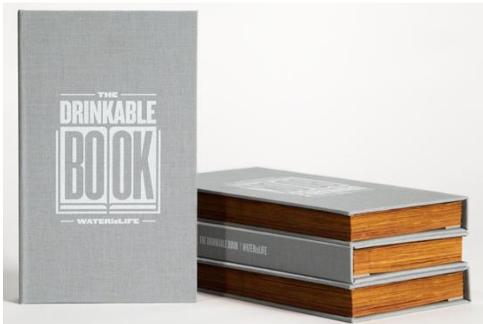
Photo: Copies of the Drinkable Book