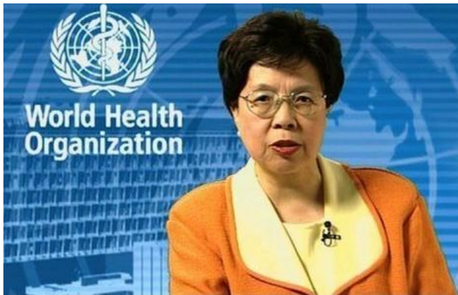
Photo: Dr. Margaret Chan, Director General WHO