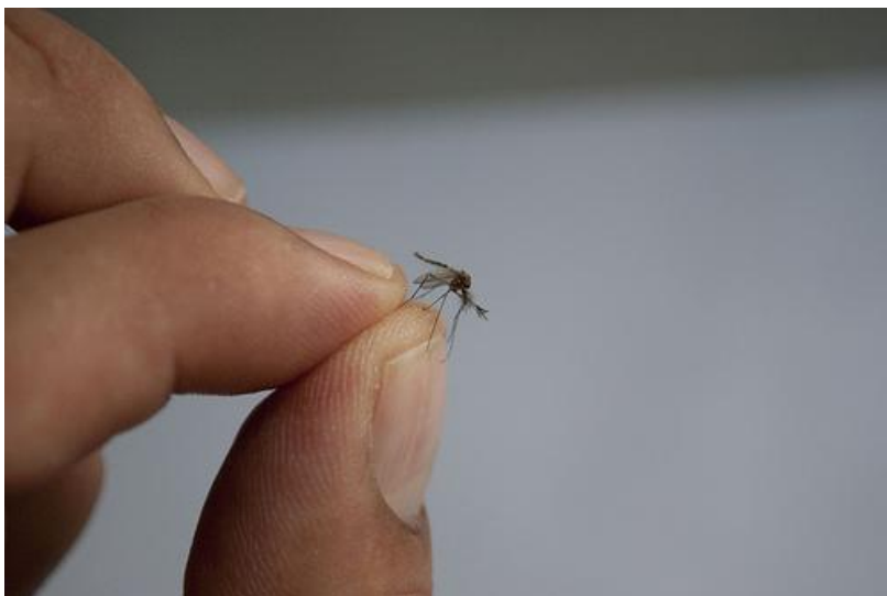
Photo: Anopheles mosquito that causes malaria