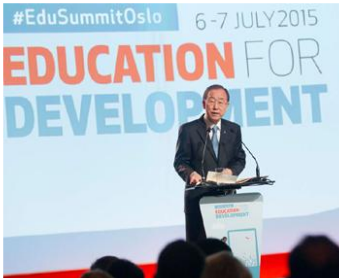
Photo: Mr. Ban Ki-Moon UN Secretary General