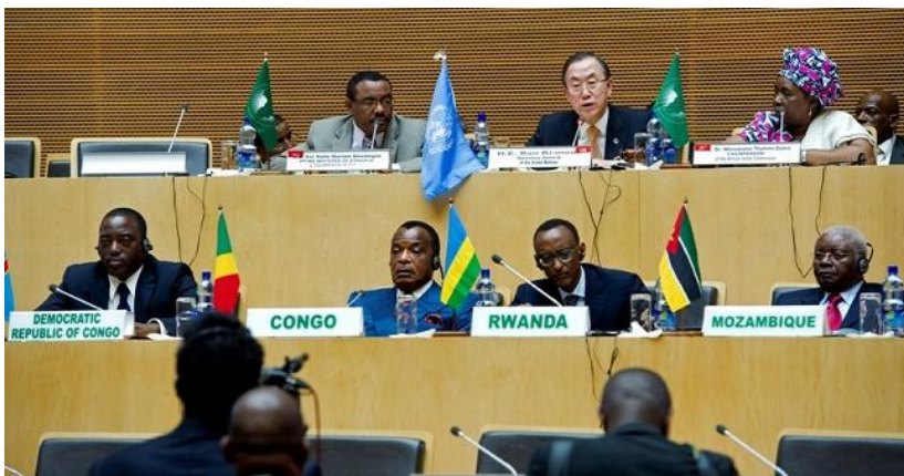
Photo: Africa Presidents at AU Session