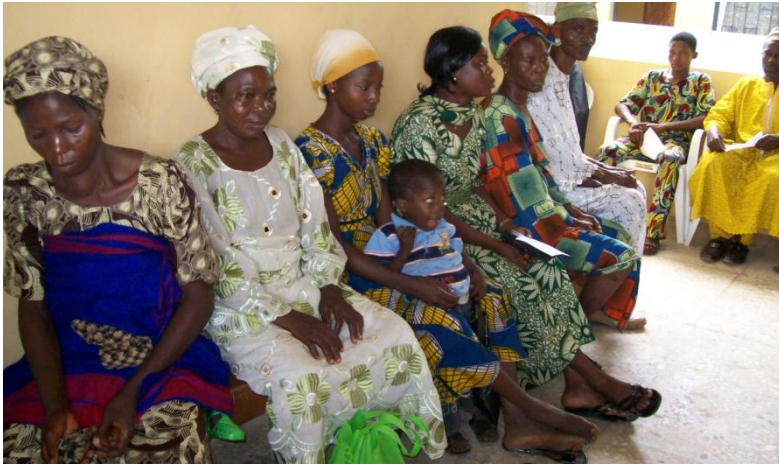
Photo: PROFOH patients waiting during medical mission