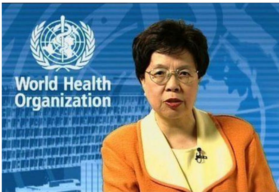
Photo: Dr. Margaret Chan, Director General WHO