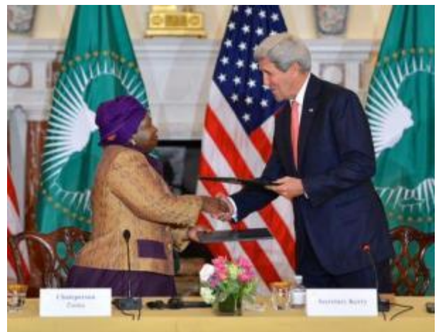
Photo: John Kerry greets AU Chairperson.

May: Profoh endorsed Nigeria Government with US$ 1.5 M for Procurement of Treatment for people with multi-drug resistant TB