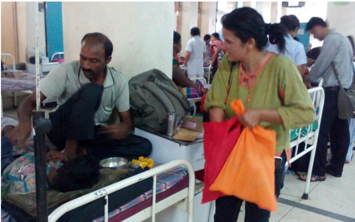
Photo: PROFOH Country Director on Rounds with supplies.