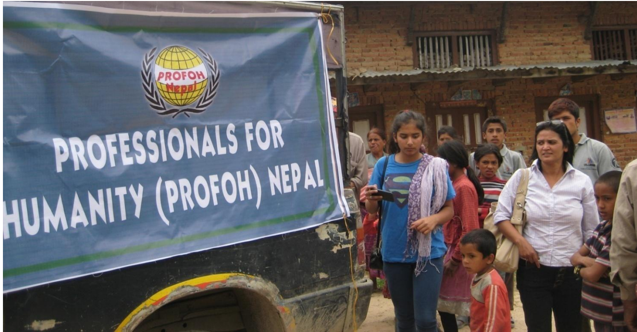
PROFOH team and delivery van in Kathmandu