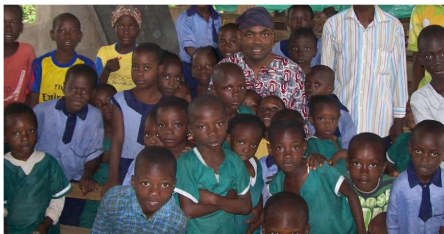
PROFOH Executive Director celebrating the African Child in a private School

On a continent where millions of children subsist on less than 1 euro per day, education represents a way out of poverty for many. Education also helps fight the spread of diseases, improves children's health, and promotes peaceful and inclusive societies. Further, it promotes confidence and cohesion, and is essential for the psychosocial well-being of children.