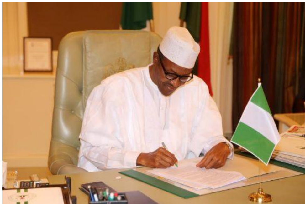
Photo: President Mohammadu Buhari of Nigeria

PROFOH is a leading member of the Stop TB Partnership of the WHO .The Organization has endorsed the Nigerian Government's approval of US$1.42 million to procure quality assured Second Line Drugs (SLDs) that will be used to provide treatment for 500 multi-drug resistant TB (MDR-TB) patients. The second line drugs ordered by the government will be delivered by Stop TB Partnership's Global Drug Facility starting this June 2015.