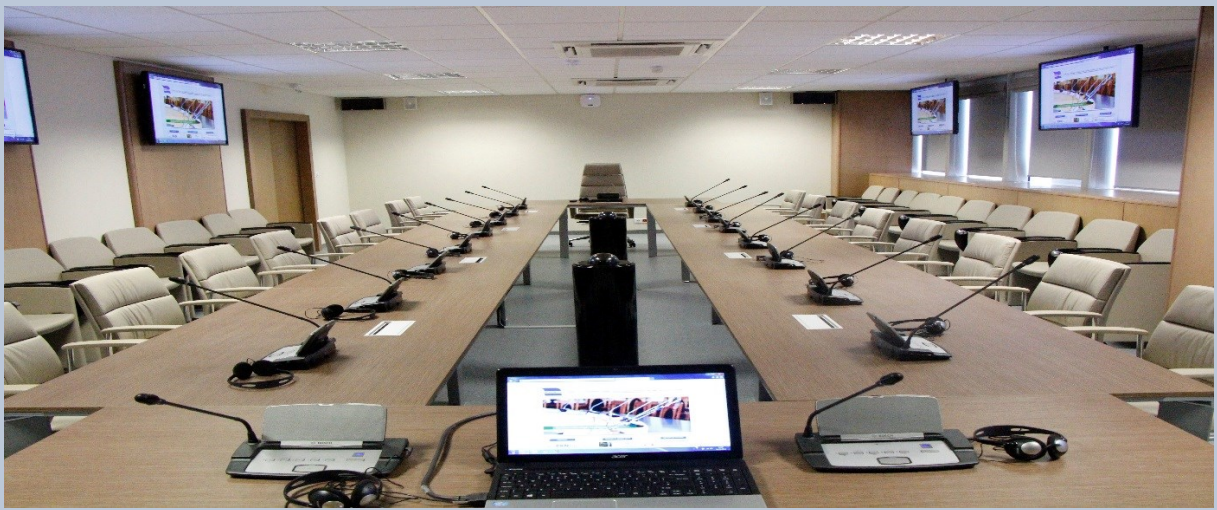
Comprehensive meeting room solution including simultaneous interpretation and video conferencing solution at the African Development Bank, AFDB, Abidjan .

AV-Huset has its own production of custom designed pedestals, cabinets and audio visual furniture. AV-Huset's reference list contains more than 600 customers and the company has conducted more than 800 customised installations both in Denmark and abroad.