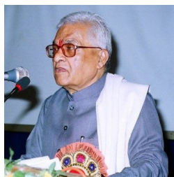
Dr Jagannath Mishra

Dr Jagannath Mishra a senior Economist, Politician, Social Worker and Administrator has been appointed as a Hon'ble Chairman for the Financial Year 2012, he is an M.A in Economics and PhD, formally University Professor of Economics and formally Chief Minister of Bihar thrice, Formally Union minister of Government of India, and elected two times Member of Parliament (Rajya Sabha). He is with the organization since 2004.