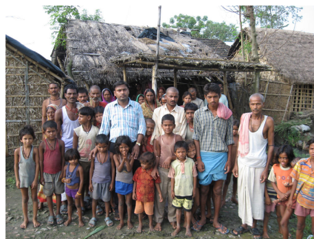
@ Bihar Flood 2008