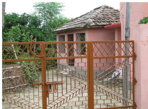
Our ICT for Rural Development Center @ Kahara, Saharsa