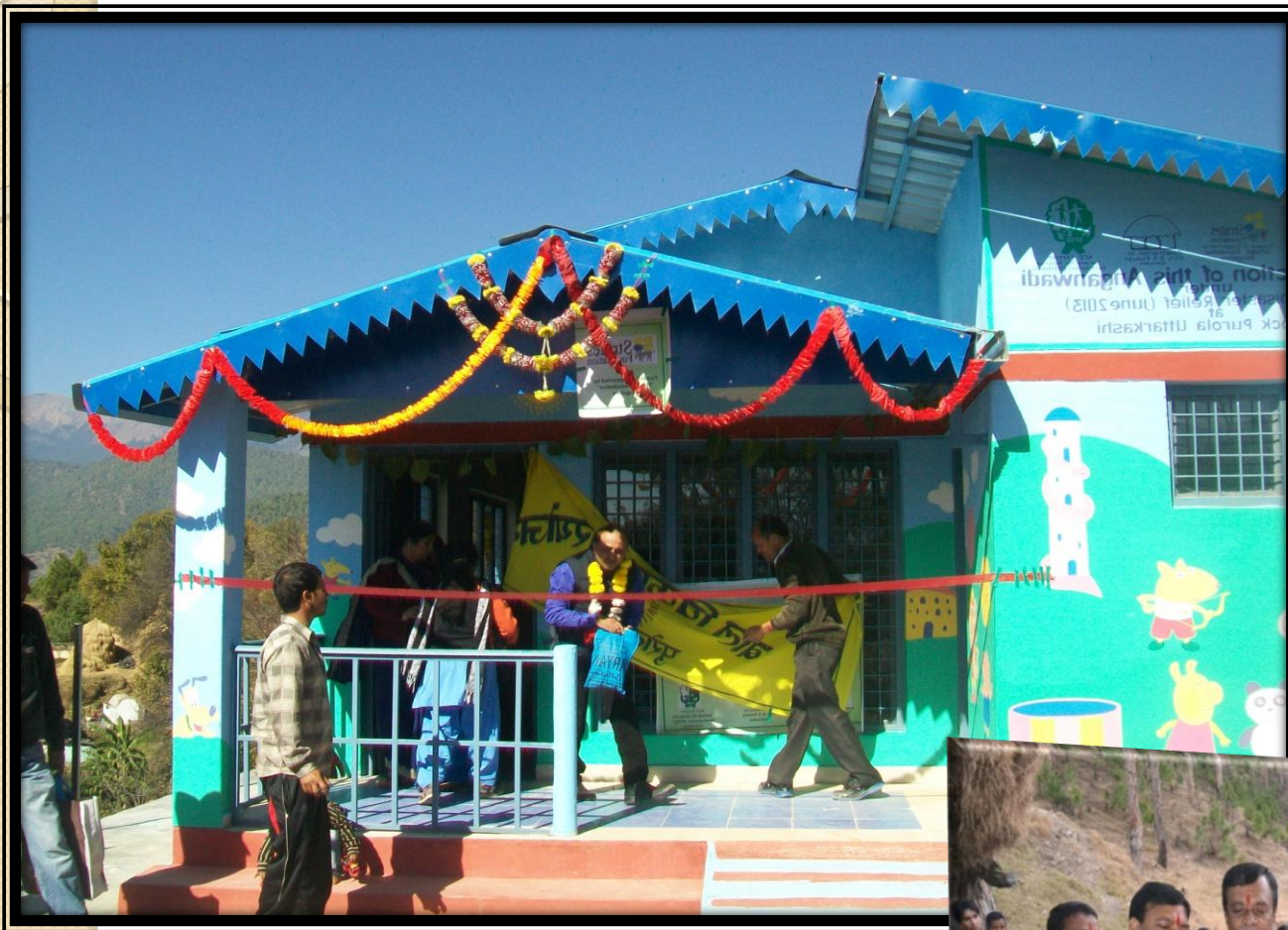
Inauguration & Handing Over to ICDS Deptt, Govt. of Uttarakhand 12 th November 2014