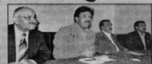
प्रकार वार्ता में स्ट्राइड्स फाउंडेशन व एसएफआईडी के प्रदाधिकारी

देहरादून (एसएनबी)। फार्मा कंपनी स्ट्राइड्स फाउंडेशन व स्वयंसेवी संस्था सोसाइटी फॉर इन्क्लूसिव डेवलपमेंट (एसएफआईडी) ने संयुक्त रूप से उत्तराखंडी केंद्रों का पुनर्निर्माण किया है। आंगनवाड़ी केंद्रों को वर्ष आग में क्षतिग्रस्त हो गये थे। संस्था ने आठ क्षतिग्रस्त आंगनवाड़ी केंद्रों का पुनर्निर्माण का जिम्मा उठाया था। जिन चार केंद्रों का पुनर्निर्माण किया गया है उन्हें बाल दिवस को पूर्व संस्था पर प्रसारण को सुनिश्चित कर दिया गया है। यह जानकारी स्ट्राइड्स फाउंडेशन के मैनेजिंग डायरेक्ट