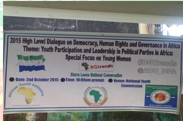
DG TRENDS NATIONAL CONVERSATION 2015 IN SIERRA LEONE FOR THE AUC