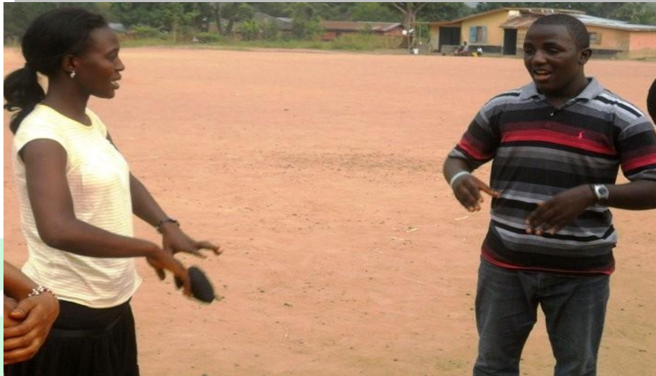
TEAM BRIEFING FOR COMMUNITY OUTREACH SESSIONS