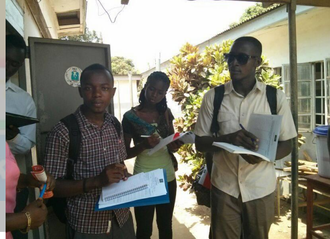
STUDENT PILOT PROJECT ON MATERNAL HEALTH CARE, MAMAYE SIERRA LEONE

Forum for the Development of young People *6 off Johnson Street, Aberdeen, Freetown, Sierra Leone *Registration Number MSGWC/2012 * Contact: +23278856281, +237672693707, +23277904691 * Email Address: forumforthedevelopment@live.co.uk *Bank Details: Guaranty Trust Bank, 204/204/6653/1/590