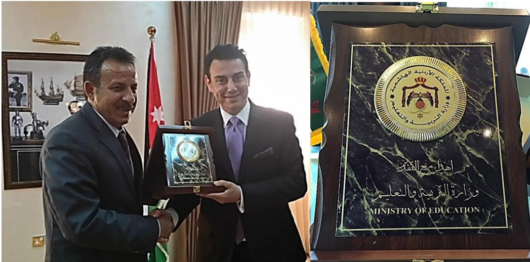
Award from the Ministry of Education of Jordan