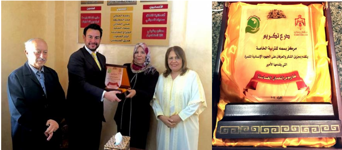
Award from the Basma School of Special Education in Karak, Jordan