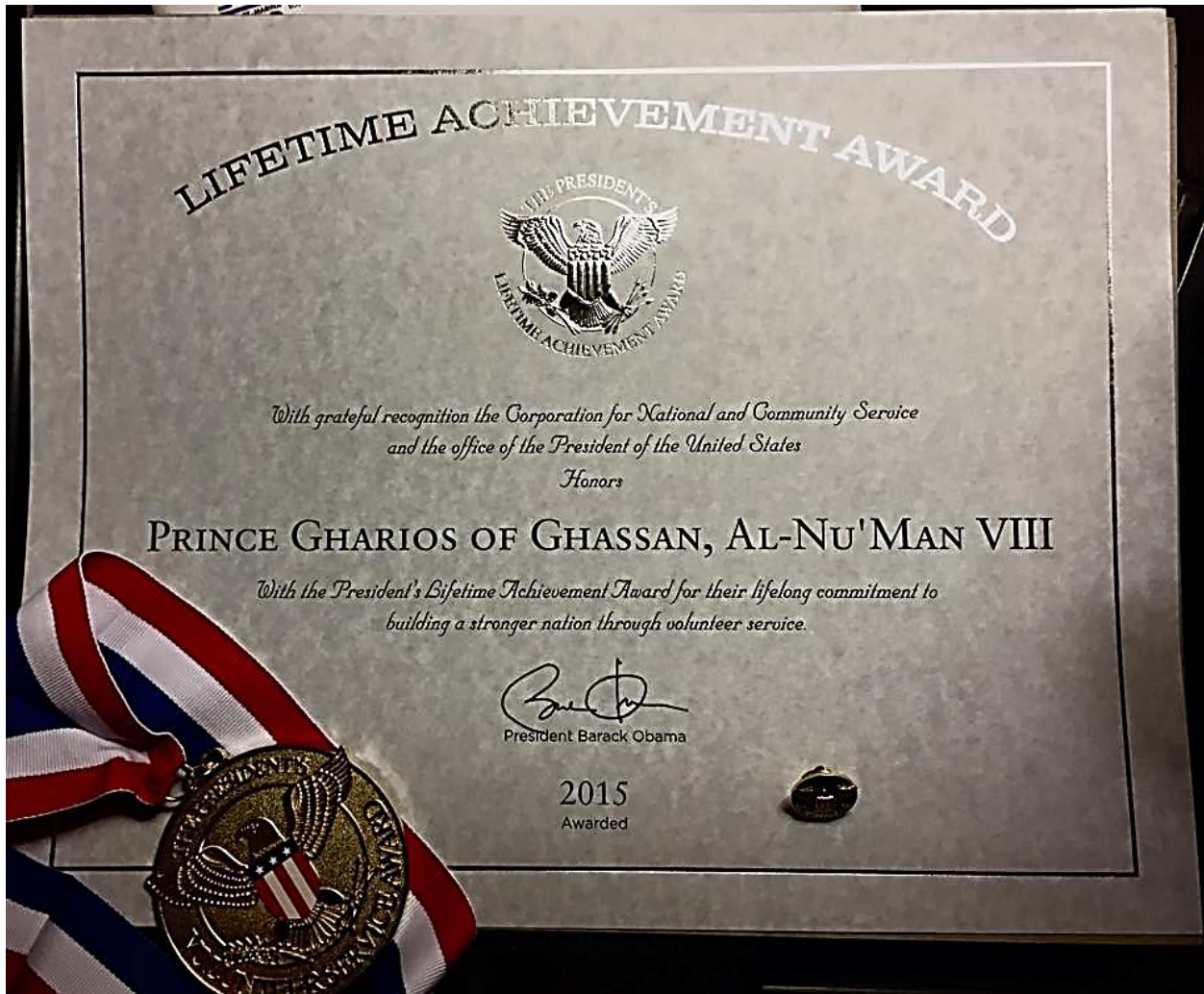
US President Award (Lifetime) for Volunteer work (2015)