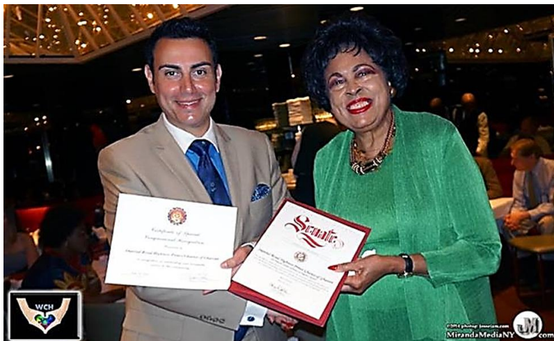
United States Special Congressional Recognition and Senatorial from California (2014)