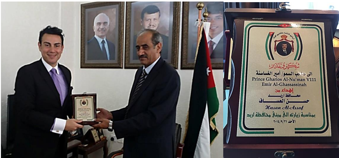
Award from the Governor of Irbid, Jordan