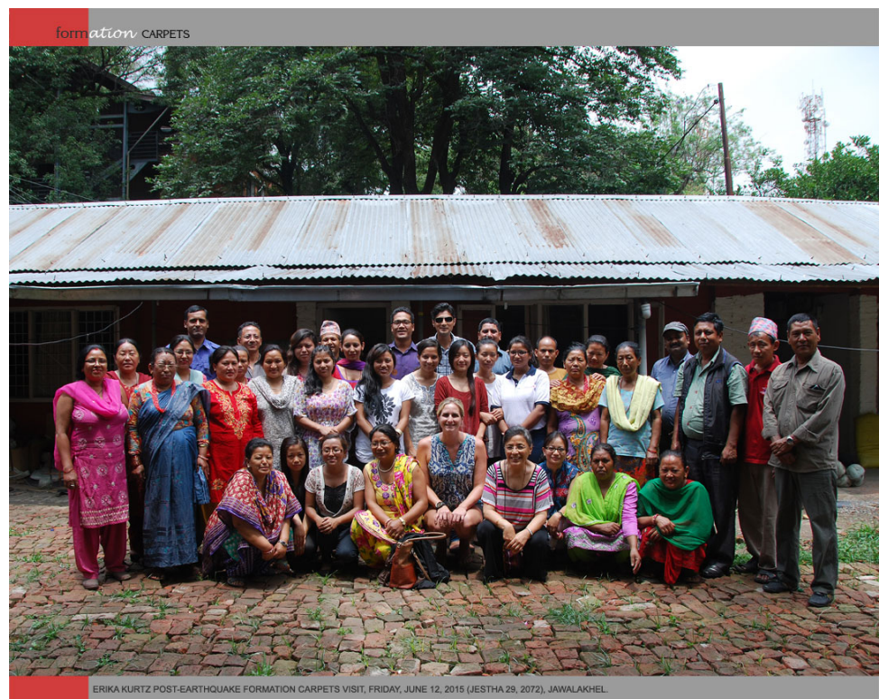
Formation Carpets Family

In addition to providing free education to the children of the employees, Formation Carpets has for over two years started generating employment opportunities for the very children that it educated. As more and more children of veteran employees graduate from school and reach a legal age for working, Formation Carpets hires them into the company for work that their weaver mothers could only dream of doing -- operating a computer. Formation Carpets is digitizing its two-decade old carpet manufacturing process, which includes daily digital pictures of all carpets on every loom. An online information management system lets employees communicate directly with the customers of Formation Carpets. In the past, only two people handled client correspondence via email. Now, a workforce of 10 is in constant communication with customers on the other side of the world. This gives the children of the weavers a breathtaking insight on how the business works past the loom, that their mothers have been working on for years. Formation Carpets hopes to incubate the 2nd generation employees in international business with a goal to turn them into successful social entrepreneurs in the future.