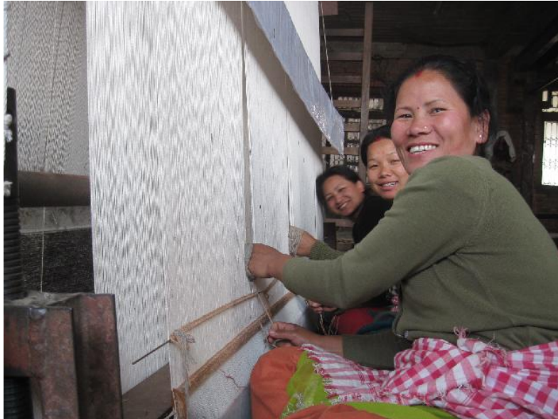
Weavers at Formation Carpets

Formation Carpets believes in the need for integration between the business and NGO sectors, as together they can bring social and economical changes at a more aggressive rate.