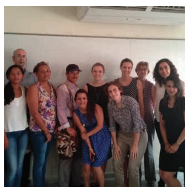
Photo: Regional visit to Tranquilandia, a peasant farmer community in northern Colombia.

The Colombian Caravana is a not-for-profit organisation that monitors abuses faced by human rights defenders in Colombia. In August 2014, two members of the firm joined 66 other individuals from 12 countries on a week-long delegation to Colombia, where they carried out regional visits to conduct witness interviews with victims of human rights violations, human rights defenders and state officials. In Bogotá, the Caravana met with government authorities including the Vice-President's Office and the Land Restitution Unit. The delegation subsequently prepared regional reports highlighting the key issues faced by human rights defenders and a national report is due to be released in 2015.