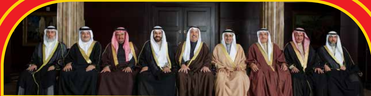
GPIC announces $190.2 million in Profits for 2014