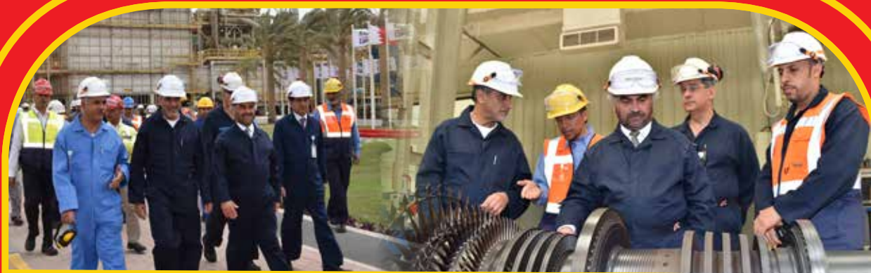
GPIC Managing Director Turnaround Site Visit