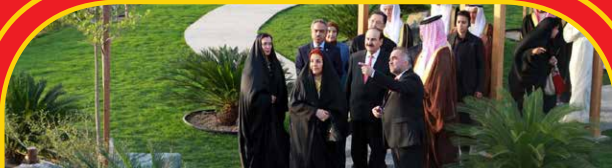
Her Royal Highness Princess Sabika inaugurates Bahraini Japanese Friendship Garden