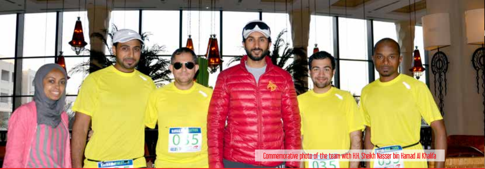
Commemorative photo of the team with H.H. Sheikh Nasser bin Hamad Al Khalifa