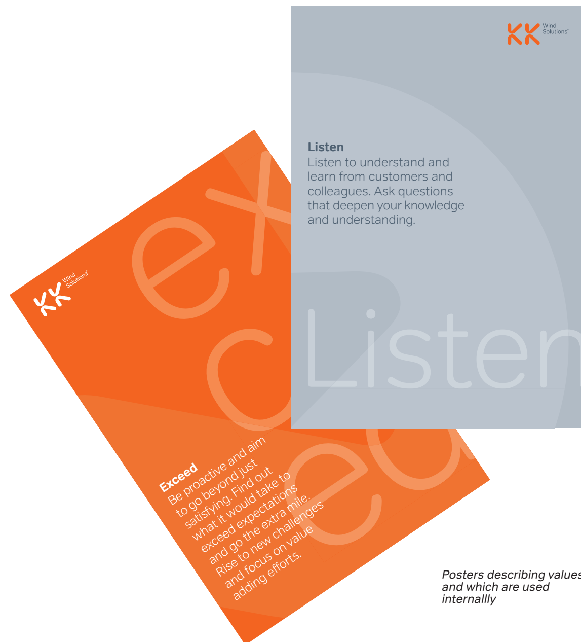
Posters describing values and which are used internally

Care, listen, observe, anticipate, innovate, integrate and exceed are values which represent the core foundation of our success. They support our vision and strategic actions. By promoting them both internally and externally we aim at instilling them in all our employees and partners.