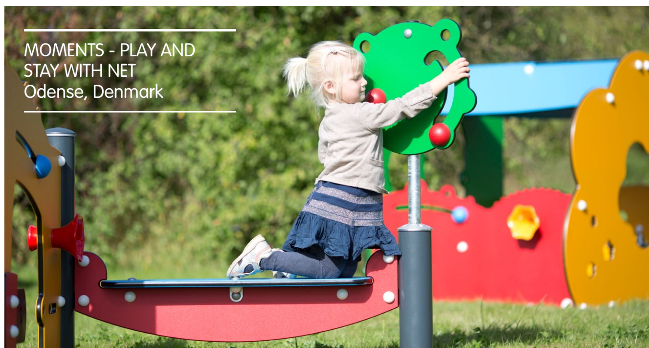
MOMENTS - PLAY AND STAY WITH NET Odense, Denmark

The amount of lost hours related to accidents (LTA: Lost Time Accidents) has increased to 608 hours (560 in 2013), corresponding to only 0.22% of the total production time. No serious injuries happened in 2014. We will continue a structured and managed approach to work actively for a safe and healthy working environment for our employees in 2015. In 2014 we have extended regular 5S audits to 6S audits (the sixth "S" means SAFETY) for the purpose of performing regular safety audits to support us to identify possible risks in the entire plant and prevent accidents and production time loss.