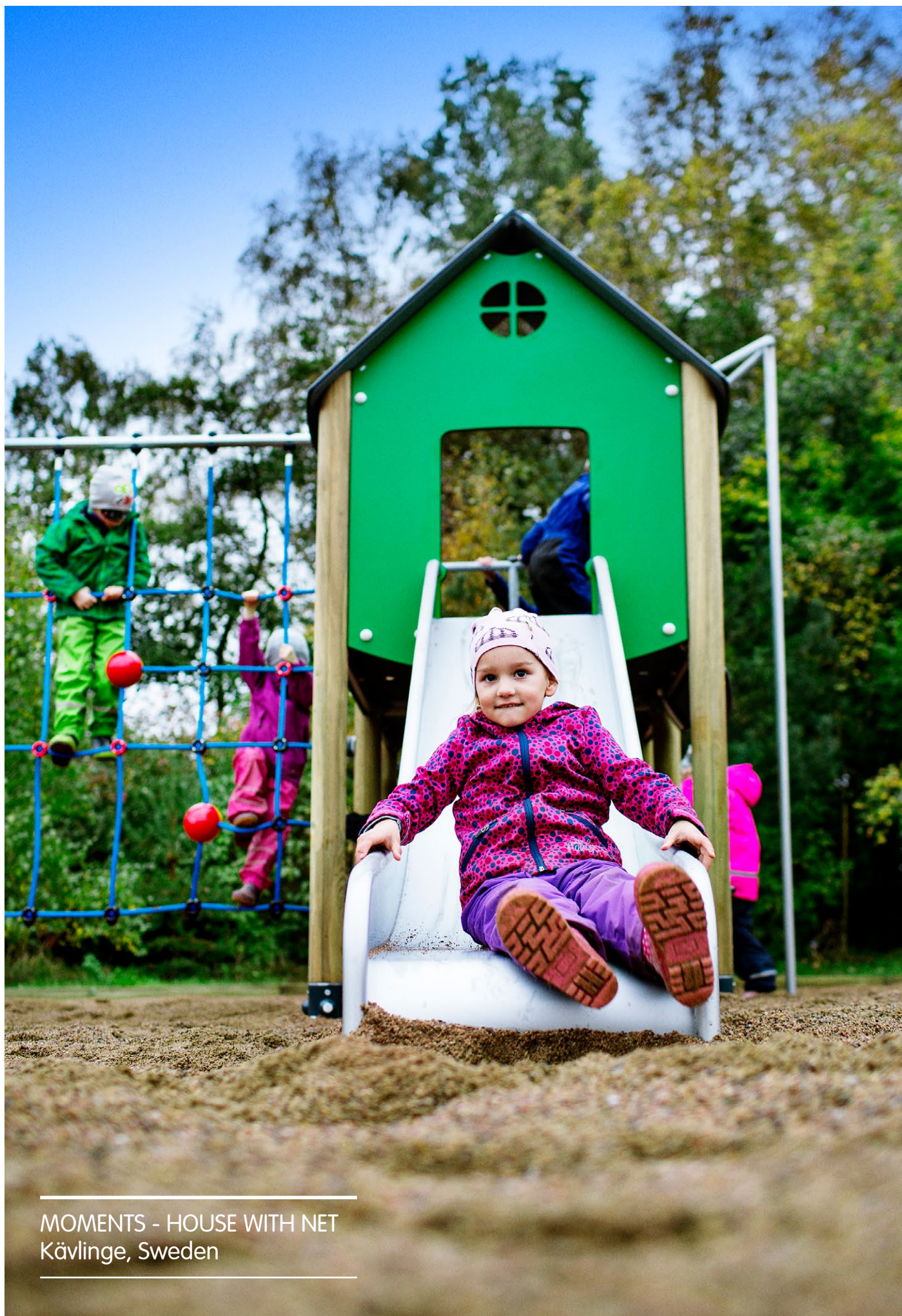
MOMENTS - HOUSE WITH NET Kävlinge, Sweden