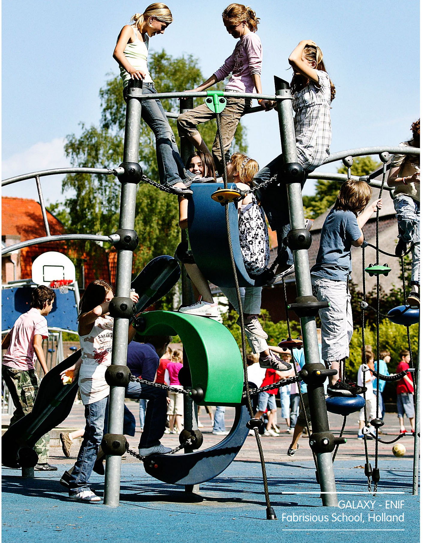
GALAXY - ENIF Fabrisious School, Holland