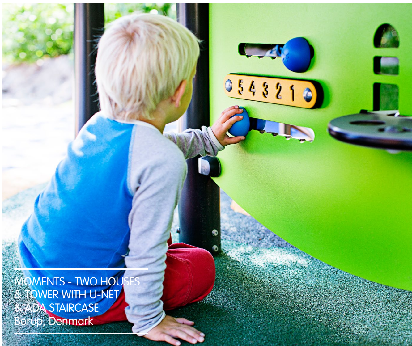
MOMENTS - TWO HOUSES & TOWER WITH U-NET & ADA STAIRCASE Borup, Denmark

In the years to come KOMPAN will focus even more on how we can minimize the waste of resources and reduce environmental hazards.