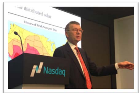
Reed Hundt talks climate policy at the Nasdaq Inside Energy Summit at MarketSite (New York, 2014)

Nasdaq serves as chair of the Sustainability Working Group (SWG) at our trade association, the World Federation of Exchanges. The SWG investigates the material need for exchanges to seek, standardize, and/or publish environmental, social, and corporate governance (ESG) data. Through careful analysis of existing data forms and reporting frameworks, group members seek to understand the real impacts, both positive and negative, on our business. Furthermore, the SWG reflects upon the role of exchanges in the formation and sustenance of a fair, open, and transparent economy- and the proper leverage that exchanges may exert in promoting more sustainable business models.