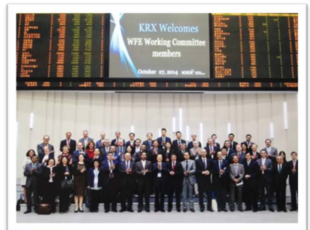
Exchange leaders gather in Seoul, South Korea at the World Federation of Exchanges meeting in October 2014

Nasdaq is an active participant in the development of a U.S. National Action Plan (NAP) for Responsible Business Conduct, sponsored by the U.S. State Department. This NAP will include guidelines for the preservation of human rights in the workplace, both within corporations and their supply chains.