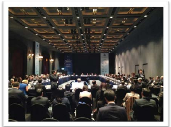
Closed-door session on exchange industry oversight at the 2014 WFE Board of Directors meeting

On May 28, 2014, Nasdaq became the first company to join the SASB Corporate Roundtable, a program designed to help corporations incorporate SASB standards in SEC filings. The SASB Corporate Roundtable provides a pathway for companies to evaluate the materiality of non-financial information, assess disclosure readiness, establish a baseline, address internal controls, and perform auditing, technical, and legal reviews. As leaders in managing environmental, social, and governance (ESG) issues, Nasdaq will demonstrate how to disclose non-financial material information using SASB standards.