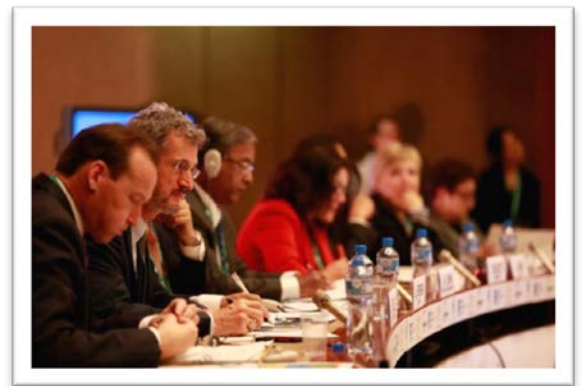
Exchanges, regulators, NGOs, and institutional investors discuss governance and ethics at the World Investment Forum (Geneva, 2014)

We have a robust internal mechanism of policies and guidelines to ensure the quality and integrity of our operations and our people. All of our policies require ongoing training and certification from all of our employees within 30 days of employment and every year thereafter. All of our policies including a 24/7 international whistleblower hotline and frequently asked questions section are available to all of our employees and contractors via Nasdaq’s internal employee website.