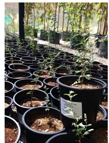
Ghaf Shoots today