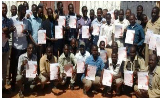
Training and certification in Sudan is for all employees

Employee training is ongoing: allowing us to identify abilities and to promote from within the organization. It is not uncommon to find that employees who began with the company have risen to supervisory or management roles.