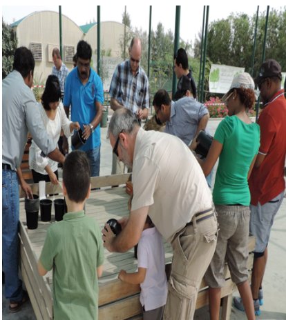
Preparing and Labeling the Pots

In April 2014 we joined the “Give a Ghaf” program by organizing our first special tree planting. The event began with an introduction lecture on the tree, and the opening of pods that hold precious seeds. We proudly received news that our trees were growing in November of 2014 – and that they would soon be planted in the UAE desert.