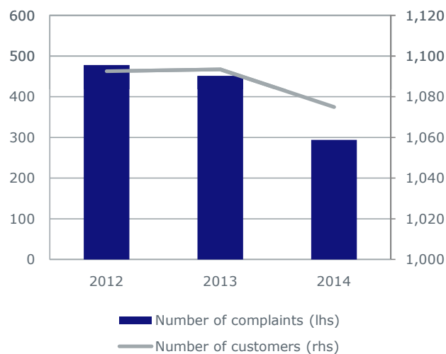
Number of complaints