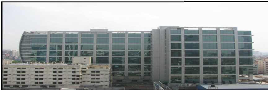
Momen Business District, Corporate Head Office of Abdul Monem Group