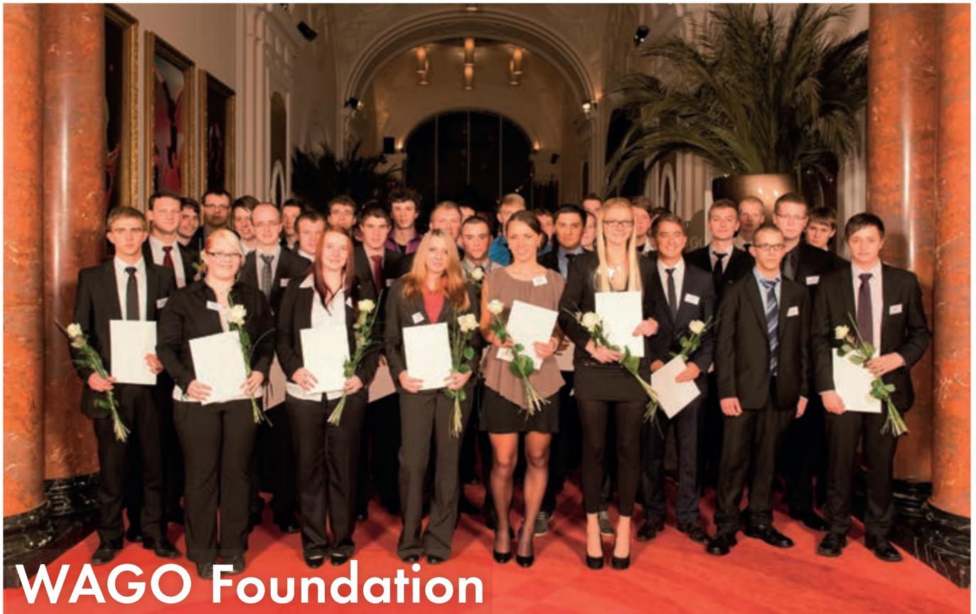
WAGO Foundation prize winners

WAGO supports education and on-the-job-training. The WAGO Foundation awards a prize of up to 1,000 euros each year to its three best graduates from nine different skilled trades in Minden, where the company's headquarters are based, and in Sondershausen, home to WAGO's main production site. Since its establishment, the foundation has bestowed awards in excess of 600 apprentices from over 110 companies for their special achievements with a grant volume exceeding 430,000 euros. WAGO also makes regular donations of its products to universities and schools for the purpose of promoting education. For example, a