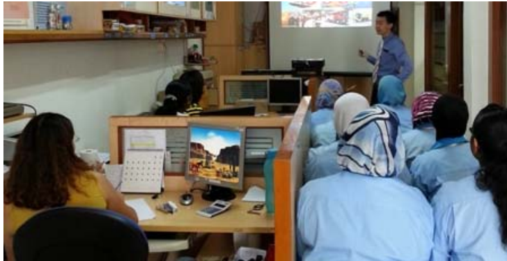
Briefing to employees on this handbook implement