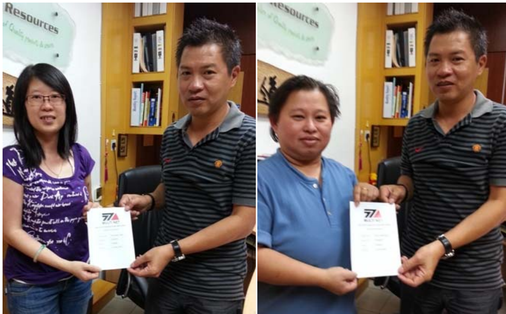
Signed and delivery handbook to employees