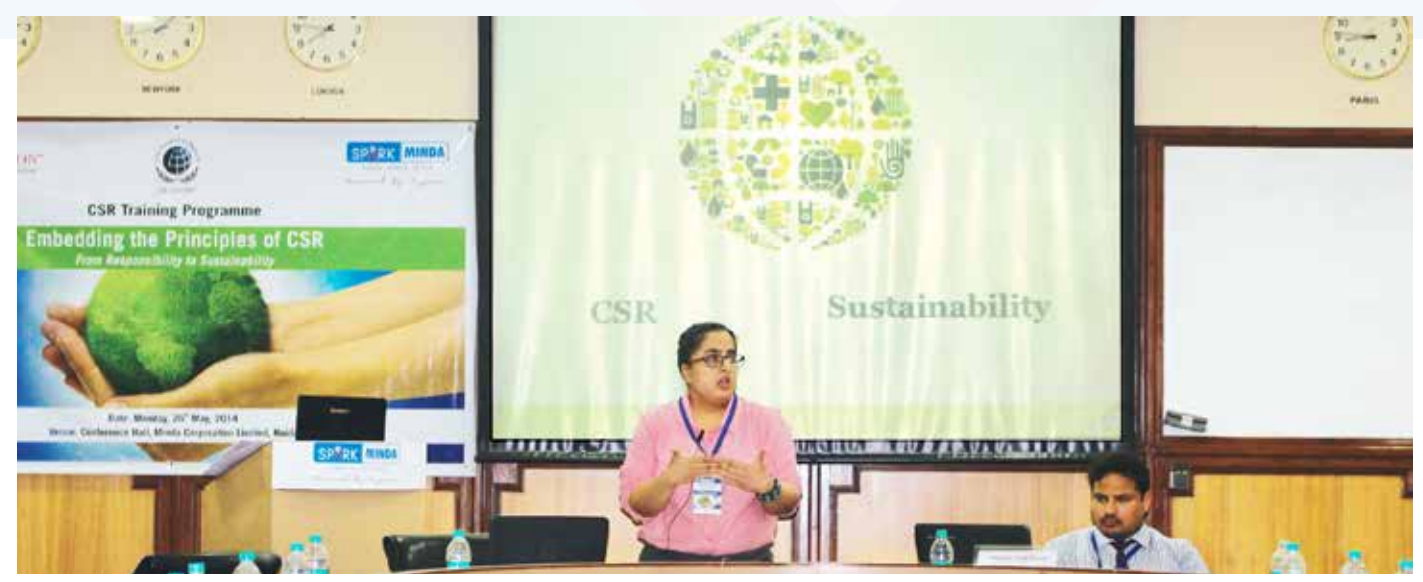
The evolution of Corporate Responsibility towards Corporate Sustainability was discussed.