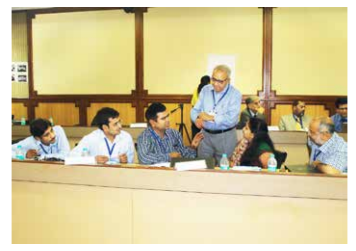
Sustainable development can only be possible through "partnership for all".