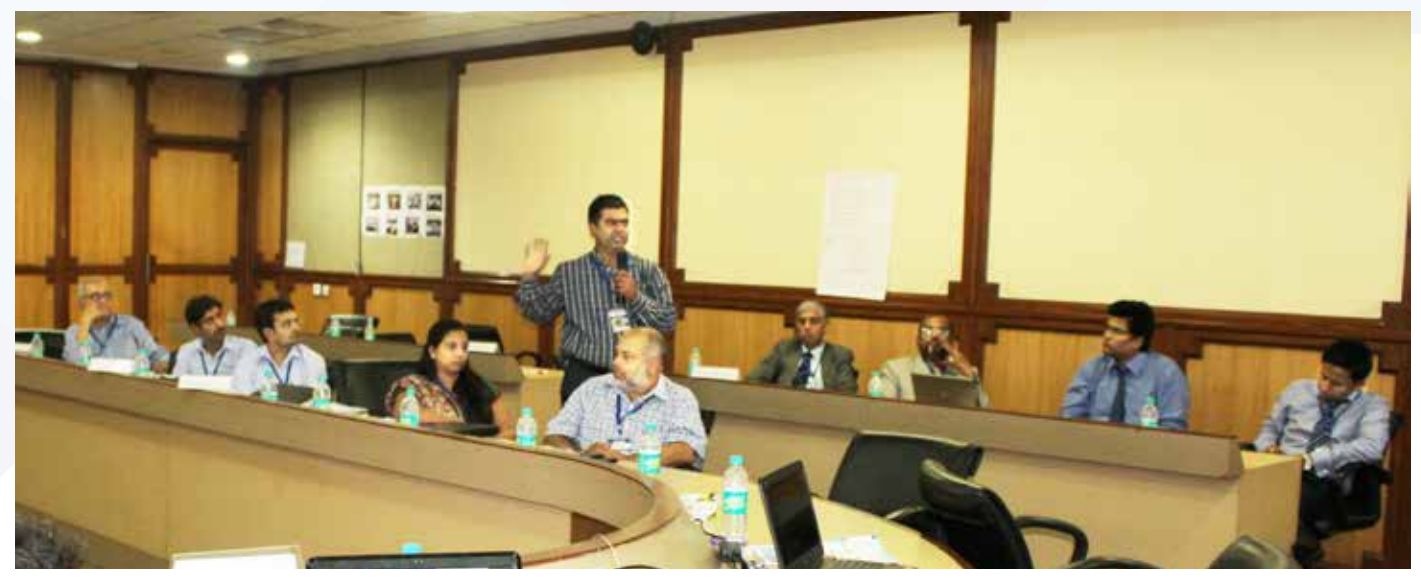
The participants sharing their views on The Companies Act, 2013.