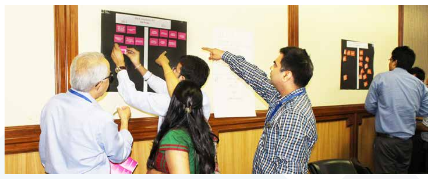
The session engaged participants through its hands-on exercise on the thematic areas categorization in 2012 and 2013.