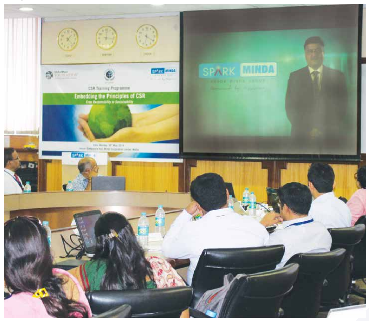
A short video presentation on Spark Minda Group.