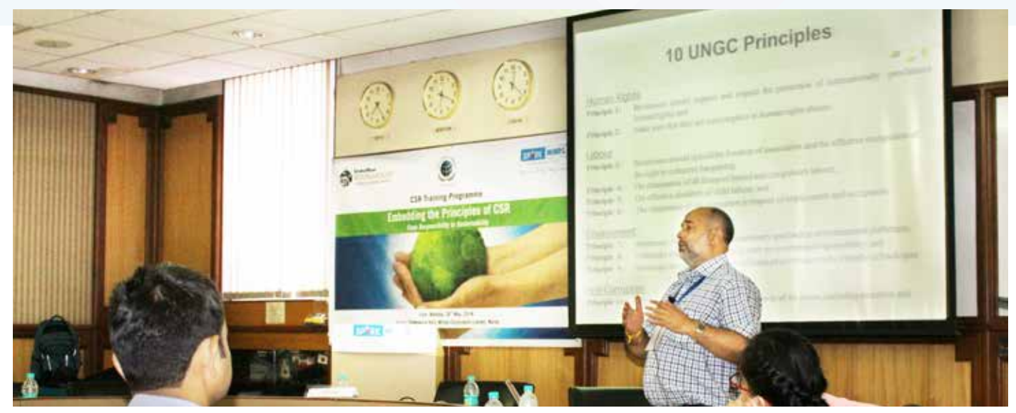
The signatory members have to commit to the 10 universally accepted principles of UNGC.