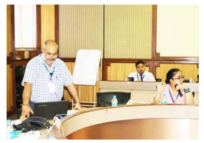
United Nations Global Compact is the world largest corporate sustainable initiative.