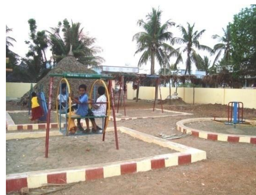
Play equipment to Schools in RH colonies