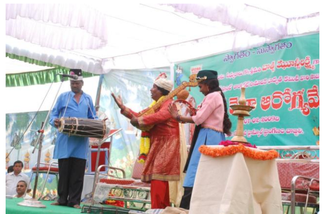
AIDS Awareness..observing World AIDS Day Street Play .. On AIDS awareness