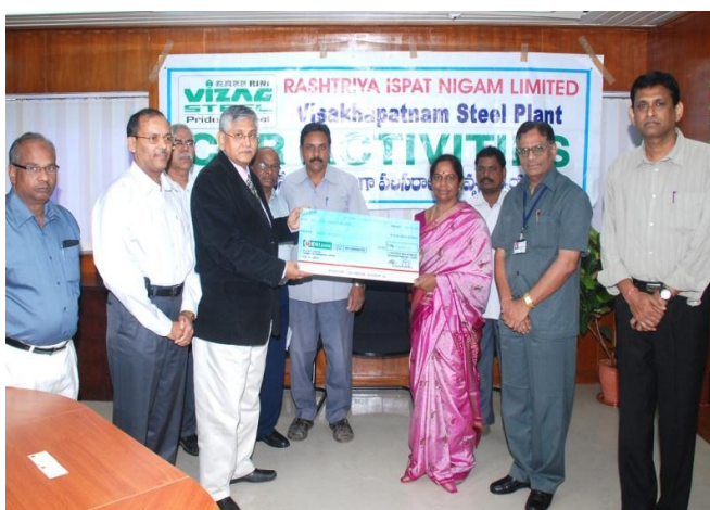
Support to M/s Vijaya Foundation, Kadapa