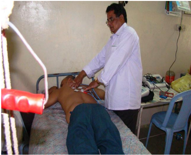
Patient care at Krushi Orthopedic Hospital