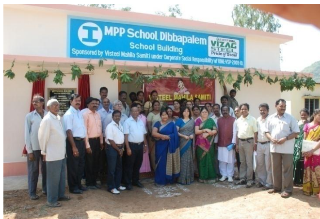
Additional Room for school