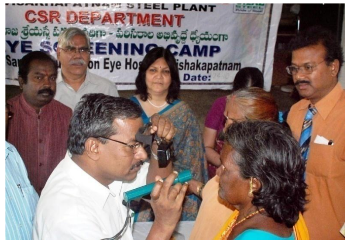
Eye Camp through Sankar Foundation