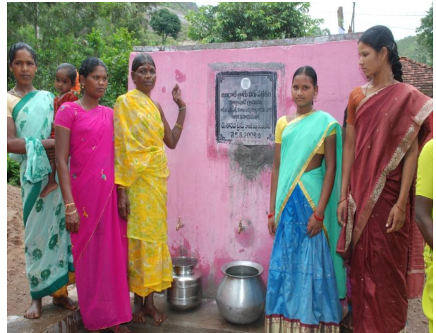
'Jaladhara' – Drinking water at door steps of Tribal people