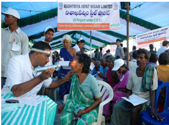
Eye Screening Camp