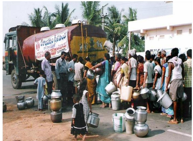
Drinking water supply