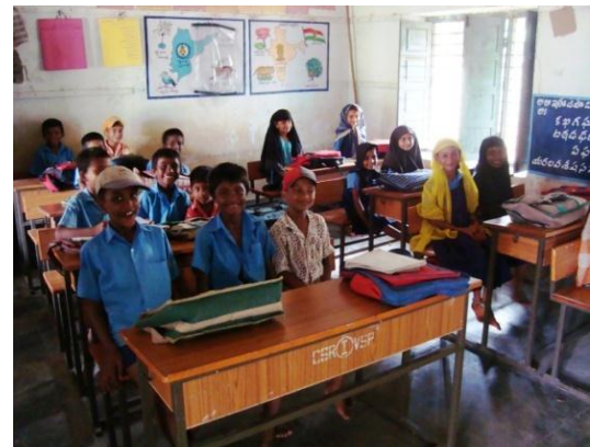
School furniture through Govt. ITI