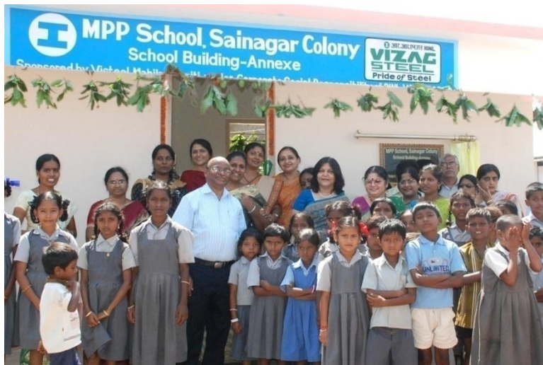
Kitchen & Class room for School

One of the CSR's primary objectives is peripheral development. Number of projects like community welfare centres in Rehabilitation Colonies and peripheral villages, Hostels for SC/ST students, School building for differently able children, Mother Blood bank for Indian Red Cross Society were taken up and are continuing.