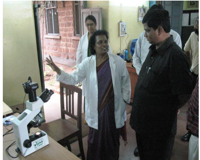
Equipment in King George Hospital