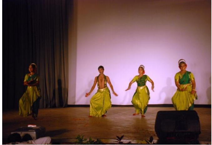
Ballet on 'Telugu Prasasthi