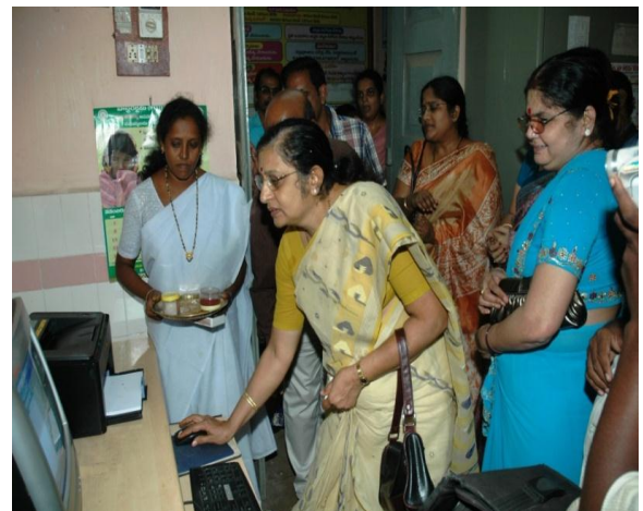
Infrastructure to Primary Health Centres for better service