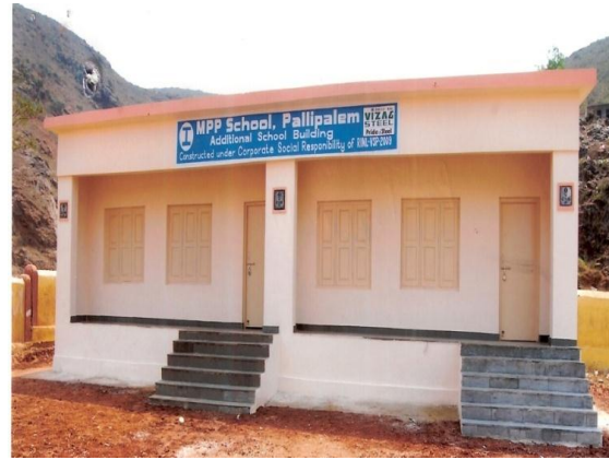
School building at RH colony