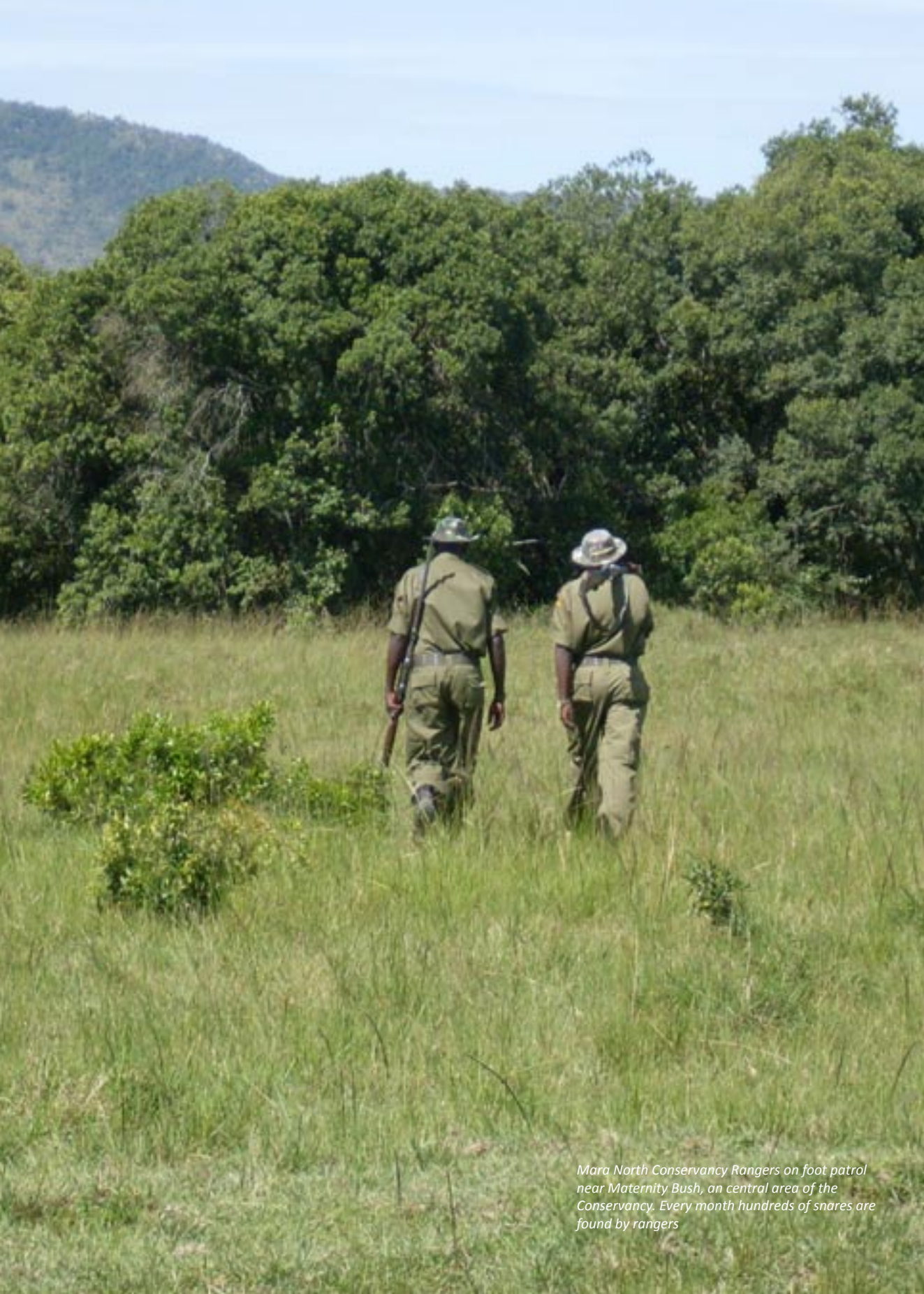
Mara North Conservancy Rangers on foot patrol near Maternity Bush, an central area of the Conservancy. Every month hundreds of snares are found by rangers