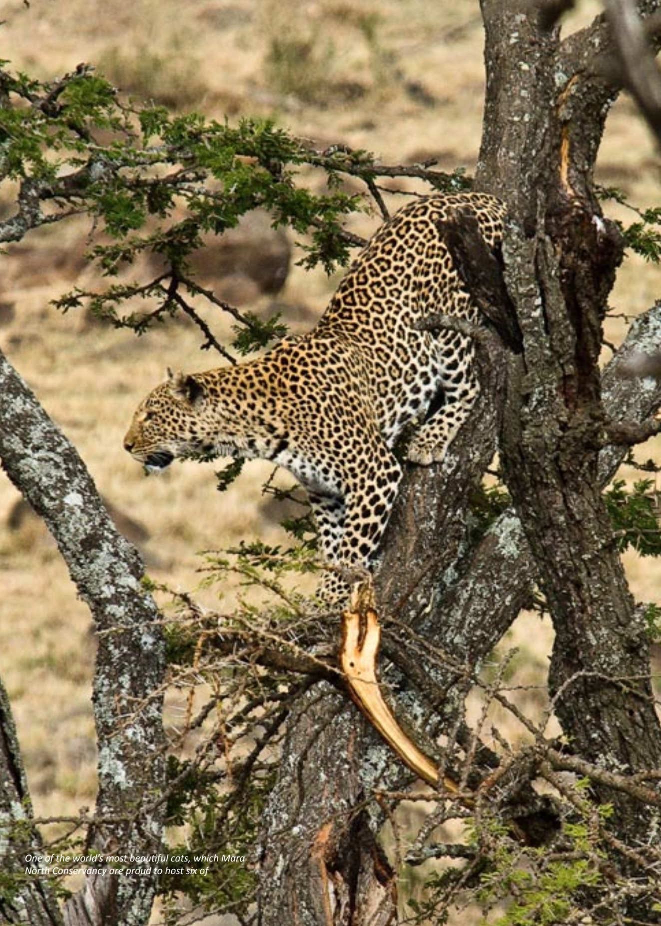
One of the world's most beautiful cats, which Mara North Conservancy are proud to host six of