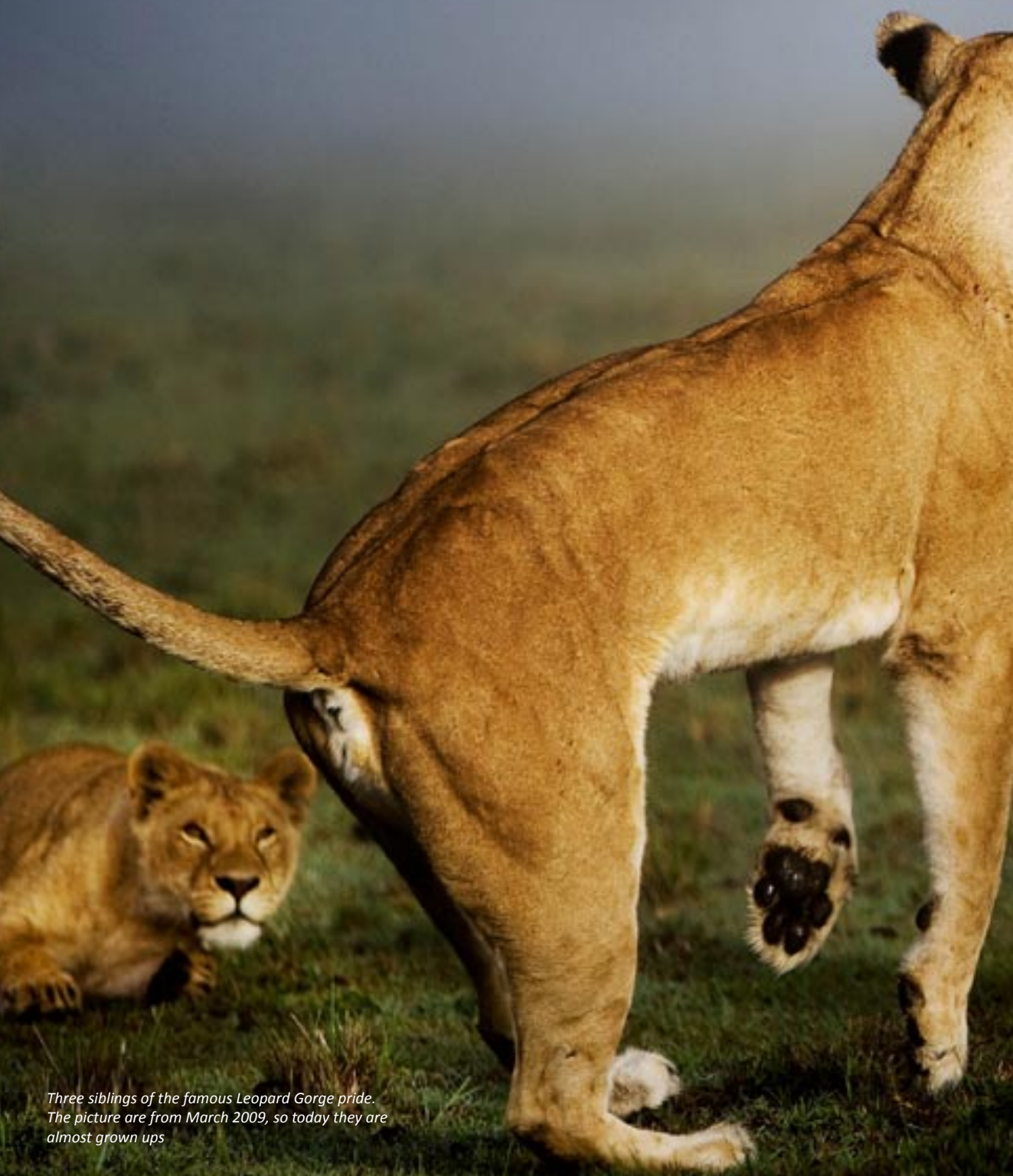
Three siblings of the famous Leopard Gorge pride. The picture are from March 2009, so today they are almost grown ups