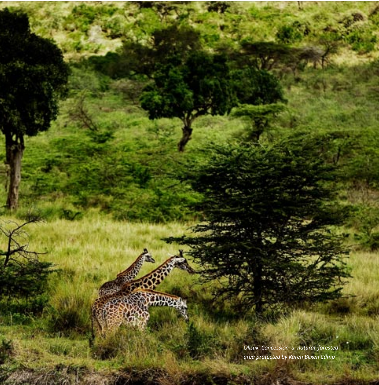
Olisuk Concession a natural forested area protected by Karen Blixen Camp

The Woodland 2000 Trust was established in 2001 with a grant from the British Government, DFID, Department of International Development's Business Partnership Program, in close partnership with the Tamarind Group. The Trust has facilitated the plantation of 700,000 trees in Kenya.