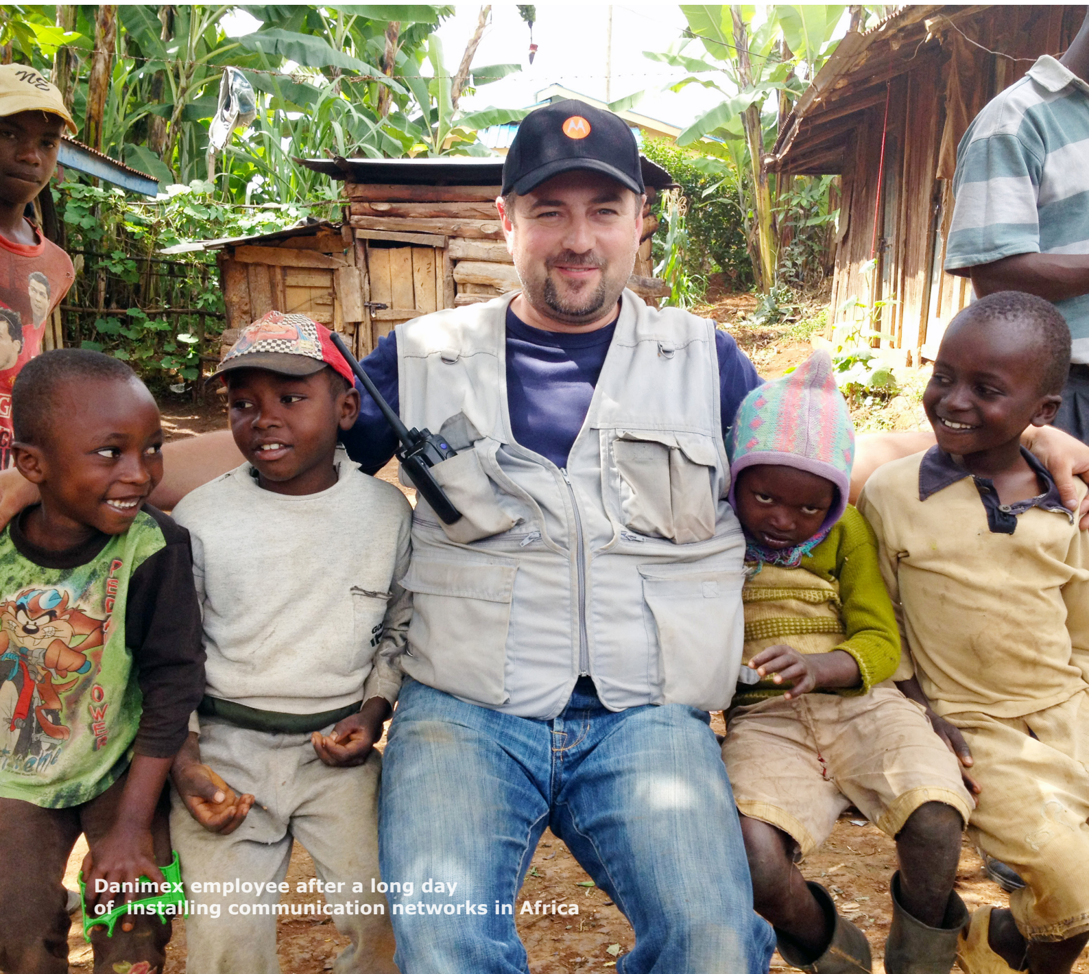
Danimex employee after a long day of installing communication networks in Africa