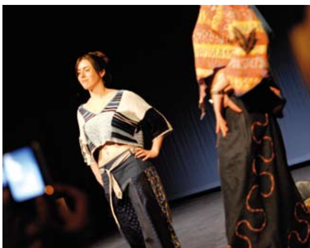
FAIR TRADE FASHION SHOW "Clothing the gap" fair trade fashion show organised on May 31, 2007 by students on the Global Responsibility track.