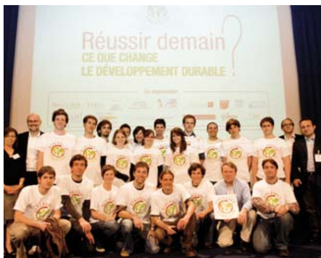
DIALOGUE EQUATION Discussion forum held on April 3, 2008 involving three schools: Audencia Nantes, the Ecole Centrale de Nantes and the Ecole des Mines de Nantes. The theme was 'Succeeding tomorrow? What sustainable development can change'.