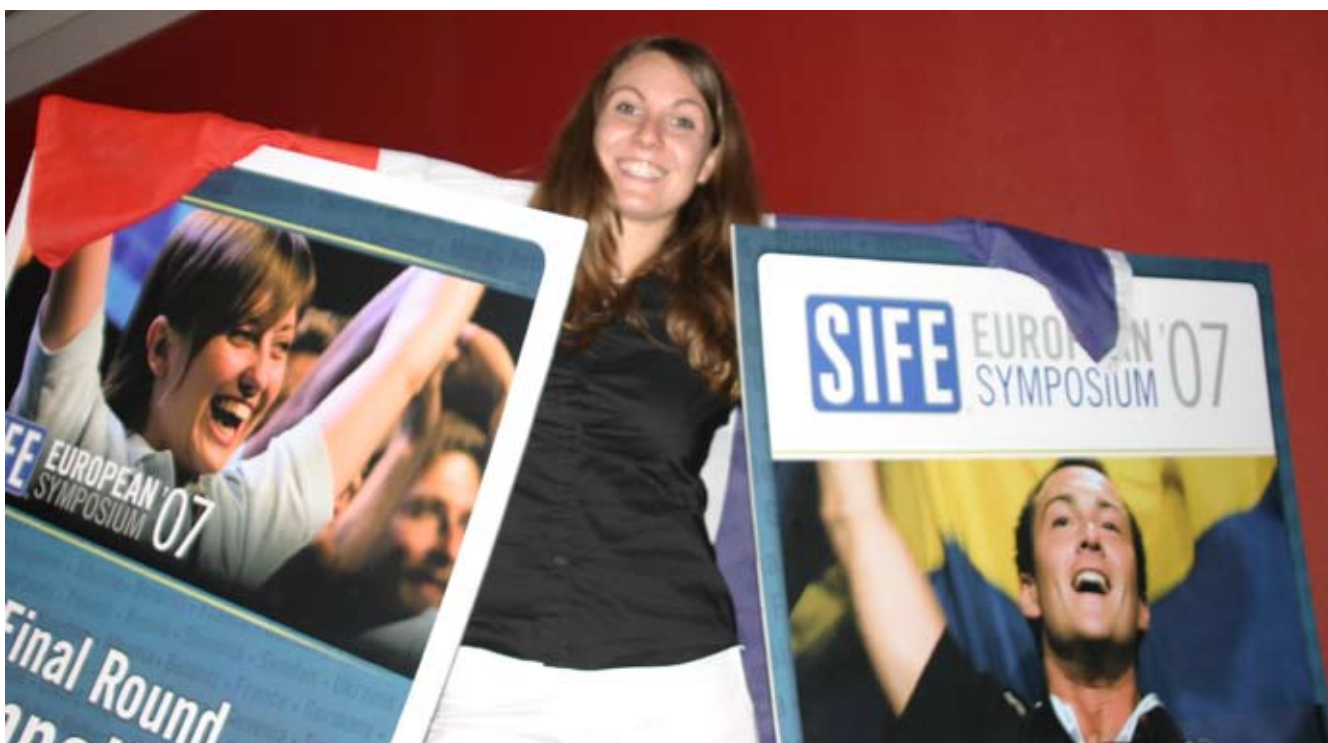
SIFE European final of the SIFE challenge won by a team of students from Audencia's Global Responsibility track in Warsaw on September 17 and 18, 2007.