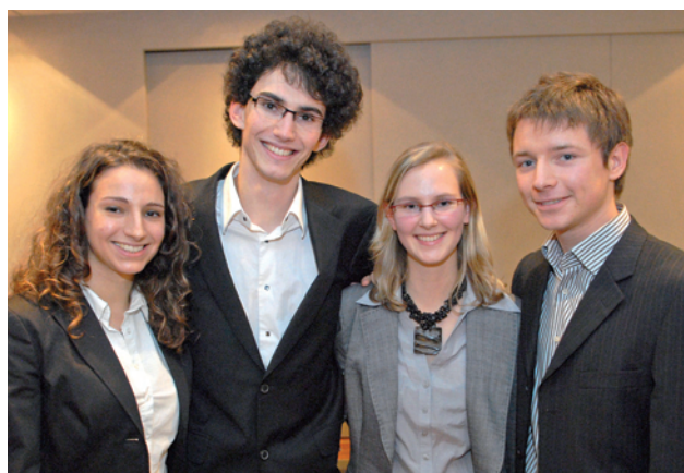
The students who won thanks to their " Res'hopito project".