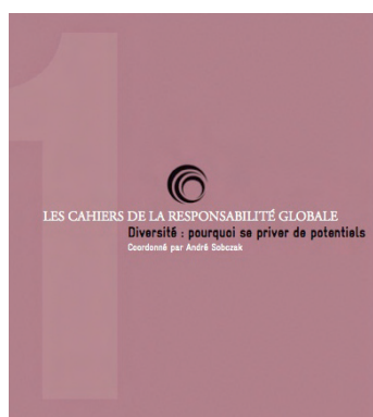
The Global Responsibility Journal n°1 cover.