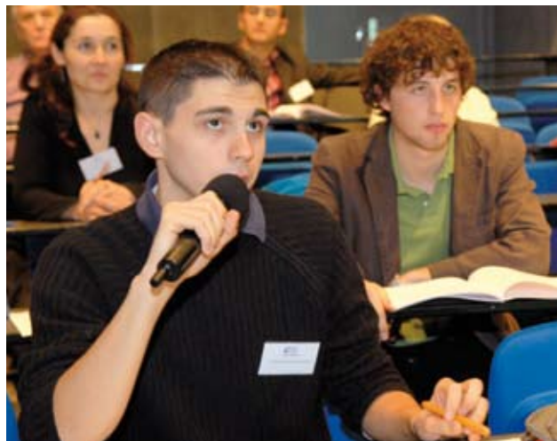
HALDE Seminar on the theme "Grandes Ecoles, a passport for equality?" organised by Audencia Nantes on December 12, 2007 as part of the European Year of Equal Opportunities for All.